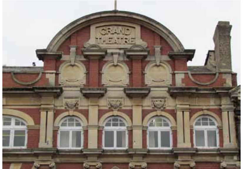
The facade of the Grand Theatre, built in 1905

Colchester's Hippodrome certainly saw a team of Indian elephants, as well as appearances by, among others, queen of the Music Hall, Marie Lloyd, and a then-unknown actor named Charlie Chaplin. He appeared at the Hippodrome as part of Fred Karno's very popular comedy sketch act, Mumming Birds. He was there in 1910 a matter of weeks before Mumming Birds travelled to the US, where Chaplin eventually made his name and his fortune.