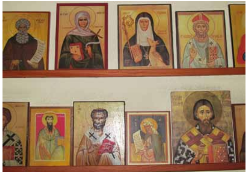
Icons inside St Helena's Chapel

Local legend has it that she was the daughter of Old King Cole, the King of Colchester, and that she met Constantine's father, Emperor Constantius Chlorus, while he was fighting a campaign in the province. Today, however, most historians believe she actually came from Turkey, but that didn't stop Colchester Victorians adopting her for their own! As well as this Chapel, which is now run by the Greek Orthodox Church, there is a school named after her.