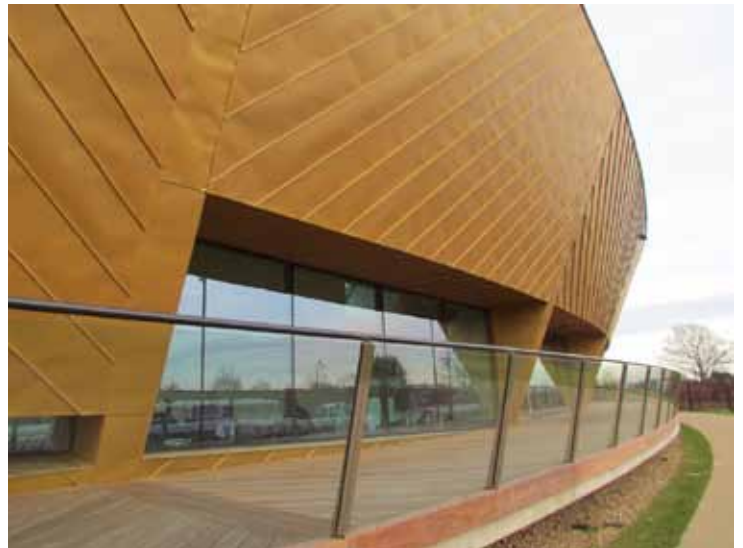
Firstsite reflects the town's contemporary culture

The route is about 1 ½ miles long. It begins at Colchester Town railway station and does a circuit of the town centre. It can be busy in the town centre so please take care and always use pedestrian crossings. I hope you enjoy the walk.