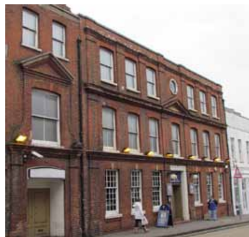
The former soldiers' home

In AD 60 the legion famously helped quell the rebellion led by Queen Boudicca after she had burnt Colchester to the ground. Later the legion was based at Chester and from there was involved in building Hadrian's Wall.