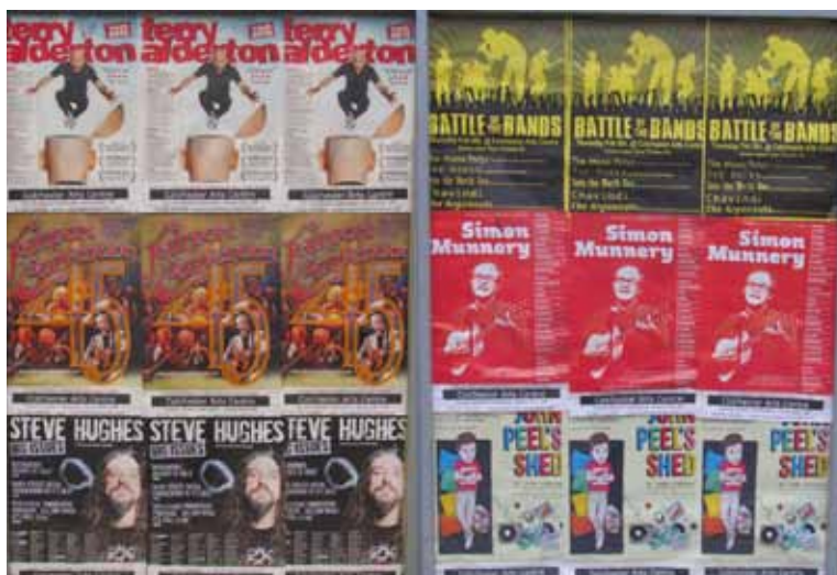
Posters outside Colchester Arts Centre

During the English Civil War, the Cavaliers (supporters of the king) fought against the Roundheads (supporters of Parliament). In 1648, there was a siege here in Colchester. A cannon was placed on top of the church by the Cavaliers, directing fire at the advancing Roundhead troops. Sir Thomas Fairfax, the Parliamentarian general leading the Roundhead attack, ordered that all attempts be made to knock the cannon off its perch. Local legend has it that either the cannon, or the man firing it, was known as Humpty Dumpty. Eventually the Roundheads succeeded in blowing the cannon off the wall, and all the king's horses and all the king's men could not put 'Humpty' together again. Did you know that was the origin of the rhyme that you know so well?