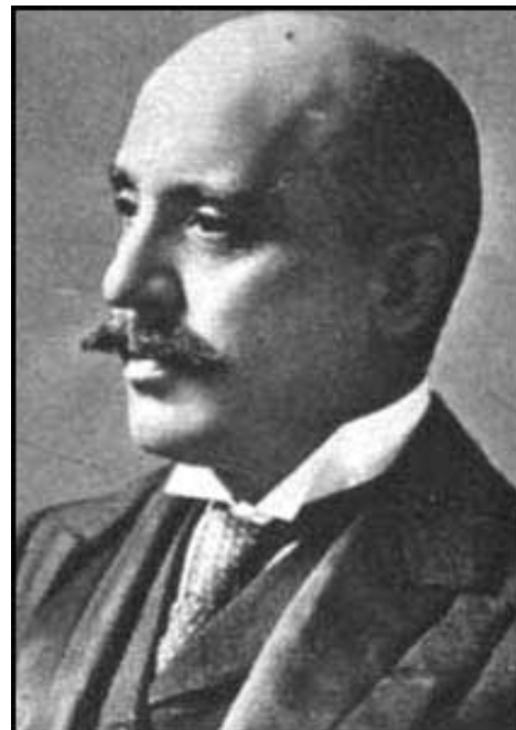
Viscount Cowdray

While building the Mexican railway, he struck oil. In fact, records say it is still the largest oil field ever discovered. He created the Mexican Eagle Petroleum Company, one of Mexico's largest firms, which was later taken over by the Royal Dutch Petroleum Company (now Royal Dutch Shell), the global oil and gas company headquartered in the Netherlands.