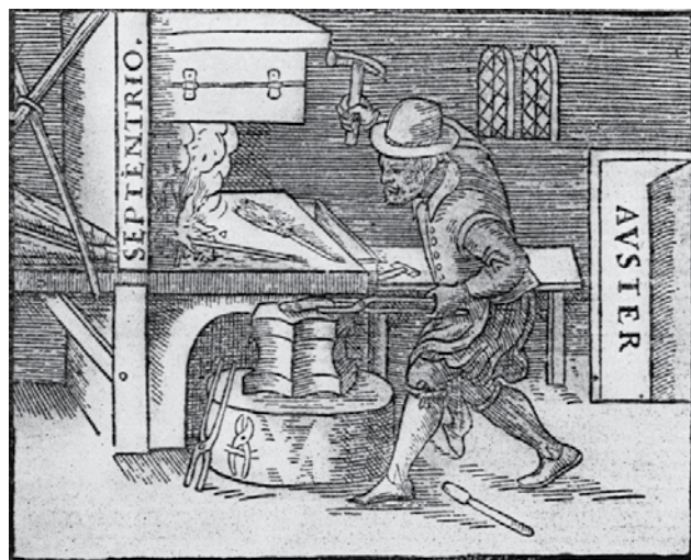
William Gilbert magnetising iron bars

There are a number of well-known Colcestrians buried in the graveyard including William Gilbert, or Gilbert as he is sometimes known. He was Elizabeth I's physician but perhaps more importantly is rightly regarded as the father of electricity. In his main scientific work De Magnete, Magneticisque Corporibus, et de Magno Magnete Tellure (in English On the Magnet and Magnetic Bodies, and on That Great Magnet the Earth ), which was published in 1600, Gilbert argued for the first time that the Earth was magnetic and that was why compasses pointed north. He also studied static electricity using amber. The Greek word for amber is elektron and so Gilbert called the phenomenon the electrical force.