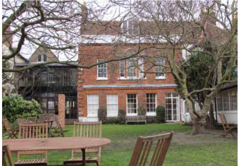
The garden at the Minories

It was originally a Tudor house, but was greatly transformed in Georgian times. During the 1800s, many tenants lived at the Minories including an immigrant German doctor, whose son, Harry Becker, became one of East Anglia's most famous painters.