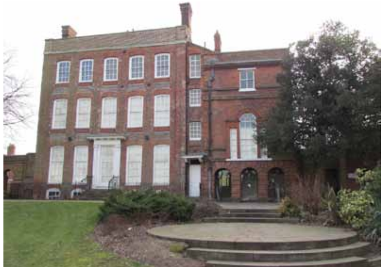
Hollytrees House