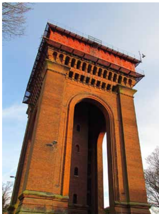
The impressive Jumbo water tower

Tragically Jumbo was killed when he was hit by an express train in Ontario, Canada.