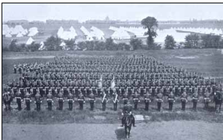
A parade on Abbey Field, Colchester (c.1898)

Fast forward several centuries and Colchester regained its military importance during the Napoleonic Wars, the series of wars between Napoleon's French Empire and coalitions of opponents including Britain. The first infantry barracks was built in 1794 and this grew over the next ten years to house more than 7,000 officers and men.