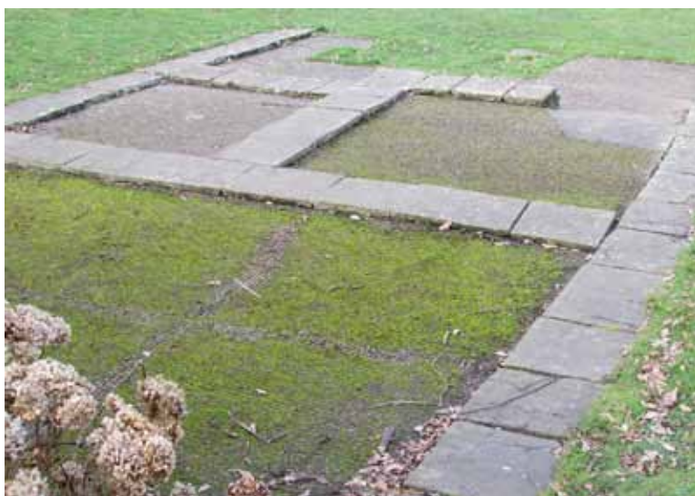
Floors of Roman townhouses excavated in Castle Park

He made his name partly from a series of well publicised excavations at Roman sites around the country. In 1920 he came to Colchester and, on this very spot, uncovered three Roman townhouses which dated back to the second century AD. These were rather grand houses with a Mediterranean style courtyard. Unfortunately most of the masonry was subsequently used to build the castle. All that's left are the terracotta-tiled floors.