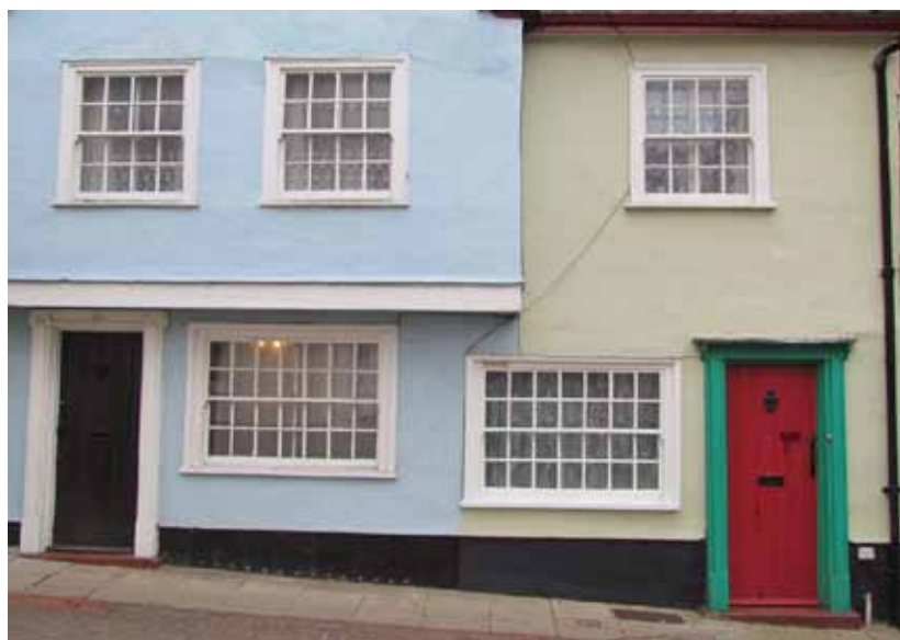
The large ground floor windows of the weavers' cottages

Many of them were highly skilled weavers and it was through their trade that Colchester soon became famous for its high quality cloths known as Bays and Says. The modern-day equivalent is the green baize that covers a snooker table.