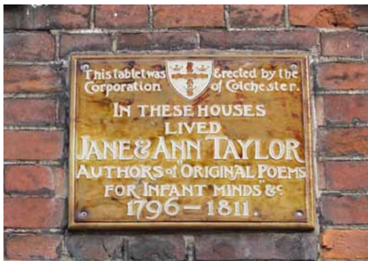
Twinkle House, home of the Taylor sisters

It was set to the French tune Ah Vous dirai-je Maman, which dates back to 1761. The German Christmas carol Morgen kommt der Weihnachtsmann also uses the melody, as does the Hungarian carol Hull a pelyhes fehér hó, the Dutch children's song Altijd is Kortjakje ziek, and the Spanish children's song Campanita del Lugar.