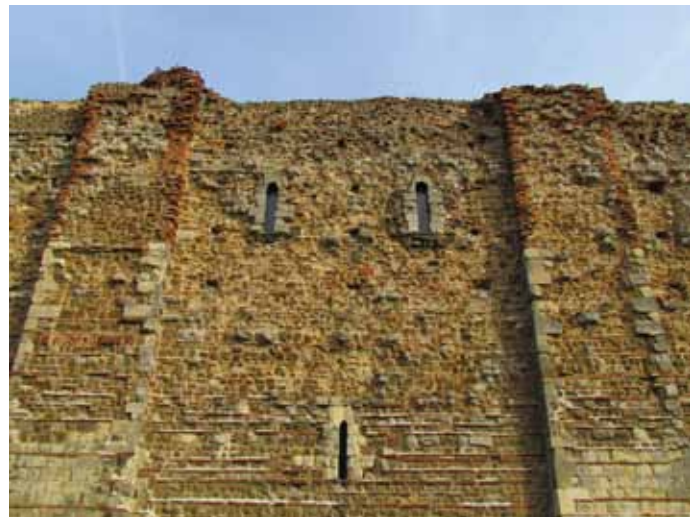
The walls of Colchester Castle

Colchester Castle may look old, but it is actually built on the site of an even older structure. During Roman times, this was where the magnificent Temple of Claudius stood. It was the grandest Roman building in Colchester and fitting for a town which the Romans had chosen as their capital of Britain. But when Queen Boudicca of the Iceni tribe sacked the town in AD 60, she burned the temple to the ground. You can still see the scorch marks in the vaults of the castle today.