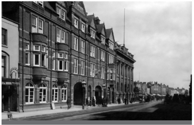
The Cups Hotel (1892)

Now you are going to have to use your imagination a bit because the beautiful building that was once the Three Cups is unfortunately no longer here. Looking at the town's High Street today, it's hard to imagine that it was the main road between London and the port of Harwich, and here once stood Colchester's most popular inn. It opened in 1701 as the New White Hart and Three Cups but the name was later shortened to just the Three Cups. It was the Travelodge of its day.