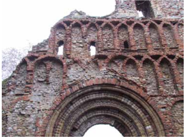
The ruins of St Botolph's Priory

Our story of Colchester is one of conflict and culture. And St Botolph's Church itself has experienced both over the years. To the left are the ruins of St Botolph's Priory and the present church stands where the kitchen and the refectory of the old priory would have been. Recent excavations have also revealed that a Roman house once stood next to the site.