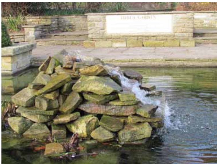
The Imola Garden celebrates the towns' twinning

The Colchester native oyster is a delicacy all over the world and was once harvested on the mud flats of the River Colne, the river which runs through the town. Now they are mainly grown on the mud flats around Mersea Island, about eight miles south of Colchester. That's where every September the mayor of Colchester officially opens the oyster fishery by dredging the first catch, eating gingerbread and drinking gin.