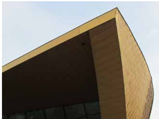
The Firstsite gallery

The building itself was designed by the world-renowned Argentinian-born architect, Rafael Vinoly. Inside is a section of Roman floor mosaic dating from circa 200 AD. It was discovered by accident in 1923 when a gardener dug a hole to dump some weeds! Also inside are exhibits of prestigious works from artists based all over the world. It is also, rather appropriately, one of the homes to Essex University's collection of modern Latin American art, Escala. The collection is now thought to be the best of its kind outside of Latin America with more than 745 artworks by 375 artists from 18 countries. It was established in 1993, following the donation of a work by Brazilian artist Siron Franco by a former student of Essex University.