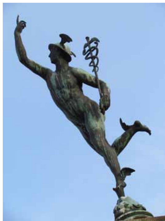
Mercury atop his eponymous theatre