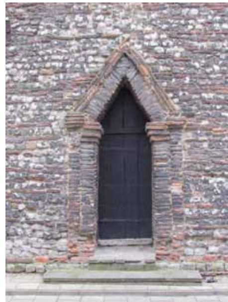
A Saxon door at Holy Trinity Church

We have heard about some of the town's more noteworthy individuals who made their mark with oil discoveries, scientific discoveries and archaeological discoveries. We've also heard about people who passed through here or settled here, ranging from novelists and painters to artisanal weavers and an exiled king. We've also seen the strength of culture here in Colchester, both in the past and today, with a vibrant contemporary cultural scene ranging from art and music to theatre and museums.