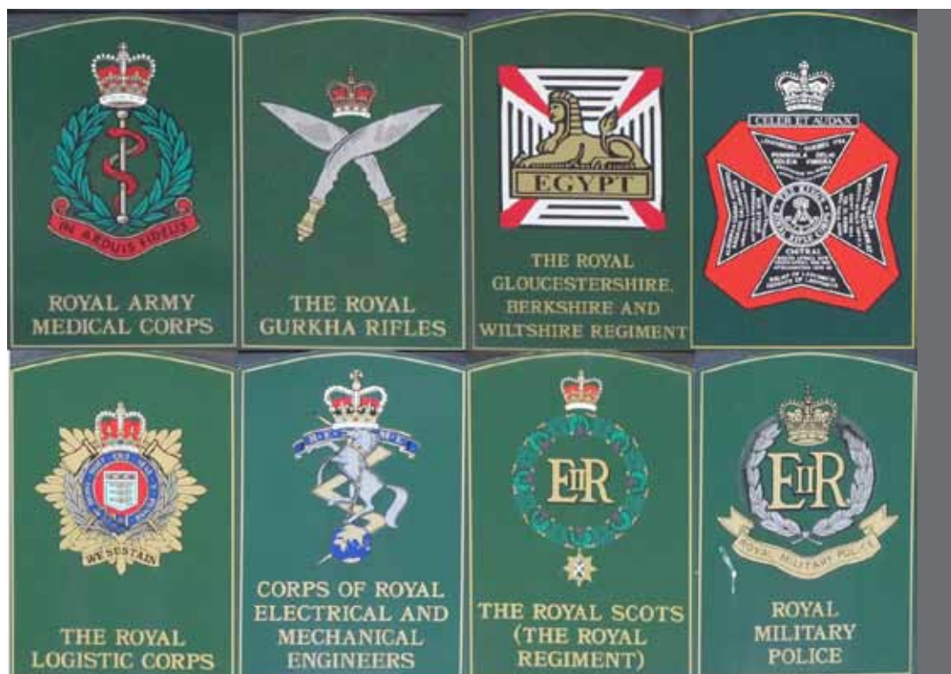
Part of a display of regimental insignia

Today, Colchester Garrison is home to 16 Air Assault Brigade, which has been posted to Iraq and Afghanistan in recent years, and recruits soldiers from all over the Commonwealth including Olympic and Paralympic nations such as Australia and New Zealand, Canada, India, African countries (such as South Africa, Botswana, Zambia, Zimbabwe, Uganda, Kenya and Ghana), Caribbean nations (such as Jamaica and St Vincent) and Pacific nations (such as Papua New Guinea and Fiji).