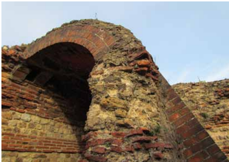
The remaining arch of the Balkerne Gate

This is the largest free standing Roman Gate left in Britain and was the city's main entrance in Roman times. When the Romans conquered Camulodunum in AD 43 they initially set up a fortress with a military gate here. Soon afterwards they decided to establish their capital city here, which they called Colonia, and which was a planned settlement inhabited by military veterans. Queen Boudicca's sacking of Colonia in AD 60 led to another re-build, this time with one of the first brick walls to be constructed in the country.