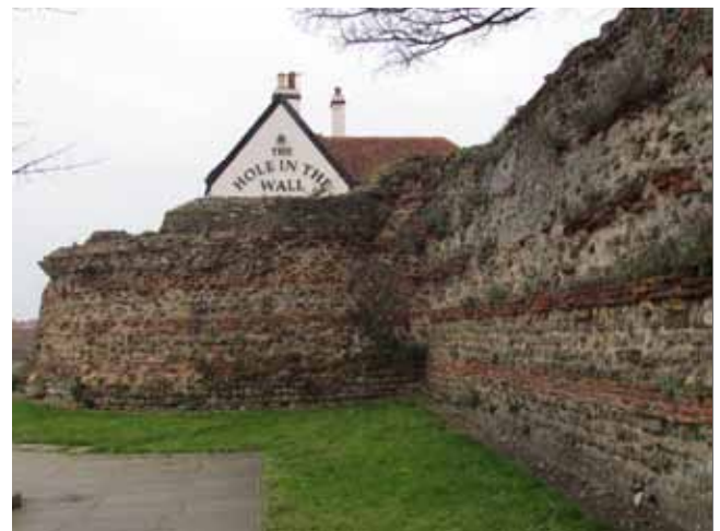
The Roman walls are evidence of Colchester's military past