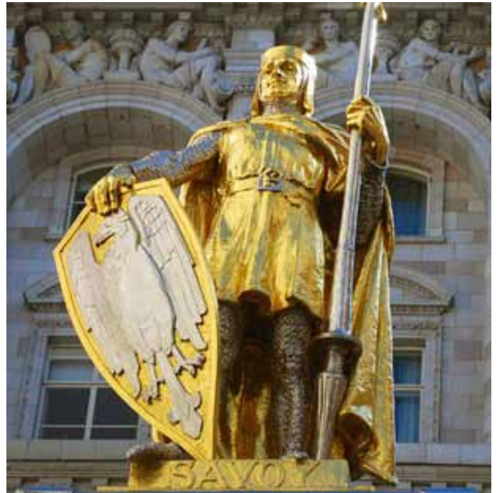
Count Peter II's statue at the Savoy Hotel

The family of Savoy were from an area now on the borders of modern day France and Italy. The gold statue you can see on top of the hotel façade is of Count Peter II. Count Peter's niece, Eleanor of Provence, was the queen-consort of Henry III of England. King Henry III made Peter the Earl of Richmond and, in 1246, gave him the land between the Strand and the Thames. Peter built the Savoy Palace here in 1263.