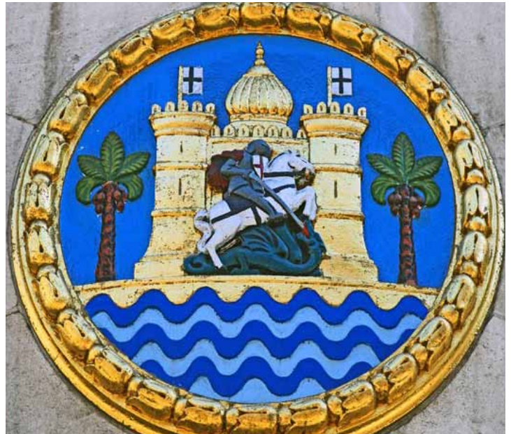
One of the plaques at India House

You might notice India House is rather different in style to Australia House and Bush House that we have already seen. Somehow it seems less confident, less heroic. It was completed in 1930 and reflects the changing political relationship between Britain and India in the interwar period. In 1920 a High Commissioner of India had been appointed as the first step towards Indian self-government.