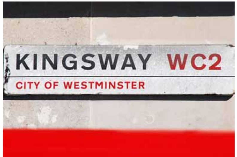
Kingsway street sign

The road opened in 1905 but it took almost 20 years for the buildings along the sides of the street to be developed.