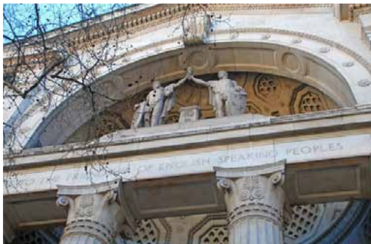
Statues at the entrance of Bush House

The original plan was for Bush House to be an international trade centre. The statues of a lion and an eagle symbolise Britain and America, with the eagle made to represent a growing global commercial power and the hopes for a prosperous trading relationship between the two countries.