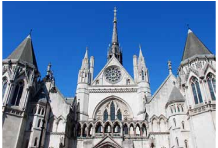
Details of the ornate Royal Courts of Justice

English Law is built on the Common Law system which is based on the idea of precedent. Great weight is placed on the decisions reached in the courts and these become part of the law for future cases.