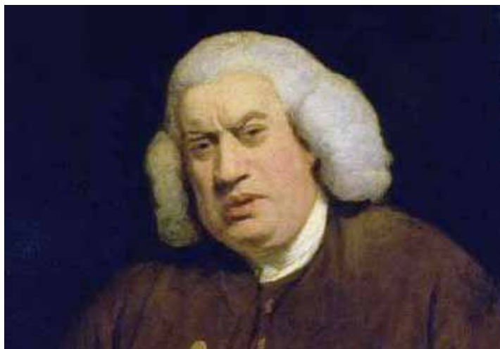
Portrait of Samuel Johnson, 1772

The title page acknowledged that Oxford University had awarded Johnson a Master of Arts degree in anticipation of the work. Johnson's dictionary was not the first to be published but it became the most commonly used. It was described as "one of the greatest single achievements of scholarship".