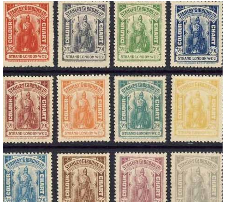
Stanley Gibbons colour guide stamps, pre-1935

Stamps were used by people sending mail across the Empire. They were also soon introduced by other countries. The Canton of Zürich in Switzerland issued stamps on 1st March 1843. Brazil followed later the same year and then the United States in 1847.