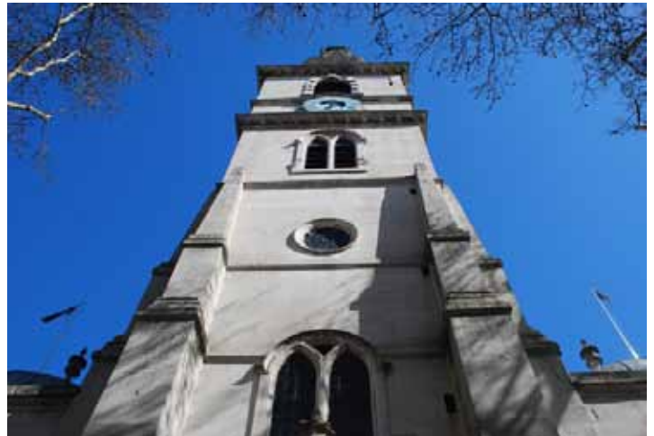
St Clement Danes Church tower

In front is a statue of William Gladstone, who served as prime minister on four separate occasions. He was also Britain's oldest serving Liberal prime minister retiring at 84 – a record not yet bettered. He and his great conservative rival, Benjamin Disraeli, served Queen Victoria when the British Empire was at its zenith.