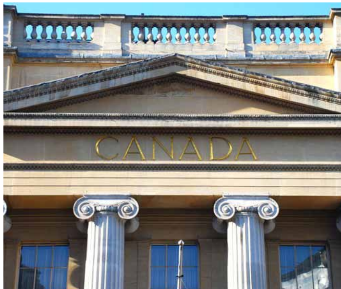
Canada House detail

In the distance of just over one mile, this walk has taken you on a grand tour of the British Empire and shown how the Empire created international connections of all kinds.