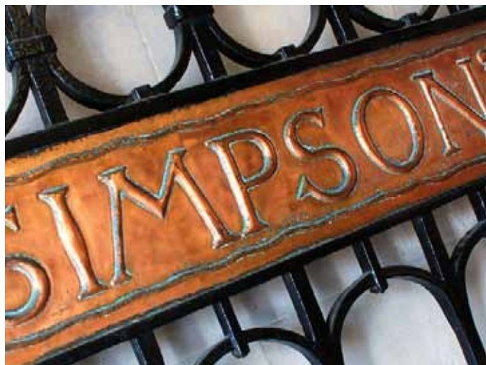
Simpson's signage

Chess has a long history that goes back 1,500 years when the earliest form of the game originated in India. From there it spread to Persia, then across the Muslim World and into Europe. The game developed into its current form in the fifteenth century.