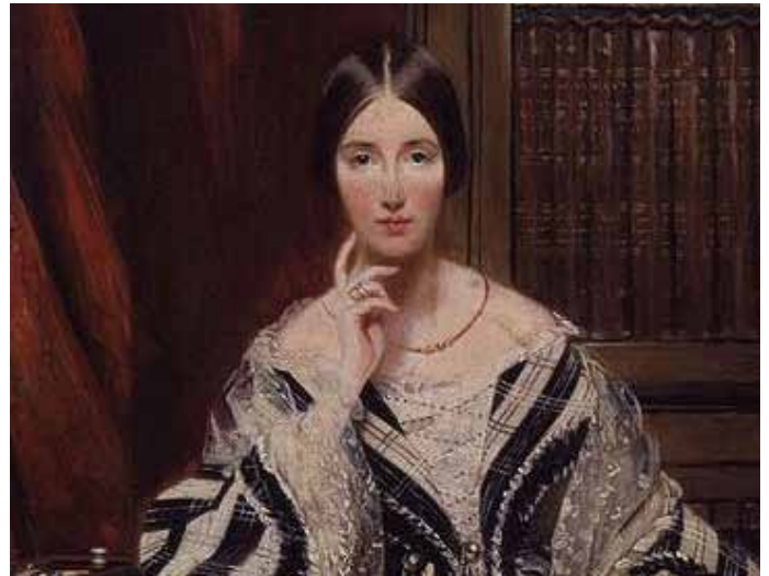
Angela Burdett-Coutts, circa 1840

Through the eighteenth and nineteenth centuries, Coutts' customers were closely involved with such events as the American War of Independence, the French Revolution and the Napoleonic Wars.