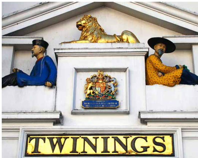
Twining's tea shop entrance

At first tea was an expensive luxury product among the upper and middle classes. Thomas Twining, a tea merchant, opened this shop in 1706 to cater to these people.