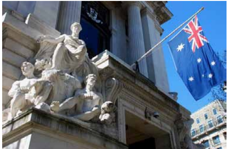
Australia House entrance

In 1900 work began on clearing a notorious slum which covered this area and building a bold new vision of a modern city. Many of the buildings were directly concerned with Imperial government – as we shall see – and you can sense that their grand architecture expresses confidence, power and authority.