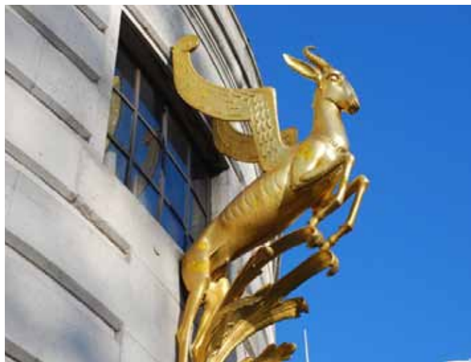
Springbok on South Africa House

In 1961 South Africa became a Republic. It also withdrew from the Commonwealth due to its policy of racial segregation. Accordingly the building became an Embassy rather than a High Commission. During the 1980s the building was targeted by protestors from around the world campaigning against South Africa's policy of apartheid.