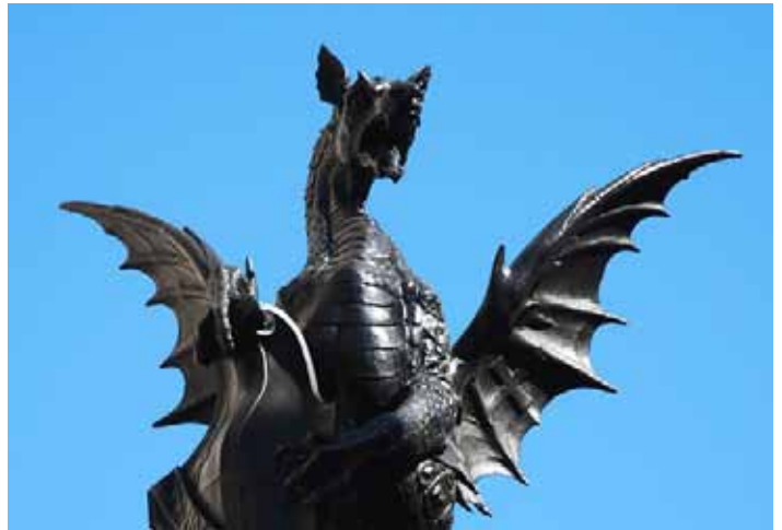
The Temple Bar Memorial dragon

You are now at the entrance to the City of London. This point where Fleet Street becomes The Strand marks the western limit of the City. Previously a stone gateway stood here designed by Christopher Wren, but as traffic grew it became an obstacle. In 1878 it was replaced with the current memorial designed by Sir Horace Jones. On the top the winged dragon is the symbol of the City of London. This is derived from the figure of Saint George in conflict with the dragon. According to tradition, Saint George was a Roman soldier from the province of Syria Palaestina.