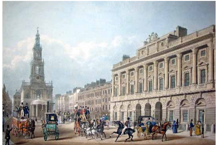
Somerset House in 1836

The house was not actually finished in his lifetime. In the reign of Elizabeth I, Edward Seymour was tried for treason and executed. The house then became the property of the crown.