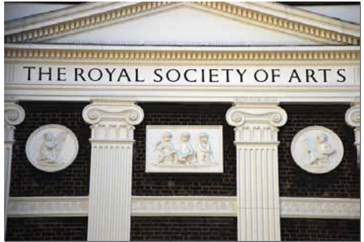
Detail from the Royal Society of Arts building

Founded in 1754, the RSA was granted its Royal Charter in 1847 during the reign of Queen Victoria. The RSA was responsible for staging a number of exhibitions. These led to the Great Exhibition of 1851. The Great Exhibition was the brainchild of Henry Cole. As a member of the Society, Cole was introduced to its president, Prince Albert.