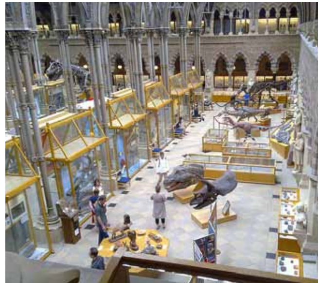
The OU Museum of Natural History Dinosaur Gallery Wikimedia Commons

As we found in the Ashmolean Museum earlier, museums are a treasure-trove of international connections. The collections here are broadly divided into four main areas of natural history. The first theme is entomology, or insects. There are over five million specimens here making it the second biggest collection in Britain. The second theme is geology, which includes fossils of flora and fauna. The third theme is mineralogy and petrology, which includes over 30,000 mineral specimens from all over the world as well as collections of gemstones, meteorites and mineralogical instruments. The fourth theme is zoology, which includes more than 250,000 specimens of mammals, birds and crustaceans. It's not surprising that this museum has been described as a 'Cathedral of Science'.