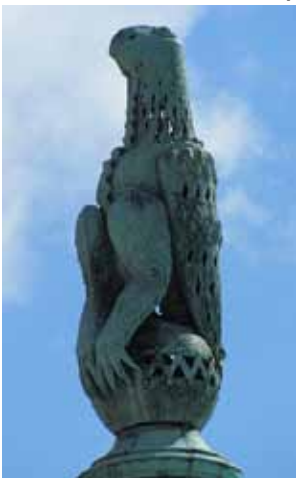
The Bateleur eagle

Of interest to our walk though is the distinctive bronze bird on top of the dome. It is a Bateleur eagle commonly found in the open savannah country of sub-Saharan Africa. The word 'bateleur' is French for 'tight-rope walker' because during flight the bird tips its wings as if balancing on a wire. The Bateleur eagle is the national emblem of Zimbabwe and therefore also known as the Zimbabwe Bird. It appears on the Zimbabwean flag, coat of arms, banknotes and coins.