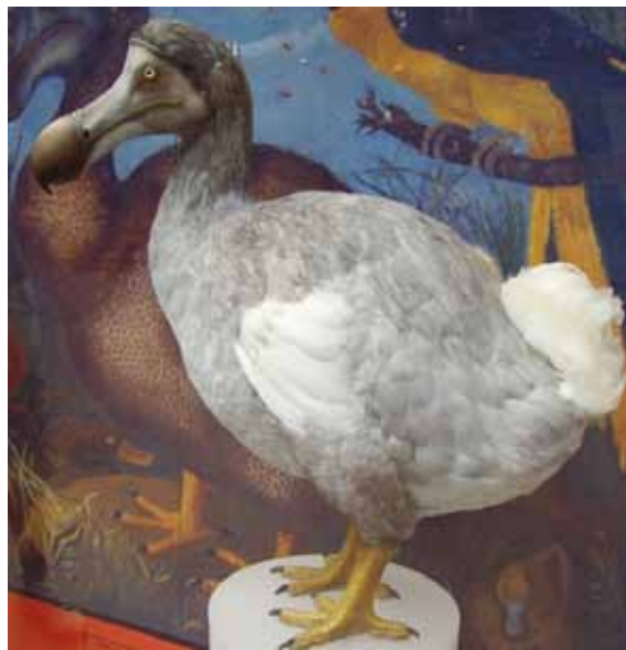
The Museum's Dodo reconstruction

One of the museum's well-known exhibits is the world's most complete dodo which is to the left of the Main Court. The flightless bird was endemic to Mauritius in the Indian Ocean. When humans settled on the island they destroyed much of the forest where the birds made their homes, while dogs and cats brought by the settlers plundered their nests. It became extinct in the late seventeenth century just over 100 years after its discovery and is now often used to symbolise the extinction of a species as a direct result of human activity.