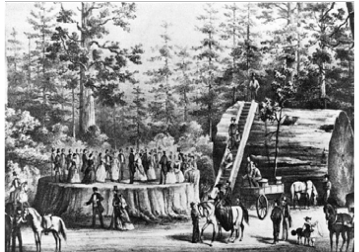
A lithograph showing 32 people dancing on the stump of a giant sequoia found in California in 1853

This group of six tall trees are Wellingtonia trees, or giant sequoias. Their Latin name is sequoiadendron giganteum . In the Victorian era, it became fashionable to have these giant trees in gardens.