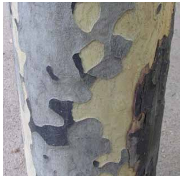
An exfoliating London Plane tree, St Giles

The Oriental Plane was first recorded in the literature of ancient Greece, from whose name, Platane, our modern tree's name originates. The tree is also recognisable from Turkey to India, although named as the Chenar, following a root of Iranian language.