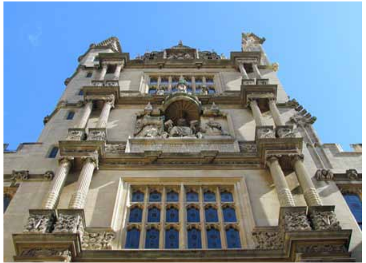
Bodleian Library carvings

Gargoyles can be found throughout Europe, particularly on churches and public buildings. They first started to appear on European buildings in the twelfth century.