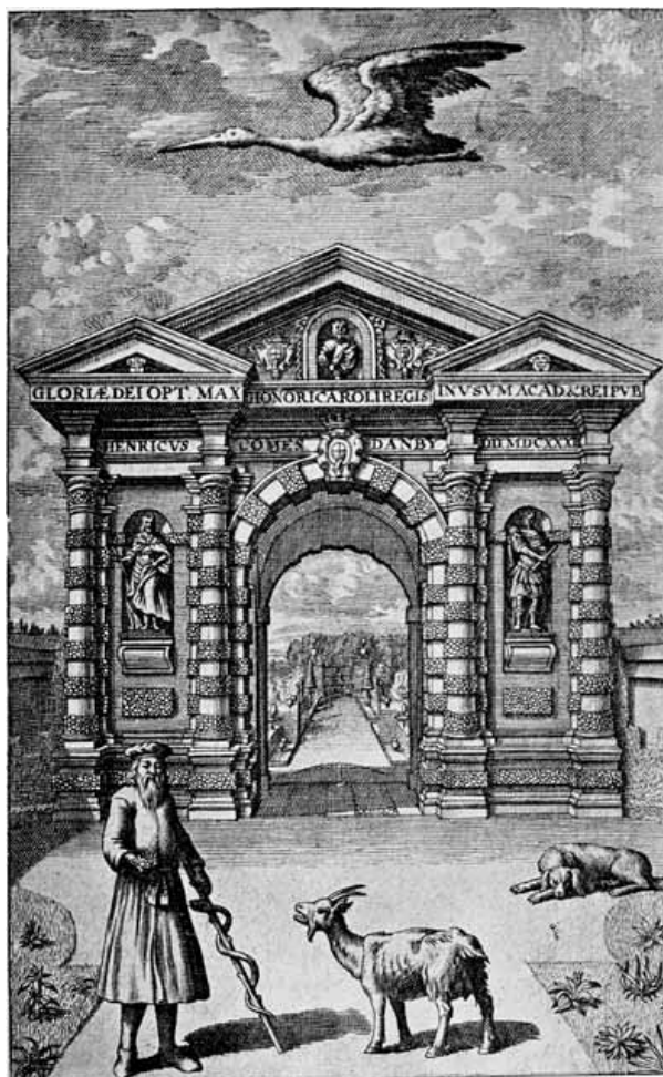
A woodcut of the 'Great Gate of the Physic Garden, Oxford', now known as the Danby Gate

You need to pay to go into the gardens. The price varies according to the time of year but it is well worth a visit. Inside are over 7,000 specimens from around the world grown for scientific and conservation research. In the Tropical Lily House you can see examples of cash crops such as bananas, sugar-cane and rice, while the Palm House features ginger, cocoa, coconut and oil palm.