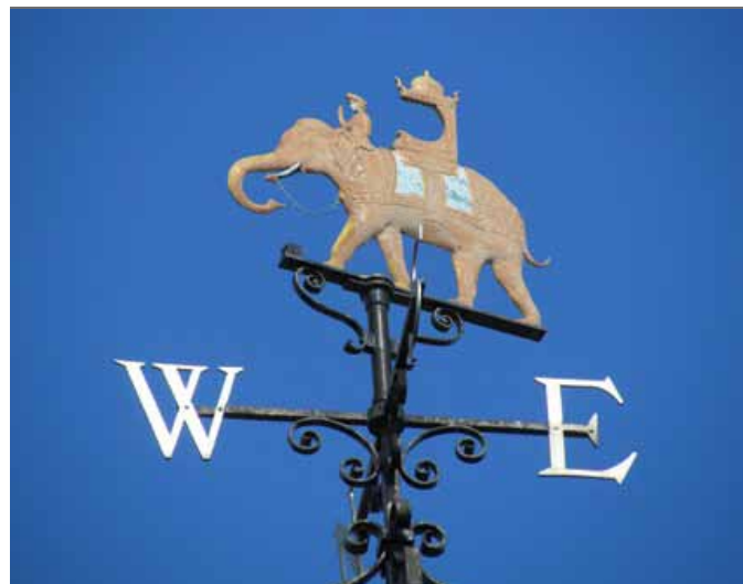
The Indian Institute weathervane

In particular it was a training place for those entering the Indian Civil Service and managing Britain's greatest colony. This building was constructed in 1883 and certainly reflects the Indian influence.