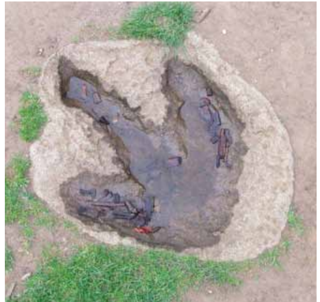
Megalosaurus footprint

The Megalosaurus was nine metres long and walked on its hind legs much like the Tyrannosaurus Rex. Its name is from the Greek for 'great lizard'. As you can see it had three toes and big claws. The Megalosaurus was the first dinosaur species ever recorded in Britain when a femur was found in Chipping Norton near Oxford in 1676.