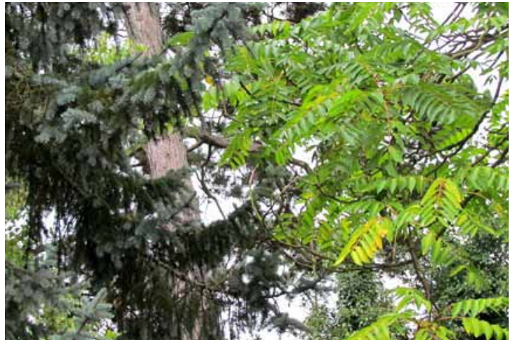
Various tree species at the University Parks

As you have already heard this arboretum has species from all around the world. As you walk look out for the Coronation Clump which was planted to mark the coronation of Queen Elizabeth II in 1953. It includes an Italian Maple (native to countries such as Spain, Italy, Morocco and Algeria), the Aleppo Pine (native across the Mediterranean including Croatia, Greece, Tunisia and Libya), the Valonia Oak (also native to the Southern Mediterranean, the Balkans and the Greek Islands), and the American Smoke Tree (native to the southeastern United States).