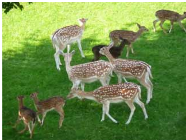
Fallow deer in Magdalen Grove

Magdalen College was founded in 1458. Some people consider it the most beautiful of the Oxford colleges and it is certainly the most-visited but there's more to it than the spectacular buildings. To the northwest of the college's grounds is a large meadow known as Magdalen Grove. In the sixteenth century the grove consisted of gardens, orchards, and bowling greens. During the Civil War it was used to house a regiment of soldiers. At one point in the nineteenth century it was home to three traction engines belonging to the works department of the college. By the twentieth century it had become well-wooded with many large trees.