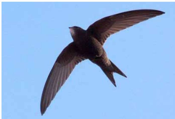
Common Swift in flight

Swifts are quite remarkable because they spend almost all of their lives in the air – day and night, winter and summer. A swift can spend the first two or three years of its life in the air before making its first landing to breed.