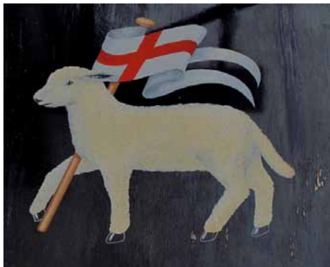
The Lamb and Flag pub sign, St Giles

This pub gives us an example of animals being used symbolically. In this case, the lamb represents the Lamb of God – or agnus dei in Latin. In ancient Israel, lambs were highly-valued possessions. But under the traditions of Abrahamic religion they were sometimes sacrificed to God in order to request forgiveness of sins. Jesus Christ was represented as being the perfect sacrificial lamb whose death brought forgiveness for all humankind. In the Bible John the Baptist says of Jesus: “Behold the Lamb of God who takes away the sins of the world” (John 1:29). The lamb and flag has therefore become symbolic of St John the Baptist.