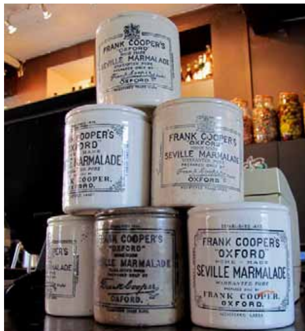
Frank Cooper marmalade jars