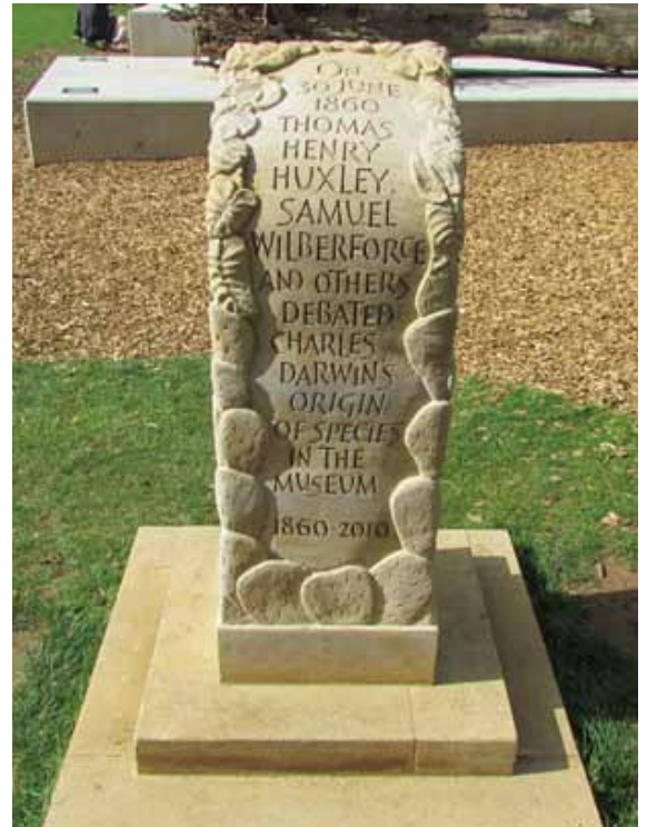
The 'Great Debate' monument

As a result of this voyage he formulated his theory of natural selection. This was published in 1859 entitled On the Origin of Species . Darwin's idea of evolution went against the commonly-held view that God was in control of creation. A year after his book was published there was a 'Great Debate' here in Oxford between the Bishop of Oxford, Samuel Wilberforce, and the biologist, Thomas Huxley. They debated natural selection in front of a vocal crowd of 500 people.