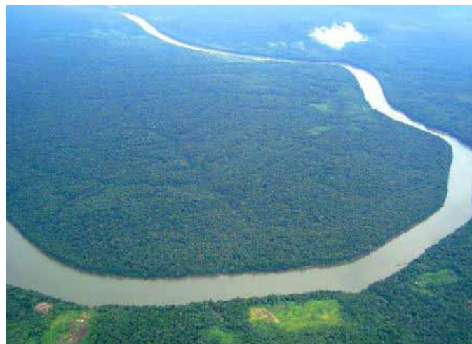
Aerial view of the Amazon rainforest, Brazil

One of the research programmes within the department is 'Plants for the 21st Century' which addresses questions in three major areas of global concern – crop production, species conservation and forest management.