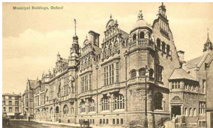
Oxford Town Hall (c.1905)

Welcome to Oxford. Here we are at the Town Hall. There has been a municipal hall on this site since the thirteenth century, though the current building dates from 1893. This very elaborate building is in a style called Gothic Revival. Just look at the detailing. But in particular have a look up. First look above the doorway at the coat of arms and see if you can spot an ox. Now look further up, at the weathervane on the roof. Did you find the ox up there as well? There are other oxen on the building too.