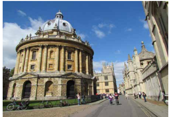
Catte Street, Oxford

Welcome to Walk the World, a project which celebrates the 2012 London Olympics and Paralympics by finding evidence of links between the UK and the 206 countries taking part in the Games. Walk the World is being developed as part of the Discovering Places Cultural Olympiad programme by the Royal Geographical Society (with IBG) in partnership with the Heritage Alliance.