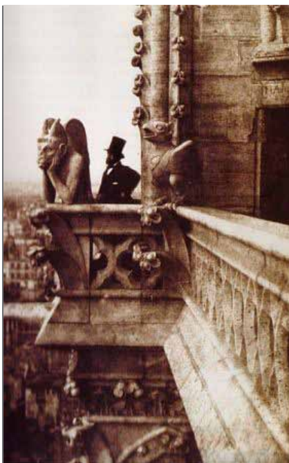
Gargoyles on Notre-Dame de Paris Cathedral, photographed in 1853 by Henri Le Secq Wikimedia Commons

They were often animals such as lions, dogs, wolves, eagles, snakes, goats and monkeys which were attributed with mystical powers. Some of the best examples are on the cathedral of Notre Dame in Paris.