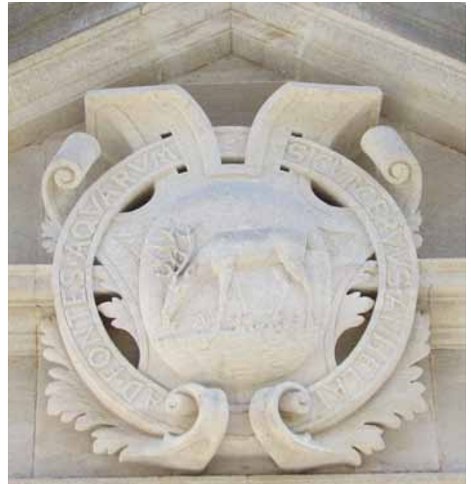
Hertford College coat of arms

A hart is a male red deer more than five years old. The red deer is one of the largest deer species. They are found across the United Kingdom and Ireland, much of mainland Europe, the Caucasus Mountains region and Asia Minor. They are also found in the Atlas Mountains in northwest Africa. In the nineteenth century red deer were introduced along with other game species for hunting to countries such as Australia, New Zealand, Argentina and Chile.