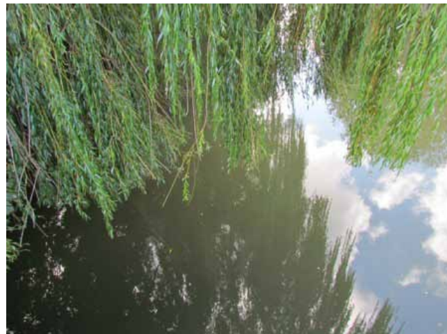
Willow branches over the Cherwell

Many centuries ago people discovered that the leaves and bark of the willow tree had medicinal properties. There is mention of it in ancient texts from Assyria, Sumeria, Egypt and Greece. It was used in concoctions to relieve fever and rheumatism as well as serving as an antiseptic and disinfectant. These days the chemical salicin found in the bark is used to make aspirin. So next time you take an aspirin tablet for a headache, think of the graceful willow tree.