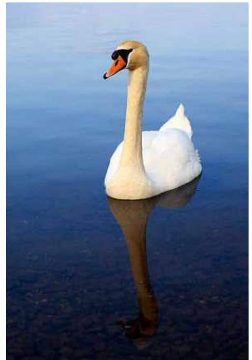
A Mute swan in Lake Killaloe, Ireland

On the river see if you can spot ducks and swans. The type of swan seen in Britain is the mute swan which originated in Eurasia. According to the United Nations Environment Programme the mute swan is found in 70 different countries, breeds in 49 of these places and is vagrant in 16 countries. In total there are about 500,000 mute swans worldwide, of which 70 per cent are in the former Soviet Union. The largest single breeding area is the Volga Delta on the Caspian Sea where there are about 11,000 pairs. The United Kingdom has about 22,000 of the birds. Other significant populations in Europe are in Germany, Denmark, the Netherlands, Ireland and Ukraine.