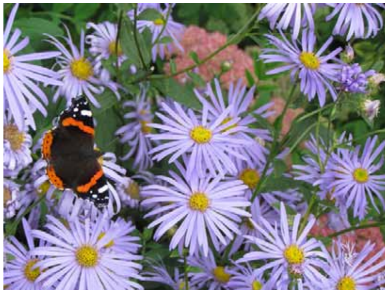
A Red Admiral butterfly visits American asters, Botanic Gardens Rory Walsh © RGS-IBG Discovering Britain

We saw footprints of dinosaurs and gargoyles of mythical creatures; some trees that caused a diplomatic incident and other trees that soak up air pollution; graceful swans and miniature deer, animal gods and migrating birds, exotic fruits and glossy nuts. We discovered that many of these trees, plants and animals have international links.