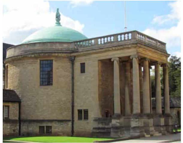
Rhodes House

The building with the columns and green dome is Rhodes House. It is home to the famous Rhodes Scholars programme which was created from the will of Cecil John Rhodes. He was a graduate of the university who went on to establish the De Beers diamond company in South Africa. Northern Rhodesia and Southern Rhodesia – now Zambia and Zimbabwe – were named after him. The scholarship programme, dating back to 1903, selects 83 scholars each year from America and some of the Commonwealth countries who are identified as being potential future leaders.