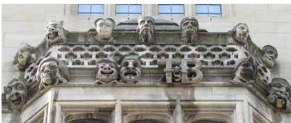
Some of the Bodleian Library gargoyles

Why not look for gargoyles on churches, monuments and public buildings near where you live?