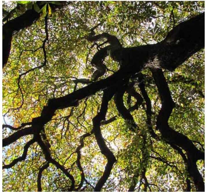
Horse chestnut tree in Lamb and Flag Passage

The name of the tree is rather misleading. It is thought to originate from the erroneous belief that the tree was a kind of chestnut together with the equally false observation that eating them cured horses of chest complaints! Horse chestnuts actually originated in mountainous areas in south-eastern Europe, including northern Greece, Albania, Macedonia, Serbia and Bulgaria - although they are now found across countries where summers are not too hot, or else in the cooler mountain areas of warmer countries.