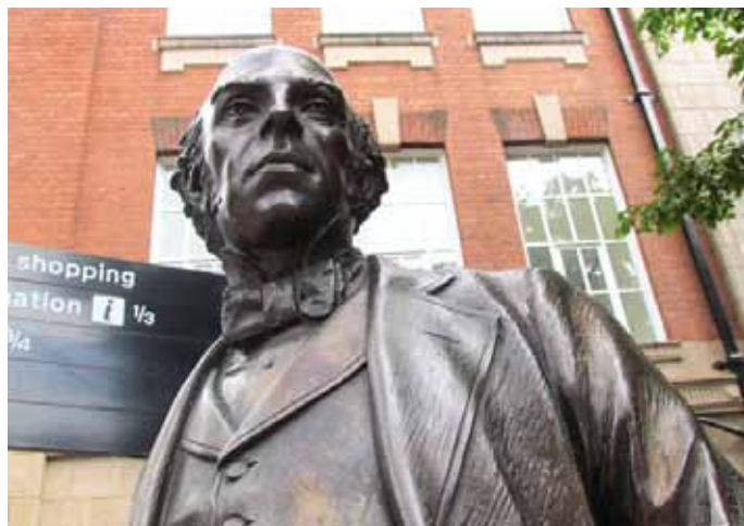
Thomas Cook's statue

This statue is an important symbol of Leicester's links with the rest of the world. Thomas Cook was a cabinet maker who lived in the nearby town of Market Harborough. In June 1841 he walked from his home to Leicester, which was then only a small town, to attend a meeting. When he arrived Cook learned that the people he was meeting with had to go on to Loughborough. So he suggested a special train should be arranged for them. The Midland Railway Company approved and 500 passengers travelled to Loughborough and back for a shilling on a train arranged by Thomas Cook.