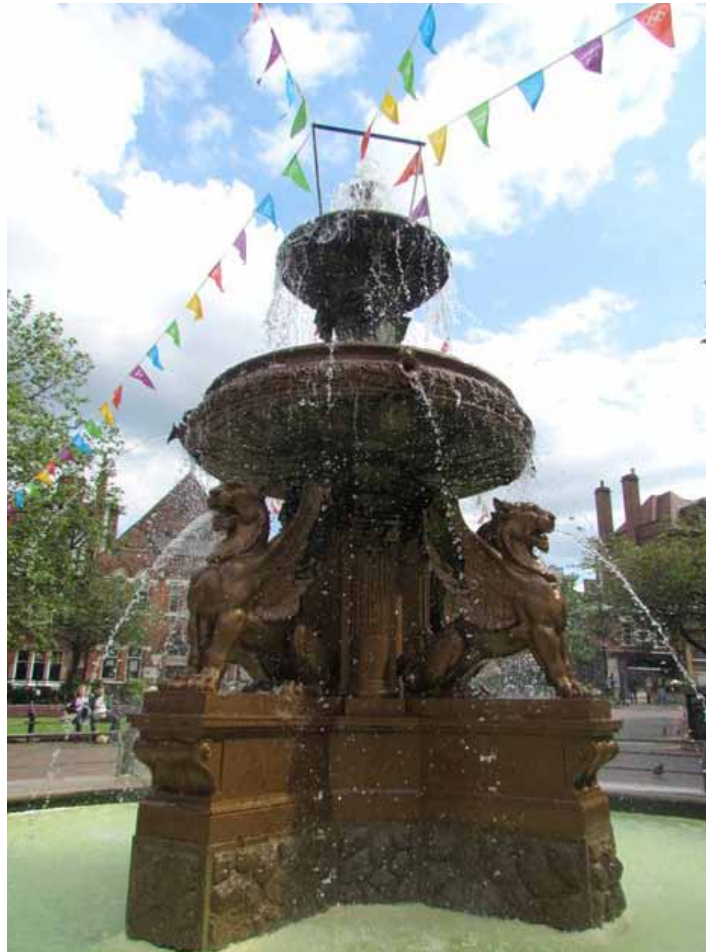
The Town Hall Square fountain, decorated with bunting for the London 2012 Olympic and Paralympic Games

Each migrant community has brought their languages, beliefs, customs and foods and we have seen evidence of this in various places of worship, shops and markets around the city. This diversity has made Leicester one of Britain's most vibrant and multicultural cities.