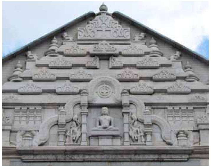
Some of the Jain Centre's incredible carved marble

The religion of Jainism originated in India and is followed by a sizeable number of people in India as well as migrants in Europe, East Africa and North America. The first followers of Jainism in Leicester arrived from India and Kenya then in greater numbers from Uganda. There are currently about 1,000 Jains in the city.