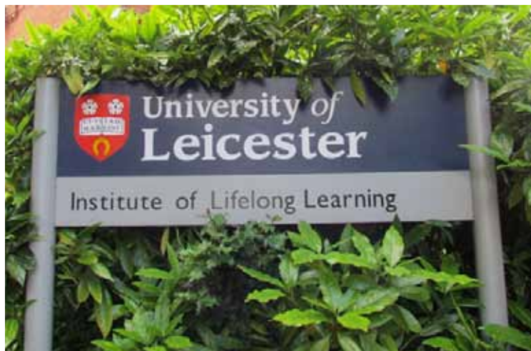
The sign and crest at one of the University buildings

Another reason Leicester is a very multicultural city is that it is home to two universities. Students come to study in Leicester from all over the world. This is Leicester University, one of the top 20 universities in Britain. There are around 23,000 students here from over 70 Olympic and Paralympic nations. Each year over 450 visiting students come to Leicester as part of Study Abroad exchange agreements with 50 overseas universities in 11 countries. Students also come here from Erasmus exchange partners in another 22 European countries.