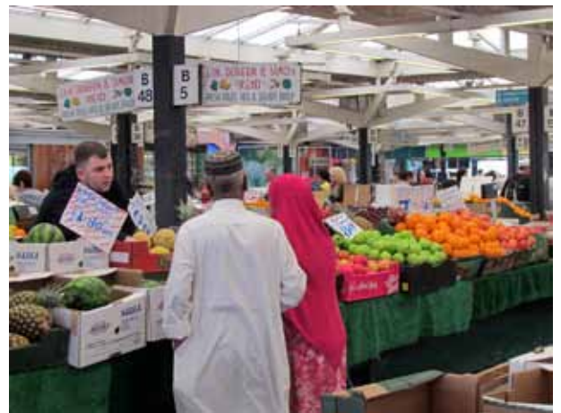
Leicester market

Welcome to Leicester! Leicester in the East Midlands is the tenth largest city in England and has a population of over 300,000 people. Leicester is also one of Britain's most multicultural cities with people from all around the world particularly South Asia, East Africa and the Caribbean.