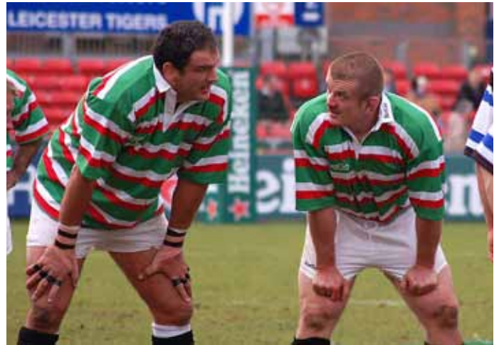
Tigers players Martin Johnson and Graham Rowntree, 2007

Leicester Tigers are England's most successful rugby club, winning a record nine championships. The Tigers were founded in 1880 as Leicester Football Club after three local teams merged.