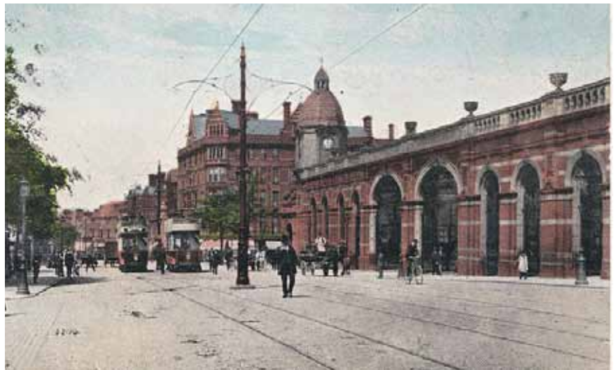
Leicester station in the 1900s when it was known as Midland Railway Station

The way Leicester's station has been rebuilt over time reflects how many people from around the world have changed the city.