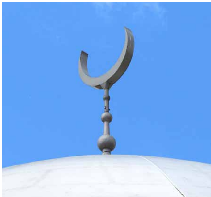
The crescent on the mosque roof

This building is Leicester Central Mosque which was built in 1988. Mosques are places of worship for people who believe in Islam. Islam is mainly practised in Arabian states such as Iran, Afghanistan and Syria as well as Pakistan. Islam has over 1 billion followers worldwide. Muslims believe that there is only one God, called Allah. Muslims believe that Islam began over 1,400 years ago in Mecca in Saudi Arabia and follow the teachings of the Qu'ran.