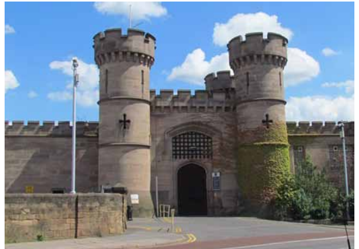
HM Prison Leicester is often mistaken for a castle

The journalist William Cobbett, who wrote about his journeys around England in the 19th century, criticised the people of Leicester for being proud of the prison. He felt it would be more praiseworthy to have an absence of crime!