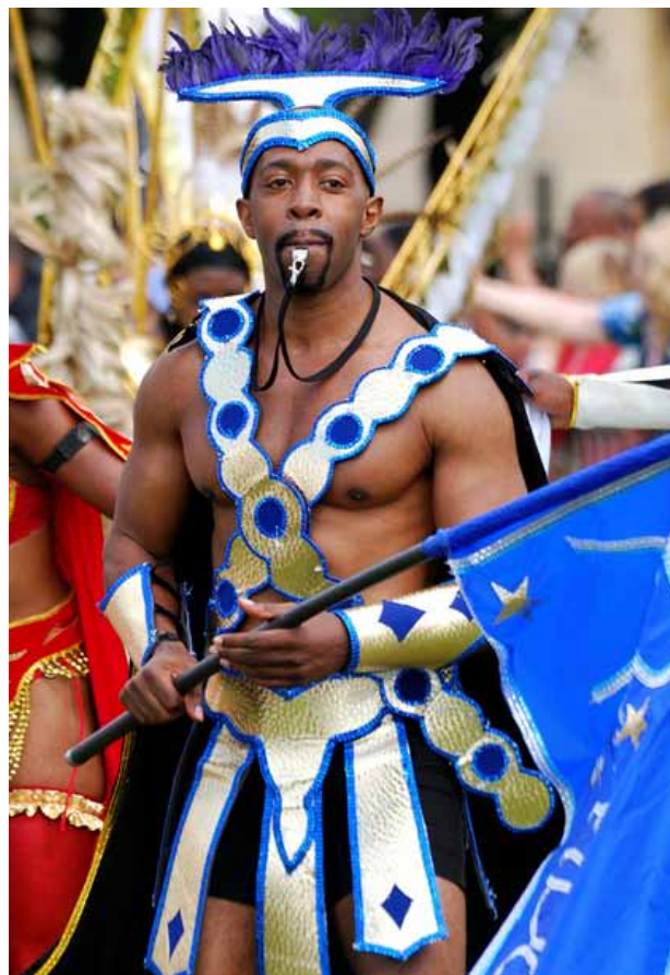
Dancers at the Caribbean Carnival

The Centre also tries to bring Jamaican culture to the city. For example salt fish pancakes are sold here on the Christian tradition of Pancake Day. Salt fish is the national dish of Jamaica. The Centre is also important in Leicester's Caribbean Carnival which is the second-largest in Britain.