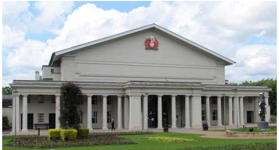
De Montfort Hall

The Hall was built in 1913 and is named after Simon de Montfort. He was the Sixth Earl of Leicester. The Hall is not the only way De Montfort is remembered in Leicester and we will hear more about him later in the walk.