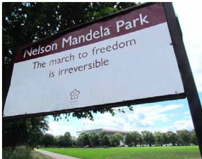
One of the Park signs with Welford Road Stadium beyond

During his imprisonment Mandela became the most significant black leader in South Africa and a symbol of the anti-apartheid movement.