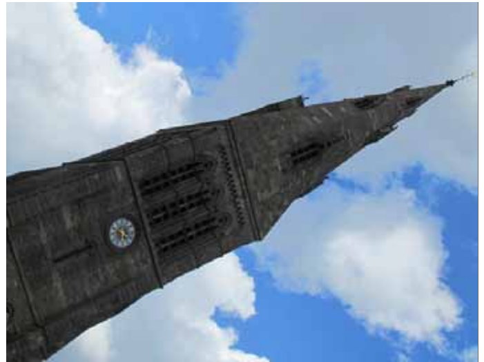
Leicester Cathedral spire

The cathedral has many other links with France. For example, the east window was installed as a monument to those who died in the First World War in France and Belgium. The window shows various saints including Joan of Arc.