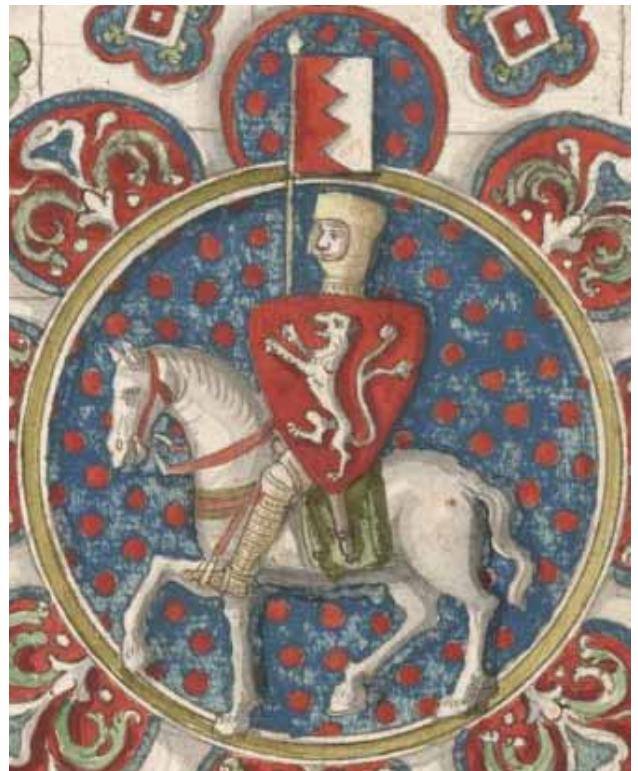
Simon de Montfort depicted in a stained glass window at Chartres Cathedral in France

De Montfort is known for leading the barons' rebellion against King Henry III of England during the Second Barons' War of 1263-4. He subsequently became de facto ruler of England. During his rule de Montfort called the first directly-elected parliament in medieval Europe. For this reason de Montfort is regarded today as one of the fathers of modern democracy. After a rule of just over a year he was killed by forces loyal to the king in the Battle of Evesham. Napoleon Bonaparte described Simon de Montfort as "one of the greatest Englishmen".