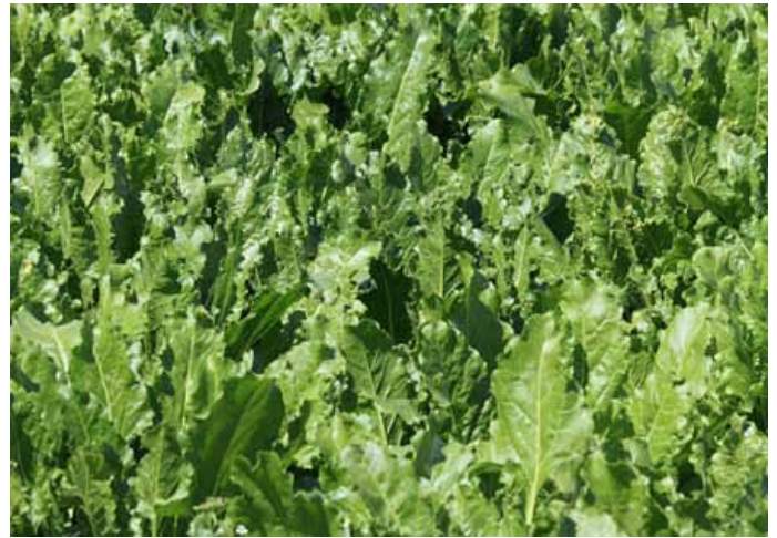
Sugar beet was first cultivated in Poland

Barley originated at roughly the same time in the same broad area. It was an early staple crop in Egypt. It was used for making bread and beer, and became the symbol of Upper Egypt.