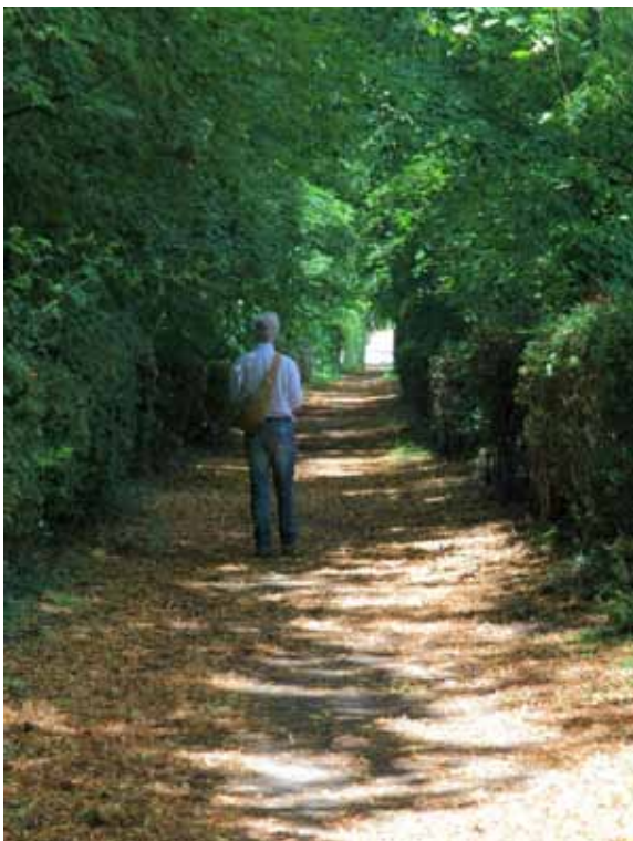
The Avenue Rita Gardner © RGS-IBG Discovering Britain

The picturesque Suffolk village of Walsham le Willows can trace its history back over 1,000 years. The gentle rural landscape of farm fields, ancient hedges and country cottage gardens, fits many peoples' image of England as a green and pleasant land.