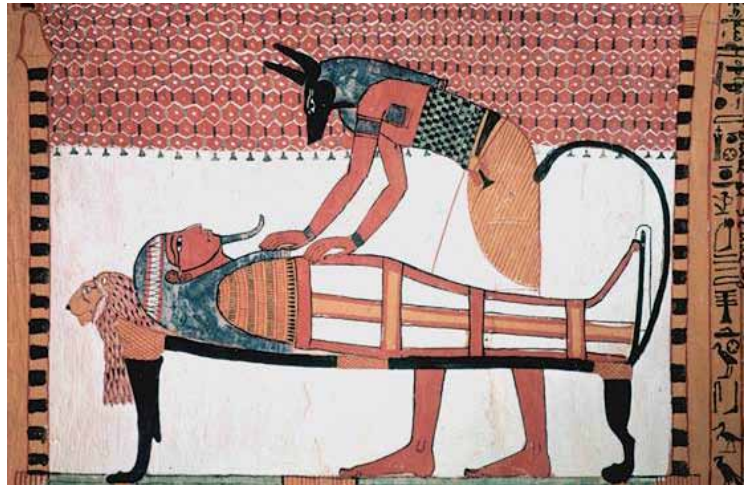
Egyptian god Anubis attending a mummified body

Look at the ground of the car park and even the asphalt and white lines have a story to tell. Asphalt is made from distilling crude oil. Britain currently imports about half of its oil, with most imports coming from Norway.