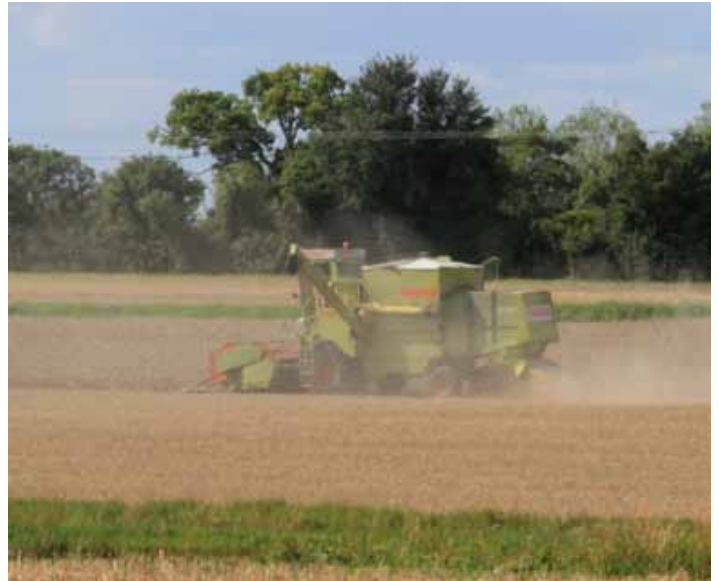
A combine harvester at work

Willow Cottage has a roof of water reed. Applied in bundles with their ends facing outwards, the reeds give a smoother layer about 35 to 40cm thick. A straw ridge covers the weak join at the top.