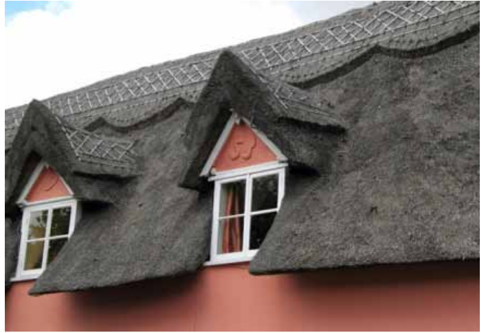
Willow Cottage's water reed thatch roof

The White House and Willow Cottage both have traditional East Anglian thatch roofs. Until about 1800 AD there was little choice of roofing materials in many countryside areas apart from local vegetation. Thatch was light, available and cheap. A similar situation applies in many rural areas of developing countries today, where thatching with local plants is common.