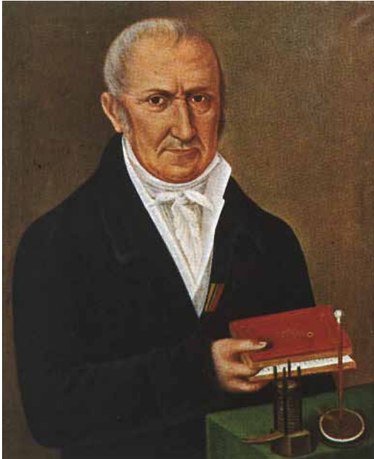
Alessandro Volta

The invention and manufacture of photovoltaic cells has involved scientists from across the world. The 'photovoltaic' process was recognised in 1839 by a French physicist, and the first working cell was invented in 1883 in America.