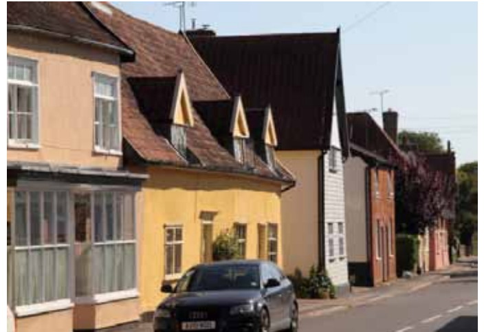
Church Street, Walsham le Willows

Welcome to Walsham le Willows. This picturesque north Suffolk village can trace its history back over 1,000 years. Walsham is a Saxon name whose original form was probably Waeles-ham. This means 'ham of the Welsh', and probably relates to the Romano-British inhabitants who were there at the time of the Saxon invasion.