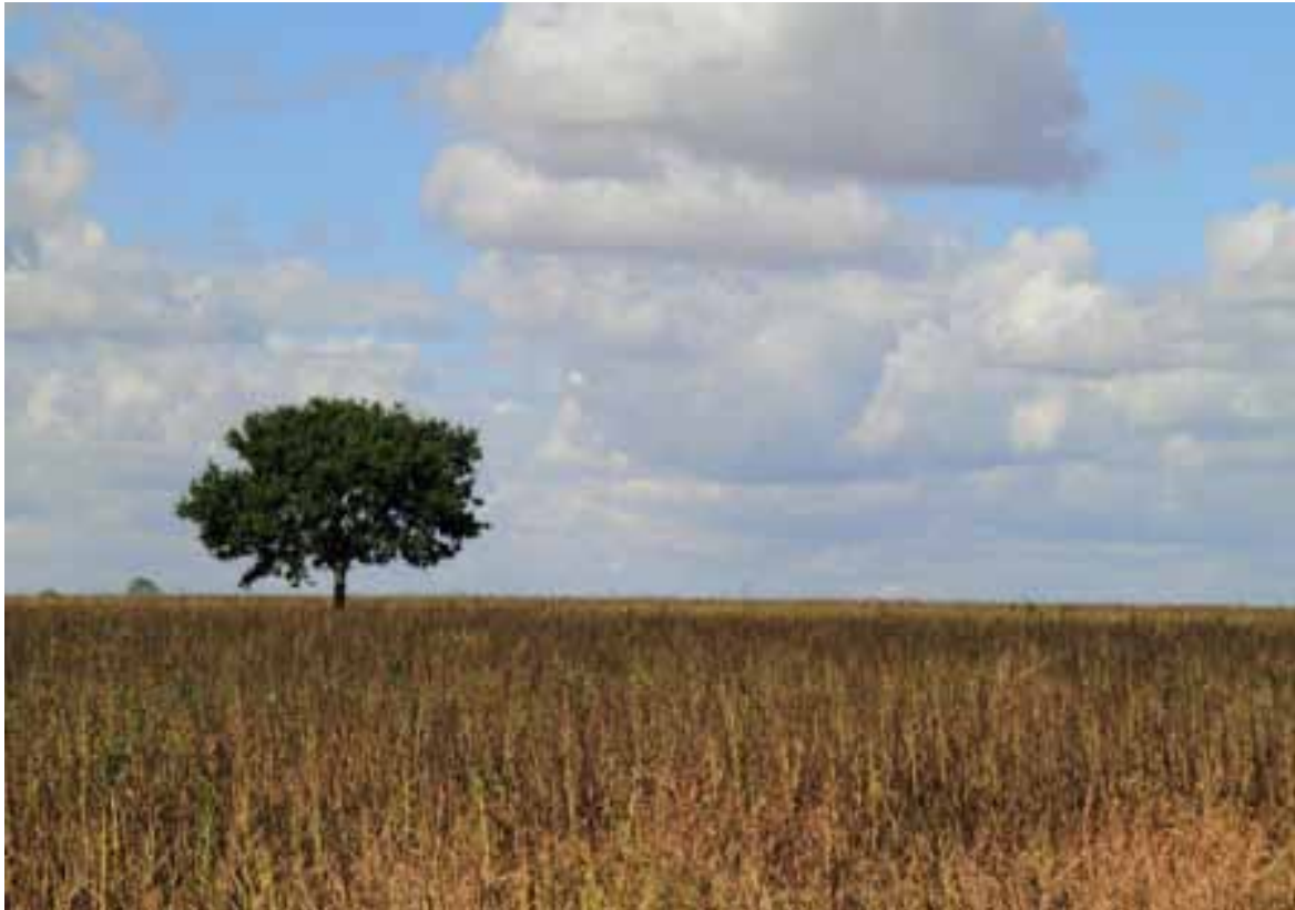
Big, big skies over Mill Field

On the walk we have found evidence of links to 56 different nations. Maybe you spotted more. If you did, please let us know. And if you enjoyed this walk, look on the Discovering Britain website where you can find more walks to try more in different parts of Britain. We hope that you have enjoyed this one!