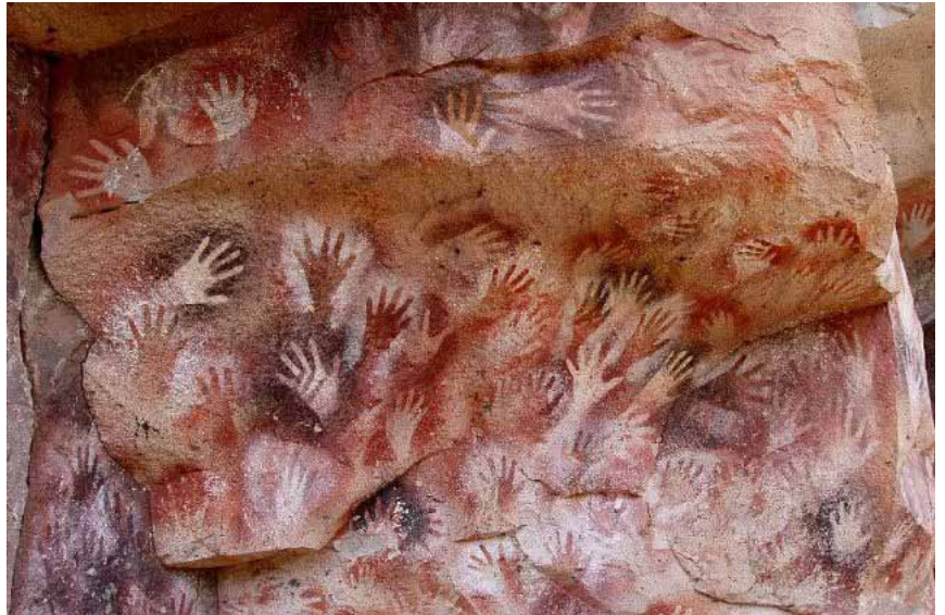
Hand prints by Patagonian people c.8000 BC, Cueva de las Manos, Santa Cruz

Archaeologists have discovered that the berries were eaten thousands of years ago by Prehistoric people in Patagonia, South America. This gives us a strong clue to the native home of the plant – southern Chile and Argentina.