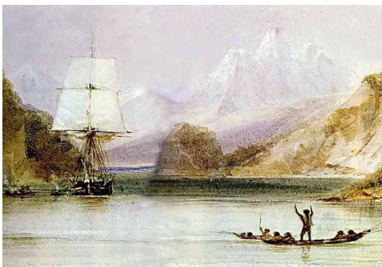
Charles Darwin's ship HMS Beagle at Tierra del Fuego (1830-36)

Just next door is The Quillet, a farmhouse built in 1520. Its name means 'a medieval strip of land'. We are interested in the thick dark hedge outside. This is a type of Berberis shrub named Berberis Darwinii . It is named after Charles Darwin, the famous British biologist who developed the theory of evolution of species.