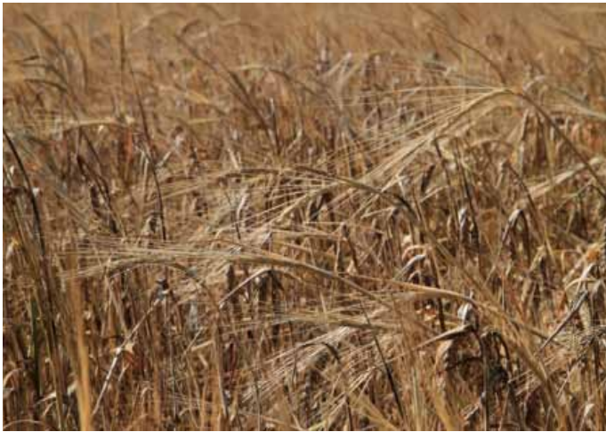
Barley, growing in Suffolk via ancient Egypt!