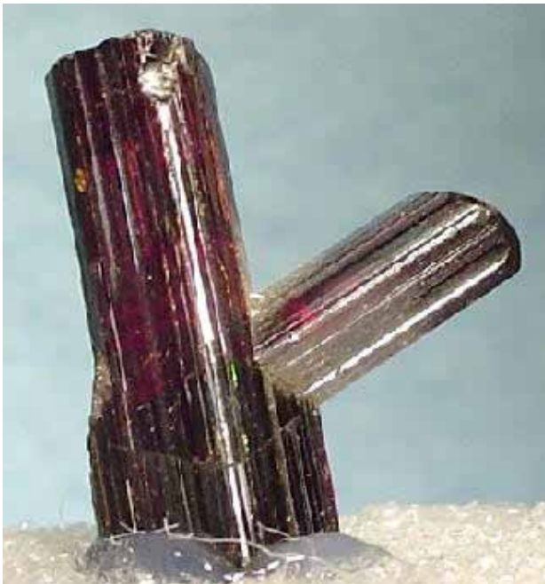
A rutile crystal

Before modern asphalt roads were paved with tar. Amazingly the first city to pave its streets was Baghdad in present-day Iraq in the eighth century AD! In ancient times asphalt was used in Pakistan, Iraq and Iran for building construction and waterproofing. In ancient Egypt, asphalt was used for embalming mummies!