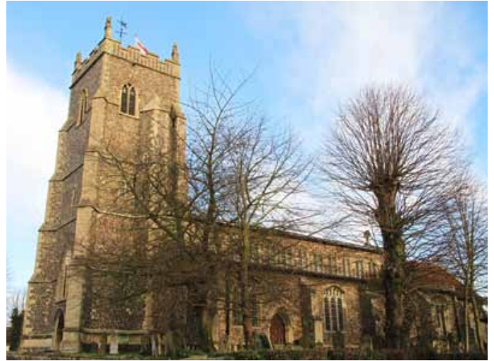
St Mary's Church

The structure of the church - including its roof, the roof painting and the (much-restored) wooden screen - all date from between 1400 and 1500. An earlier Norman (French) church existed on this site and one re-used stone from it can be seen in the north aisle of the present church.