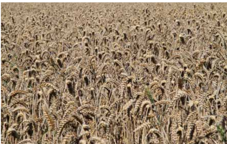
Wheat arrived in Britain from the Middle East

Wheat is the commonest cereal crop grown in Britain. Its early cultivation from wild grasses began in the Middle East and was associated with early civilizations. Archaeological evidence shows different types of wheat were cultivated by Neolithic farmers in Jordan as early as 11,600 years ago and in Syria between 10,000 and 11,000 years ago.