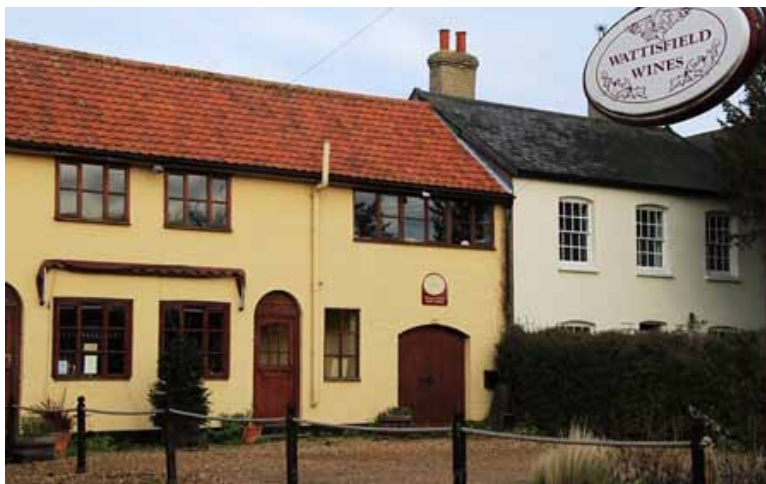
Wattisfield Wines, Church Street

A peek into either of them reminds us just how far away some of our foods come from. At Rolfe's are vegetables imported from South Africa and lamb from New Zealand.