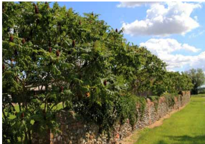
Rhus typhinus , used by Native Americans for tobacco!

Rising above the wall at Riding Farm house is a row of small Staghorn Sumach trees, or Rhus typhinus to give them their Latin name. With their distinctive leaf shapes, bright red fruit spikes in late summer, fiery autumn leaf colour and shapely winter branches, they give good value all year round in the garden. They are natives of eastern North America, especially southeast Canada and northeast United States, including the Appalachian Mountains.