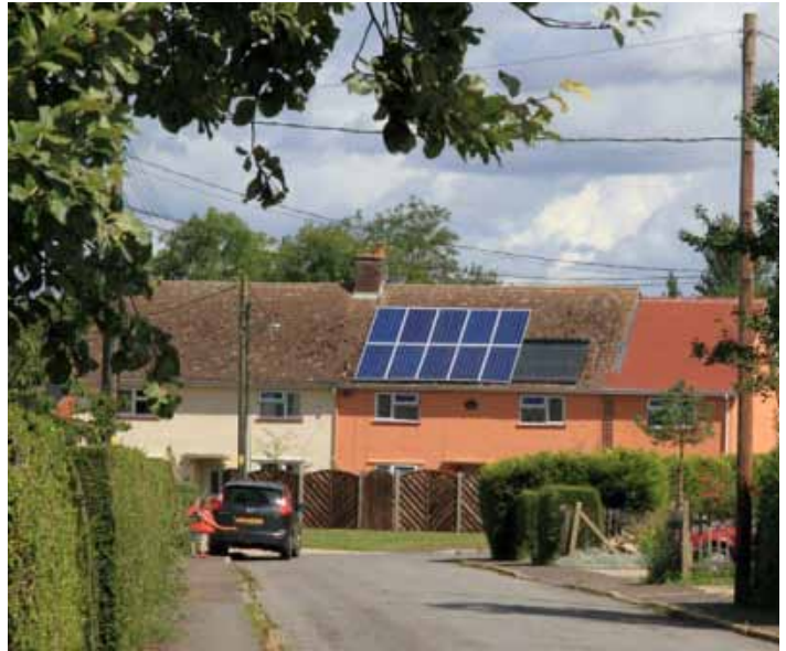
Solar panels, Grove Park

The word 'photovoltaic' comes from a combination of the Greek word for light (phos) and Volta, the surname of Alessandro Volta. He was the Italian physicist who invented a forerunner to the battery and the unit of electrical force, the volt, is named after him.