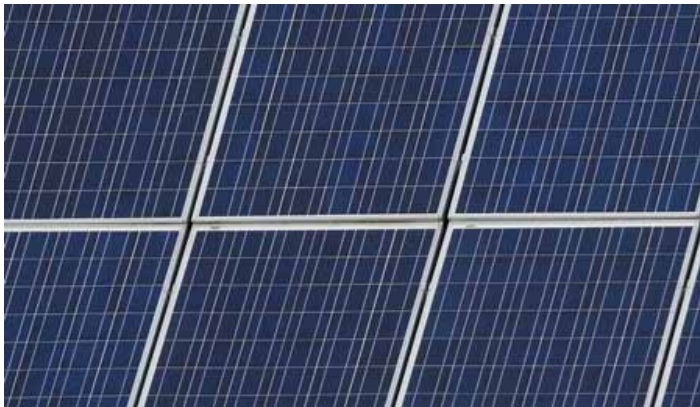
Solar panels close up Rita Gardner © RGS-IBG Discovering Britain

The technology and its introduction were triggered by oil fuel shortages in Israel in the 1950s and 1970s. In 1980 Israel was the first country to require most new homes to have solar water heaters. Today 85 per cent of households in Israel use solar thermal heating – the highest use per person in the world.