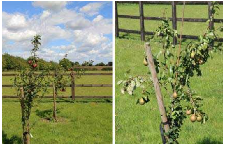
Walsham's newest orchard contains dwarf apple and pear trees

Just on the corner of Bribery Lane and Walsham Road is a recently planted group of dwarf plum, apple and pear trees – a new little orchard in the making. As you walk further down the road, look out for mature fruit trees in some of the gardens.