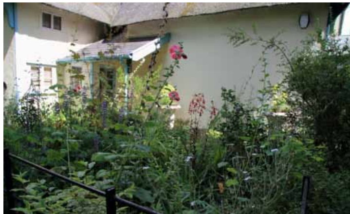
An English cottage garden

The Rowan tree is full of red berries in late summer. The native lands of the Rowan, sometimes called the mountain ash, cover most of Europe.