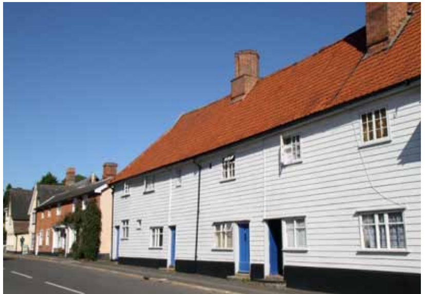
The former Guildhall

Interestingly, it was also later used as the village workhouse, a place where orphaned children and dependent women earned money from spinning.