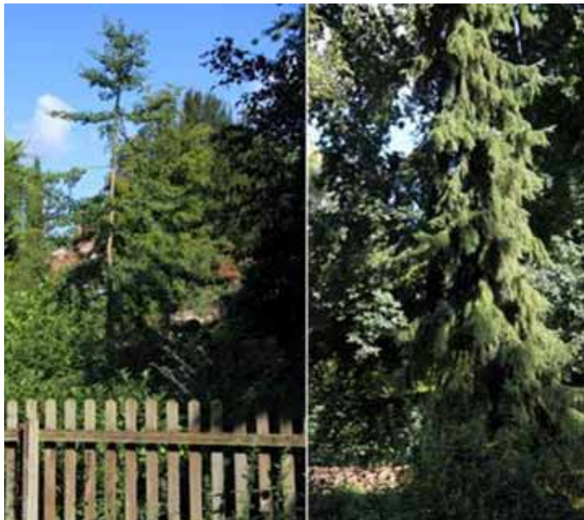
More international trees on Grove Road

Also look for the red berried Cotoneaster, many of which are native to the Himalayas and China. The striking blue grey fir and the Robinia tree ( Robinia pseudacacia ) are native to south east United States.