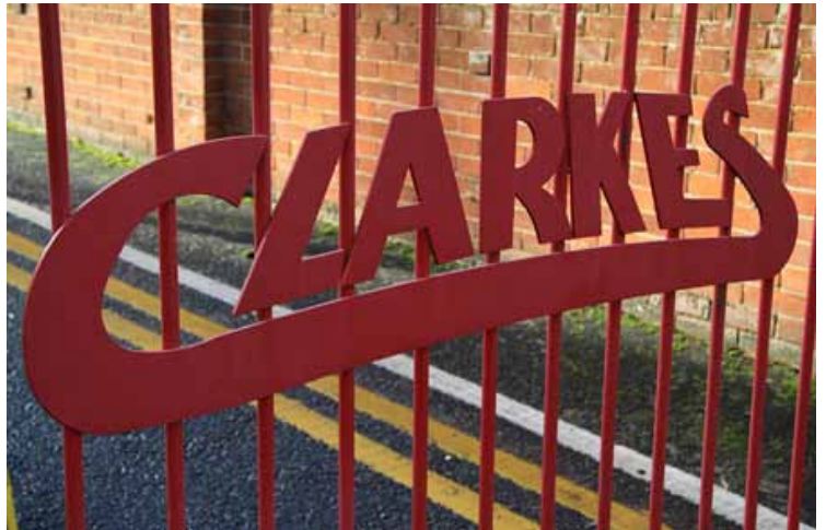
Clarkes of Walsham gates

Sadly none of that local craft survives today. But at Clarkes - one of the best known agricultural and builders' merchants in East Anglia - we can find a cornucopia of international connections.