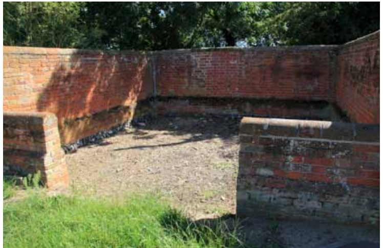
The Pound

This pound is relatively 'new', built in 1819 when the last of the village's common land was enclosed into fields. Like earlier ones, it was used for holding stray animals - sheep or cattle - to stop them from damaging crops or gardens. Pounds were a necessity in a landscape where livestock or mixed farming was common.