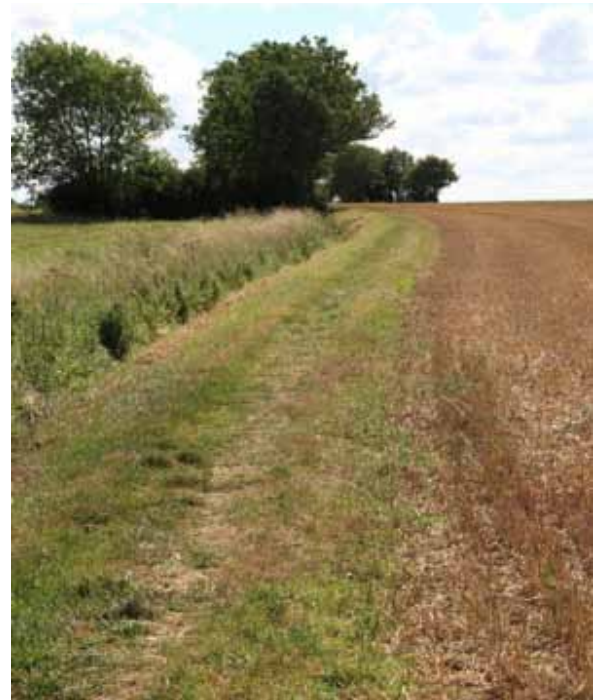
Mill Lane

There is no specific viewpoint here but as you walk between the hedge and fields it has a classic East Anglian feel; gently undulating land and big, big skies. The hedgerow is estimated to be more than 700 years old from the wide range of different, mostly native, shrub and tree species it contains. Also you are surrounded by crops whose origins go back millennia in time, to the very earliest farmers in far distant lands.