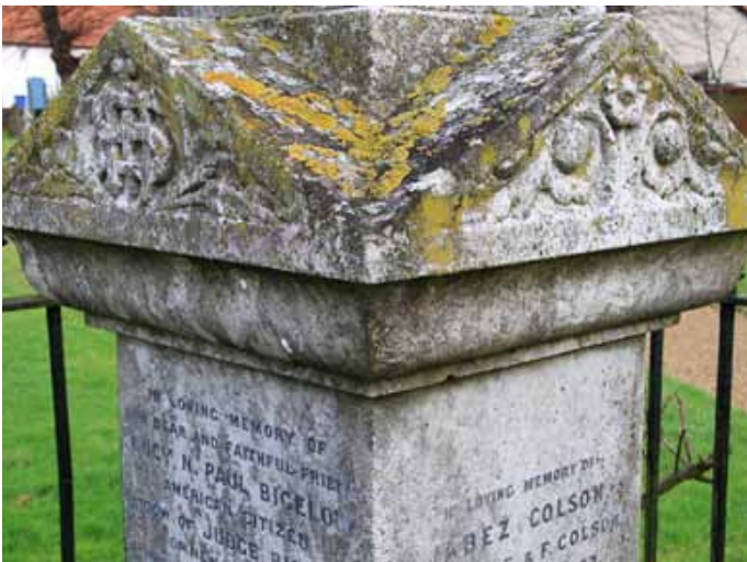
Colson family memorial, St Mary's Church

The Norman church is recorded in the Domesday Survey of 1086. This extraordinarily detailed census of England was carried out after the Norman Conquest. As a result much land transferred into Norman ownership. As is often the case in country churches, more recent events that affected the village are well recorded. These include the migration of people to and from the village.