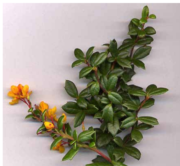
Berberis Darwinii shoot