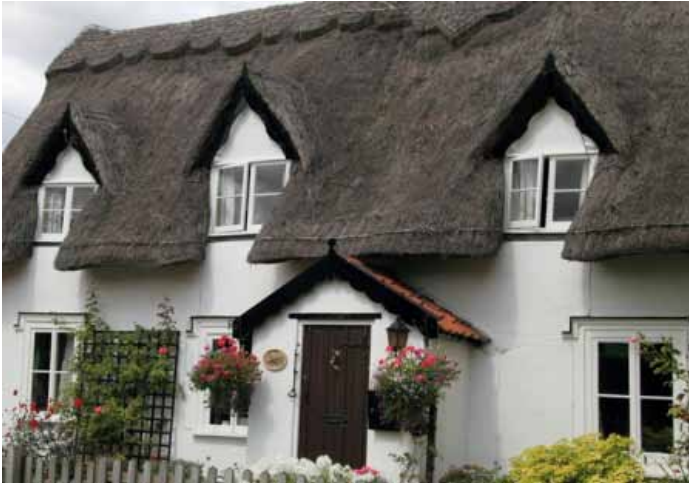
The White House with its wheat thatch roof