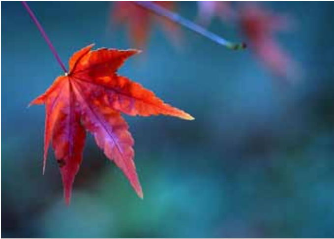
A distinctive autumnal Maple leaf

Look out as well for the finely pointed leaves of an ornamental Maple tree. The leaves are especially brightly coloured in autumn. Maples are the national plant of Canada and appear on the Canadian flag. Yet most maples originate in Asia, including many of the maple cultivars that we commonly see in our gardens in England.