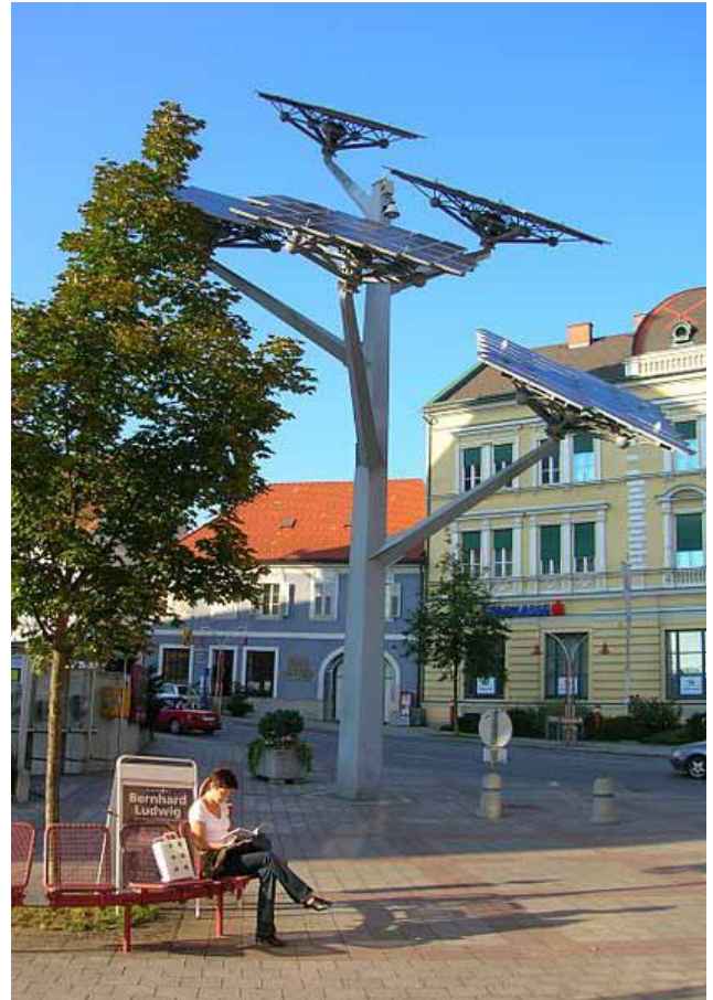
The 'solar tree' - a group of solar panels - in Gleisdorf, Austria

Country links - Australia, Austria, China, France, Germany, Greece, Israel, Japan, Russia, Spain, Turkey, United States of America