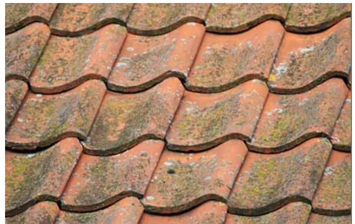
Barn Cottage and its pantiles

Pantiles were used to replace straw thatched roofs to reduce the risk of fire sweeping through towns and villages. Made by hand, the tiles were wind dried before being fired in outdoor kilns. The tiles made their way to east England as the ballast - or weight - in sailing ships. These ships came from the Netherlands to buy English wool. The ships loaded their cargoes of wool to trade in mainland Europe, leaving the tiles behind.