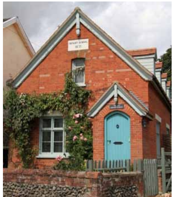
The Old Infant School Rita Gardner © RGS-IBG Discovering Britain

Staying with garden plants, turning left on The Street will bring you almost immediately opposite the Old Infant School. Around the front door is a vigorous evergreen climber – Clematis Armandii – which hails originally from China. And in the garden there is superb example of a larch tree. Many larches are native to Russian Siberia.