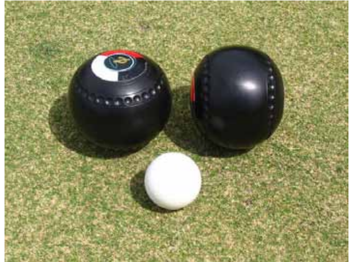
A pair of lawn bowls balls behind a jack / kitty

Most bowls are made today of modern, composite materials. Old ones, however, were carefully crafted by hand from hardwood; specifically from Lignum-vitae , the densest wood traded and one of a group of trees known as ironwoods.