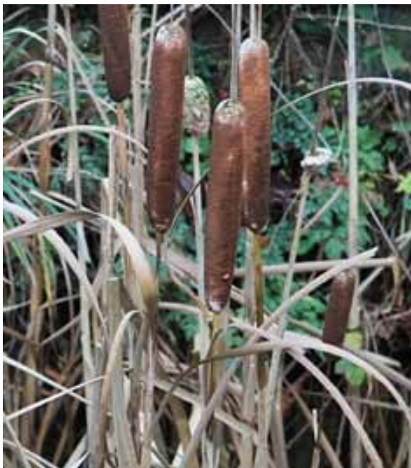
Water reeds used in thatching

Water reed roofs are rare outside East Anglia, as the reeds come originally from the fenlands in the region. But drainage of the fens, habitat destruction, and pollution from nitrate fertilisers that weakens the reed stems have all taken their toll.