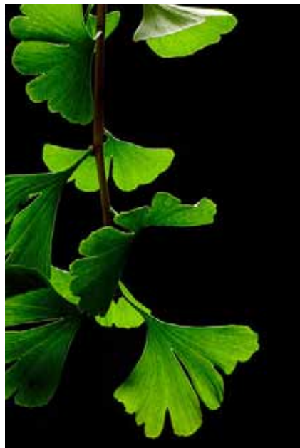
Magnolia weiseneri / Ginkgo Biloba leaves in summer

We can see even more exotic species in gardens along Grove Road. Some 100 metres along on the left is a living fossil - the Ginkgo Biloba or Maidenhair tree. Look for its distinctive fan shaped leaves.