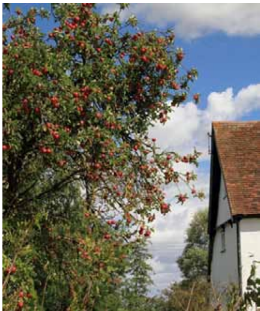
Apple tree, Riding Farm

There are many villages like this across rural England. The village and the gentle surrounding rural landscape of cultivated fields and hedges typifies many peoples' image of England as a green and pleasant land.