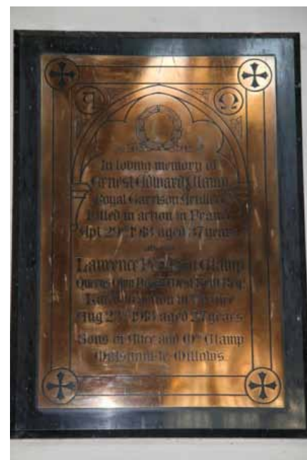
St Mary's Church war memorials

Country links - Brazil, France, Germany, Turkey, United States of America