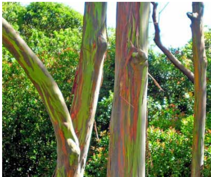
Colourful eucalyptus bark in Hawaii