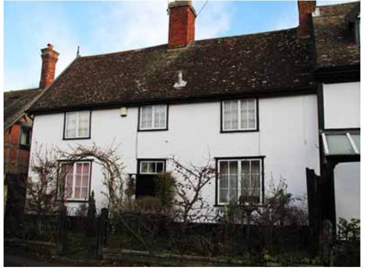
Prior's Cottage Rita Gardner © RGS-IBG Discovering Britain

Draped over the entrance gate to Prior's Cottage is wisteria. Wisteria is a native of Guangzhou in China. Seeds were first brought back to Britain by Captain Welbank in 1816 and three years later the first flowering wisteria appeared in the United Kingdom.