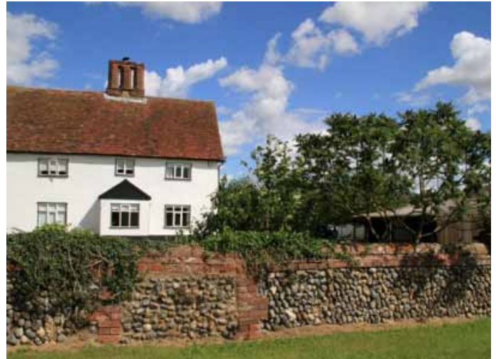
Riding Farm house

Along the routes you will discover evidence of how different countries have shaped our towns and cities.