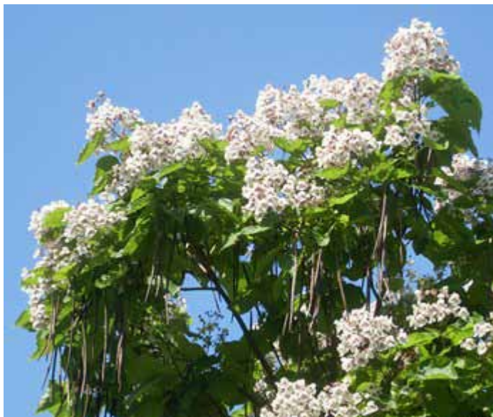
Indian Bean tree

Also look out for the blue-green leaves and smooth colourful bark of a Eucalyptus tree. The Eucalyptus is native to Australia. Its leaves are the staple diet of koala bears.