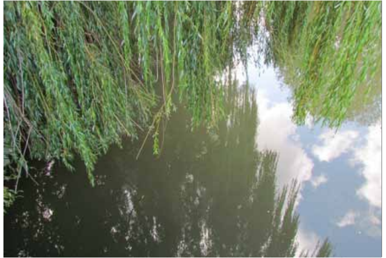
Willow branches over the Cherwell

Many centuries ago people discovered that the leaves and bark of the willow tree had medicinal properties. There is mention of it in ancient texts from Assyria, Sumeria, Egypt and Greece.