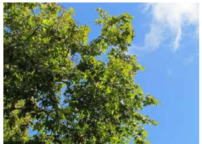
Scenes from botanical Oxford