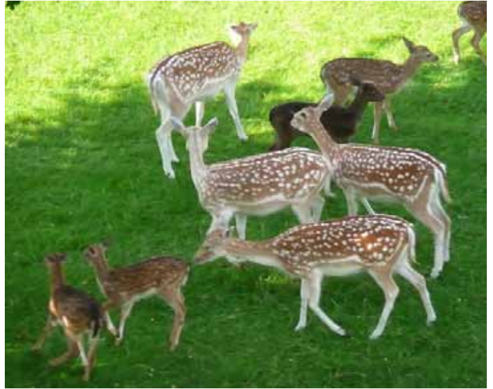
Fallow deer in Magdalen Grove

To the northwest of the college's grounds is a large meadow known as Magdalen Grove. In the sixteenth century the grove consisted of gardens, orchards, and bowling greens. During the Civil War it was used to house a regiment of soldiers. At one point in the nineteenth century it was home to three traction engines belonging to the works department of the college. By the twentieth century it had become well-wooded with many large trees.