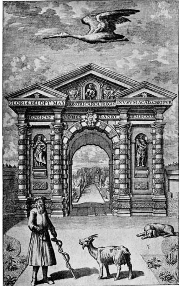
A woodcut of the 'Great Gate of the Physic Garden, Oxford', now known as the Danby Gate

You need to pay to go into the garden. The price varies according to the time of year but it is well worth a visit. Inside are over 7,000 specimens from around the world grown for scientific and conservation research. In the Tropical Lily House you can see examples of cash crops such as bananas, sugar-cane and rice, while the Palm House features ginger, cocoa, coconut and oil palm.