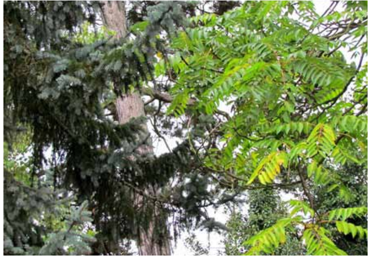
Various tree species at the University Parks

It includes an Italian Maple (native to countries such as Spain, Italy, Morocco and Algeria), the Aleppo Pine (native across the Mediterranean including Croatia, Greece, Tunisia and Libya), the Valonia Oak (also native to the Southern Mediterranean, the Balkans and the Greek Islands), and the American Smoke Tree (native to the southeastern United States).