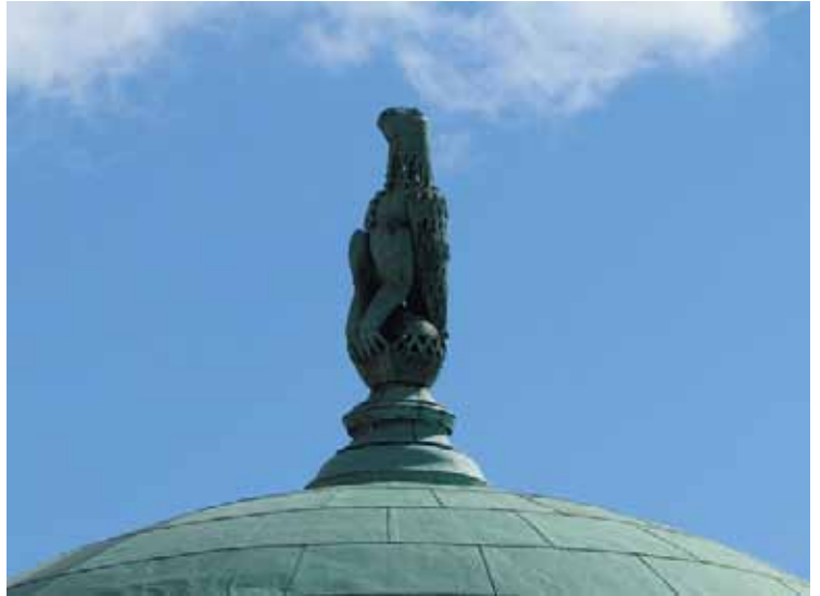
The Bateleur eagle on Rhodes House

The scholarship programme, dating back to 1903, selects 83 scholars each year from America and some of the Commonwealth countries who are identified as being potential future leaders.