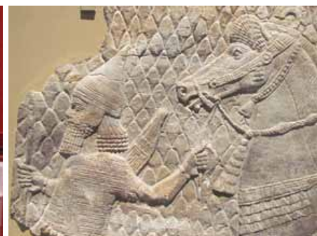
Horse exhibits from (clockwise top left) Italy, China, Iraq and Tibet

See if you can find four different horses. In Room 9 is the ghostly outline of a horse's head decorated with bronze bits from Lucera in the Apulia region of southern Italy. Next to it is a sculptured relief of an Assyrian horse being led by an archer dating back to around 700 BC. In Room 32 see if you can find a Tibetan statue of Kuvera, the Hindu god of the north direction – seated on a horse. In Room 38, look for a Chinese ceramic roof tile in the shape of a horse dated somewhere between 1600 and 1700.