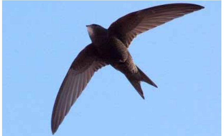
Common Swift in flight

This is the University's Museum of Natural History, built in the 1850s. It's not only home to a large natural history collection but also to a live species. Look up at the tower. Inside the ventilation flues are the nests of swifts which come here in the spring and summer to breed.