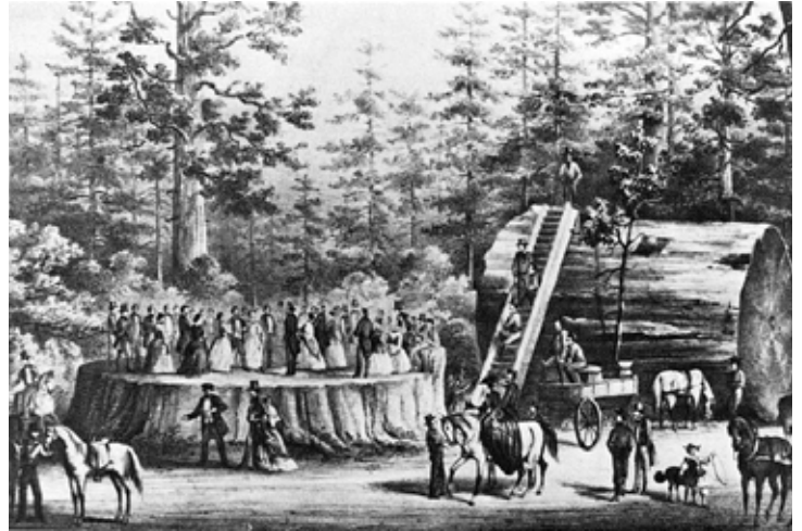
A lithograph showing 32 people dancing on the stump of a giant sequoia found in California in 1853

But the name of this tree went on to cause an international diplomatic incident between Britain and America. In Britain the tree was named Wellingtonia gigantea after the Duke of Wellington who had defeated Napoleon. But the Americans wanted to call it Washingtonia , to honour the first American President, George Washington. After years of botanical wrangling, it was finally given the name sequoiadendron giganteum because of its similarity to the Californian redwood, which is sequoia sempervirens .