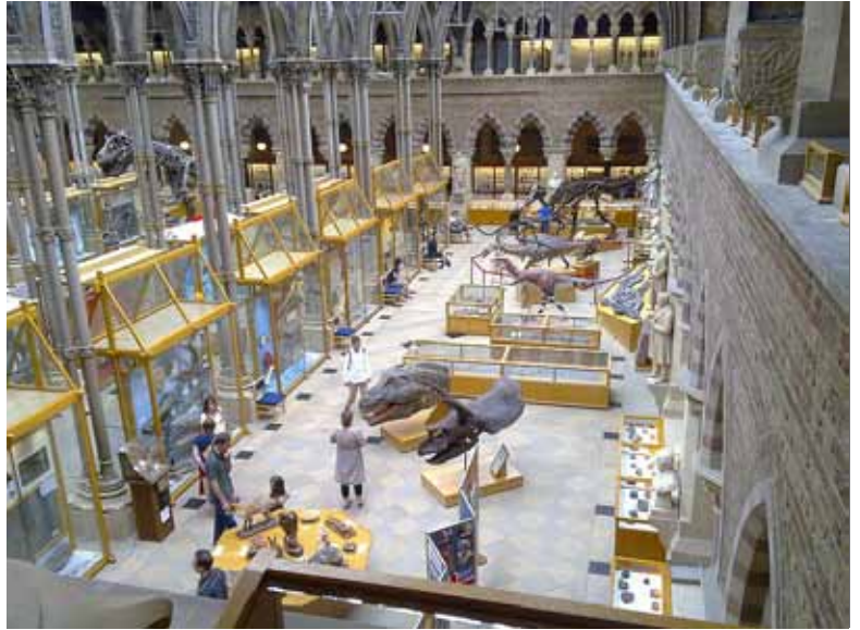
The Oxford University Museum of Natural History Dinosaur Gallery

The second theme is geology, which includes fossils of flora and fauna. The third theme is mineralogy and petrology, which includes over 30,000 mineral specimens from all over the world as well as collections of gemstones, meteorites and mineralogical instruments.