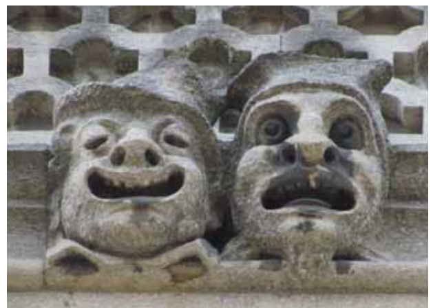
Look for beasts, birds and mythical creatures

Directions 1 - Make your way to Oxford Town Hall on St Aldate's. Stop when you have a good view of the building (the best is probably across the road). Take care crossing the road here as traffic can be busy.