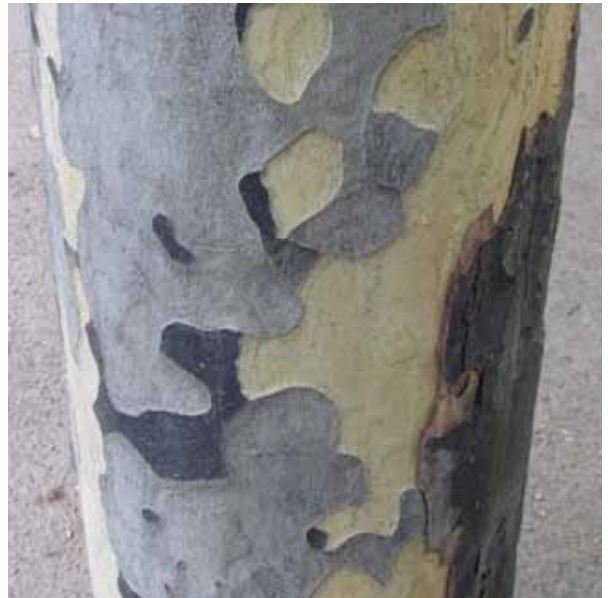
An exfoliating London Plane tree, St Giles

The Oriental Plane was first recorded in the literature of ancient Greece, from whose name, Platane, our modern tree's name originates. The tree is also recognisable from Turkey to India, although named as the Chenar, following a root of Iranian language.