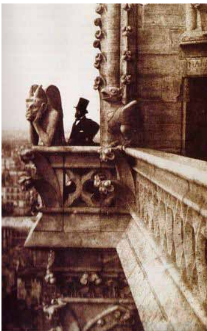
Gargoyles on Notre-Dame de Paris Cathedral, photographed in 1853 by Henri Le Secq Wikimedia Commons

Look up to the walls of this spectacular courtyard at the stone faces staring down at you. These are gargoyles. The word gargoyle comes from the French gargouille which means 'throat' or 'gullet' and similar European language words relating to gargle and swallow. Gargoyles are waterspouts designed to channel rainwater away from the walls. Although functional they are also decorative.