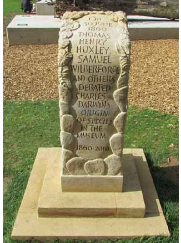
The 'Great Debate' monument

This memorial stone commemorates that debate. Over 150 years later the debate between evolution and creation continues. You can also find a statue of Darwin inside the museum.