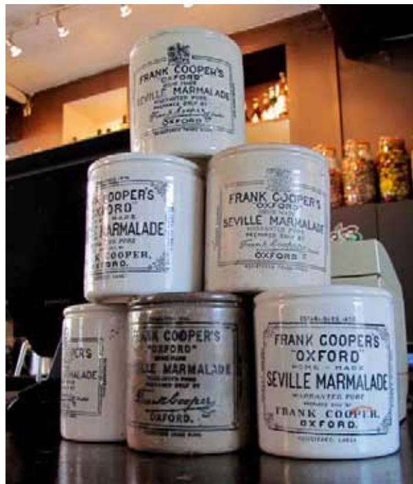
Frank Cooper marmalade jars