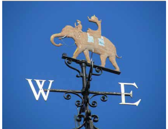
The Indian Institute weathervane

In particular it was a training place for those entering the Indian Civil Service and managing Britain's greatest colony. This building was constructed in 1883 and certainly reflects the Indian influence.