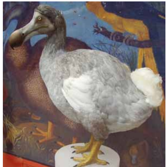
The Museum's Dodo reconstruction

One of the museum's well-known exhibits is the world's most complete dodo which is to the left of the Main Court. The flightless bird was endemic to Mauritius in the Indian Ocean. When humans settled on the island they destroyed much of the forest where the birds made their homes, while dogs and cats brought by the settlers plundered their nests. It became extinct in the late seventeenth century just over 100 years after its discovery and is now often used to symbolise the extinction of a species as a direct result of human activity.