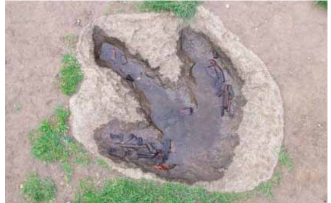
Megalosaurus footprint

These giant footprints belong to a Megalosaurus – a dinosaur that was right here in Oxford millions of years ago! In 1997 a set of footprints was found in an old limestone quarry 20 kilometres north of Oxford. They had been created 166 million years ago when the area was covered by shallow sea, lagoons and mudflats. The footprints outside the Museum are a cast of those found in the quarry.