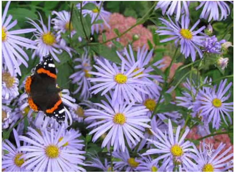
A Red Admiral butterfly visits American asters, Botanic Gardens

We saw footprints of dinosaurs and gargoyles of mythical creatures; some trees that caused a diplomatic incident and other trees that soak up air pollution; graceful swans and miniature deer, animal gods and migrating birds, exotic fruits and glossy nuts. We also discovered that many of these trees, plants and animals have international links.