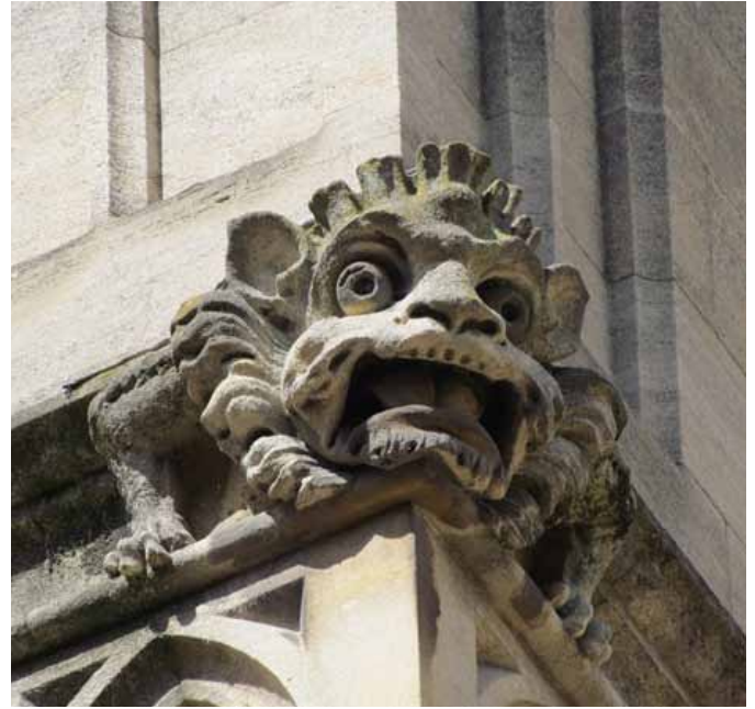
One of the Bodleian Library gargoyles

Over time some of the Bodleian Library gargoyles wore away. So in 2009 a competition was set up for children from Oxford schools to design some new ones. The designs had to be based on myths, monsters or people with a historic connection with Oxfordshire. Of the 500 entries nine were chosen. Try to spot them on the northwest wall – look for stone that is lighter in colour than the surrounding features. The designs include a dodo based on the one at the Natural History Museum that you saw earlier, a wild boar inspired by a local tale of a wild boar choking on a book, Aslan the lion from The Chronicles of Narnia by CS Lewis, and the 'Green man', a mythological creature symbolising nature.