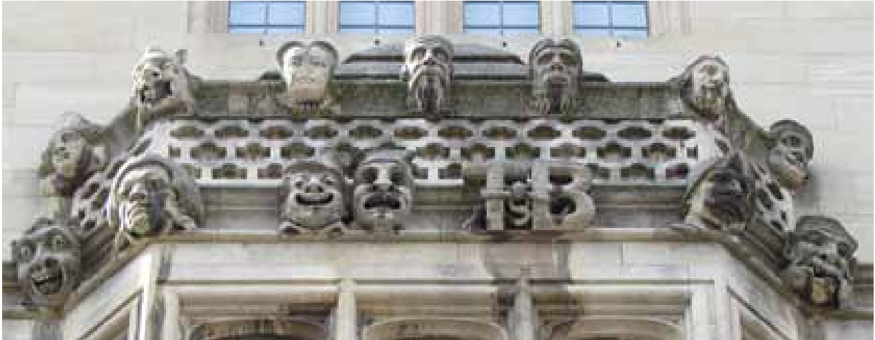
Some of the Bodleian Library gargoyles

Look up to the walls of this spectacular courtyard at the stone faces staring down at you. These are gargoyles. The word gargoyle comes from the French gargouille which means 'throat' or 'gullet' and similar European language words relating to gargle and swallow. Gargoyles are waterspouts designed to channel rainwater away from the walls. Although functional they are also decorative.