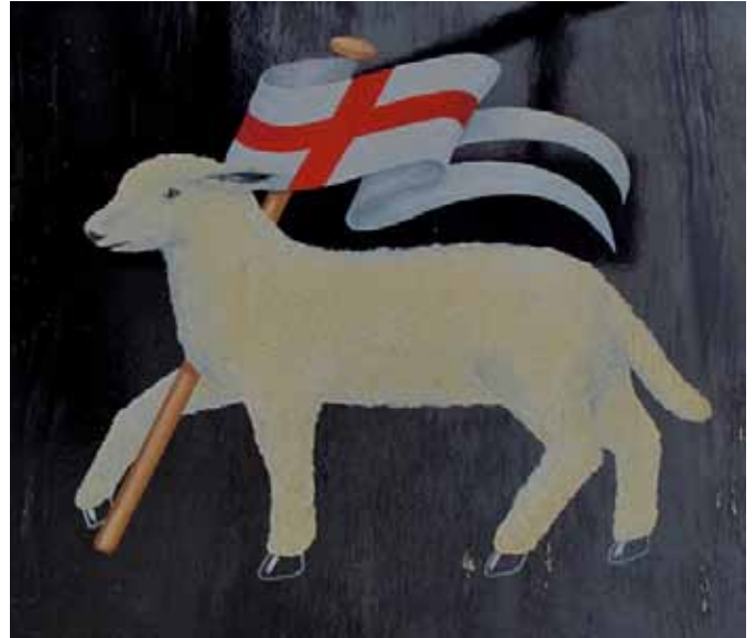
The Lamb & Flag pub sign, St Giles

Jesus Christ was represented as being the perfect sacrificial lamb whose death brought forgiveness for all humankind. In the Bible John the Baptist says of Jesus: “Behold the Lamb of God who takes away the sins of the world” (John 1:29). The lamb and flag has therefore become symbolic of St John the Baptist.