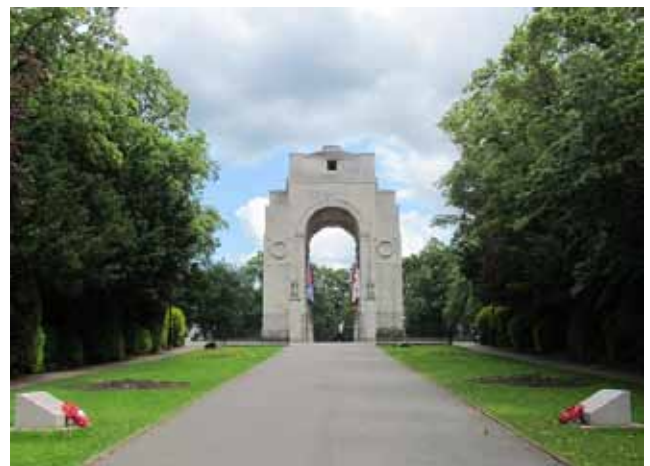
Views of multicultural Leicester

Directions 1 - Make your way to Leicester railway station. Find a safe place to stop on the pavement outside the main building. Please take care crossing the roads.