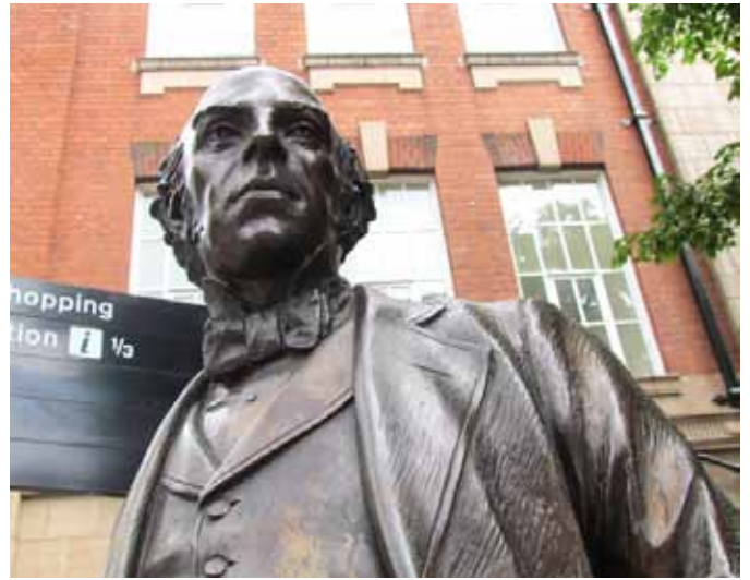
Thomas Cook's statue

The Midland Railway Company approved and 500 passengers travelled to Loughborough and back for a shilling on a train arranged by Thomas Cook.