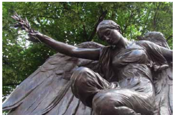
The 'War' and 'Peace' sculptures of the Boer War memorial

Country links - Australia, Barbados, France, Germany, United States of America