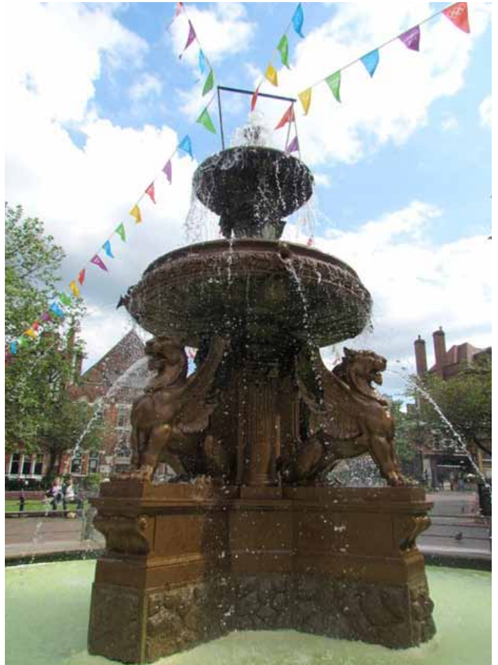
The Town Hall Square fountain

While exploring the city of Leicester we have found evidence of links to over 60 different countries. Maybe you spotted more. If you did, please let us know. And if you enjoyed this walk, look on the Walk the World website and you will find more in different parts of Britain that you can try. Why not think about creating a walk of your own?