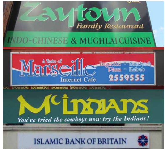
Some of Leicester's international shop fronts

Migration to Leicester from these countries began after the 1948 British Nationality Act which gave people who lived in countries of the British Commonwealth the right to move to Britain. As we heard earlier many people were encouraged to migrate to Britain due to a shortage of workers after the Second World War.