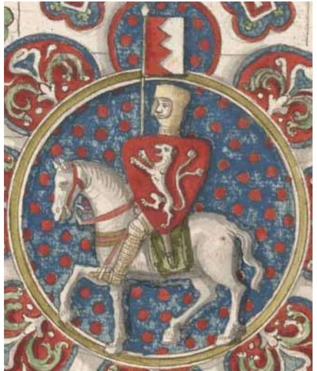
Simon de Montfort depicted in a stained glass window at Chartres Cathedral in France

After a rule of just over a year he was killed by forces loyal to the king in the Battle of Evesham. Various local honours in Leicester were dedicated to his memory. There is also a statue of him on the Haymarket Memorial Clock Tower. A relief of de Montfort also features on the wall of the Chamber of the United States House of Representatives.