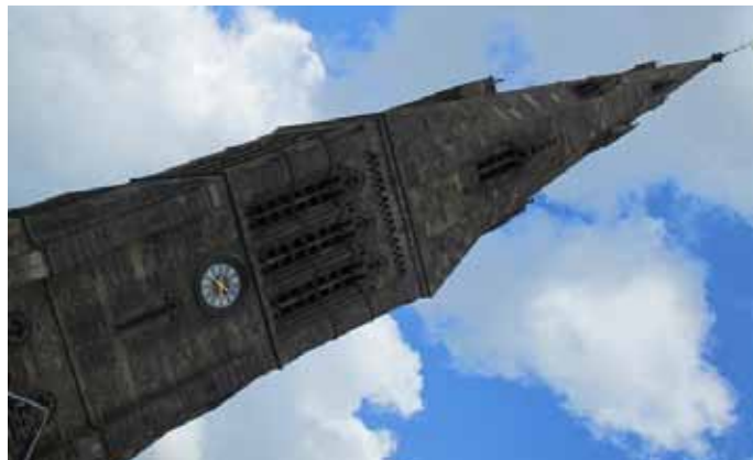
Leicester Cathedral spire

The cathedral has many other links with France. For example, the east window was installed as a monument to those who died in the First World War in France and Belgium. The window shows various saints including Joan of Arc.