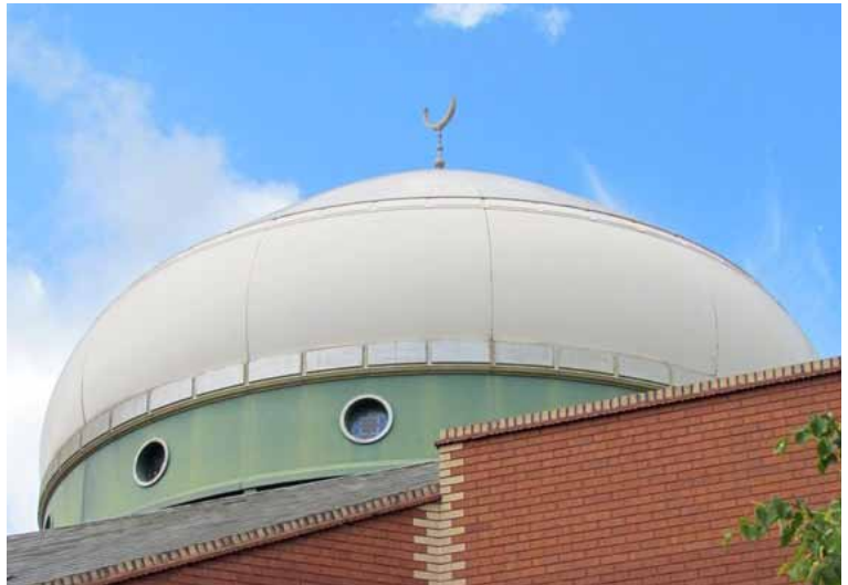
The mosque's domed roof

This building is Leicester Central Mosque which was built in 1988. Mosques are places of worship for people who believe in Islam. Islam is mainly practised in Arabian states such as Iran, Afghanistan and Syria as well as Pakistan. Islam has over 1 billion followers worldwide.