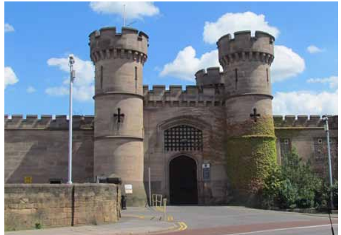
HM Prison Leicester is often mistaken for a castle

Leicester Prison currently has a capacity of 392. Famous former inmates of this prison include the R&B singer Mark Morrison. His parents were from Barbados, although he was born in Germany before they moved to Leicester.