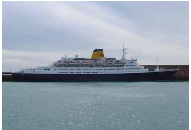
The Saga Ruby at Dover, July 2012. It's home port is in Malta and the ship has travelled to the United States, Norway and the Bahamas

Catamarans are vessels with two hulls that originated in India as small fishing boats. The first hovercraft were developed in Austria, Russia and Finland. The first commercial hovercraft was tested between Dover and Calais from 25th July 1959, the 50th anniversary of Bleriot's flight.