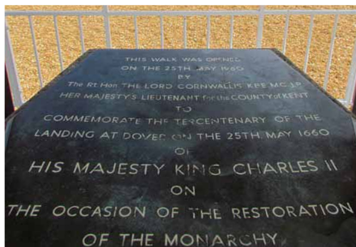
Detail from the Restoration Memorial

Support for the commonwealth faded after its leader, Oliver Cromwell, died. Parliament invited Charles II back to England to resume the throne. On May 25th 1660 he arrived on Dover beach from the Netherlands, met by cheering crowds and a gun salute from the Castle.