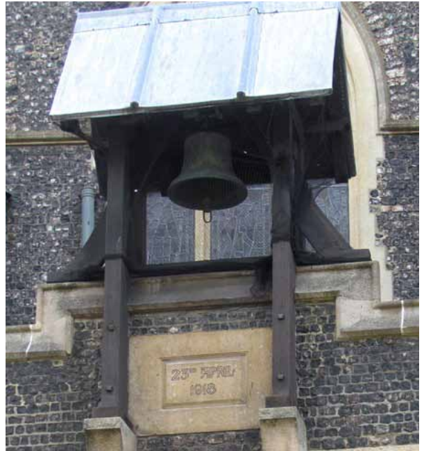
The Zeebrugge Bell, Dover Town Hall

The building was added to over the centuries including a chapel in 1227. King Henry III is thought to have attended a service here. When Henry VIII founded the Church of England in the 1530s the Maison Dieu was given to him and it became a military hospital and supply base.