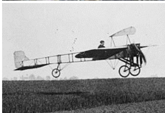
Channel pioneers (top to bottom) Charles Rolls driving the first Rolls-Royce, Blanchard's balloon crossing, Bleriot in flight

Country links - Belgium, France, Switzerland, Trinidad & Tobago, United States of America