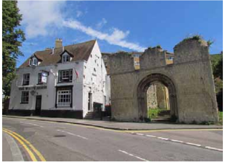
The ruins of Old St James Church beside The White Horse pub

The Cinque Ports were five ports on Britain's south coast – Hastings, Romney, Hythe, Sandwich and Dover. These ports had special royal privileges, such as tax exemptions and their own law courts. In return the ports were expected to provide men and ships for the Navy during wartime. You can still see the Cinque Ports emblem – three ships on a red and blue shield – throughout Dover.