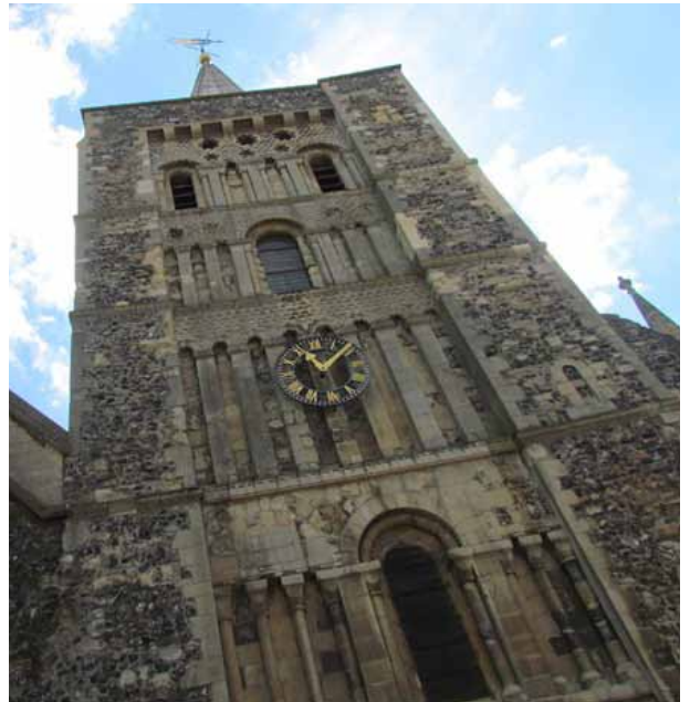
St Mary the Virgin Church's Norman tower

Do go inside if the church is open to explore fascinating links with many Olympic and Paralympic nations. Look out for an impressive Dutch wall painting of the Nativity and a stone plaque from the Protestant Churches of the Netherlands. There are also many war memorials, including to those who fell in Belgium, France, India and South Africa.