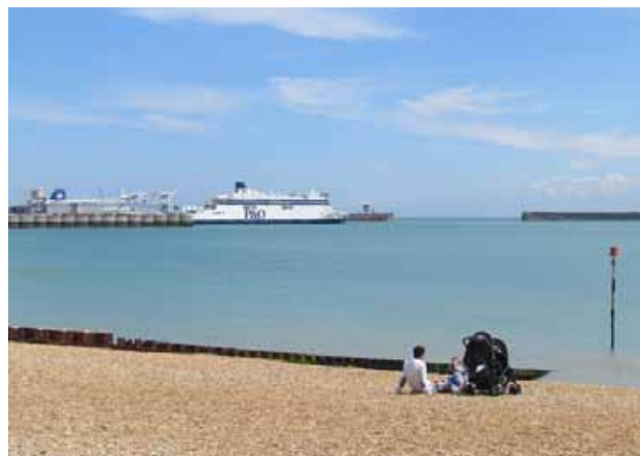
Enjoying a day at the beach

We can also see the docks that have processed goods from around the world and the ferry terminal that has welcomed travellers from around the world.