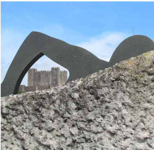
Crawling past the Castle

Dover was a Roman dock and remains a busy port two thousand years later. As a frontier town, its history is entwined with military stories of defence and attack.