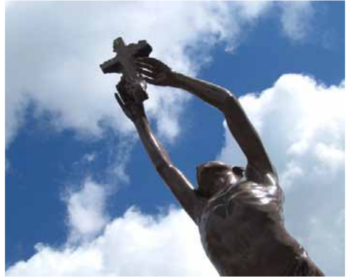
The statue of Youth, Dover War Memorial