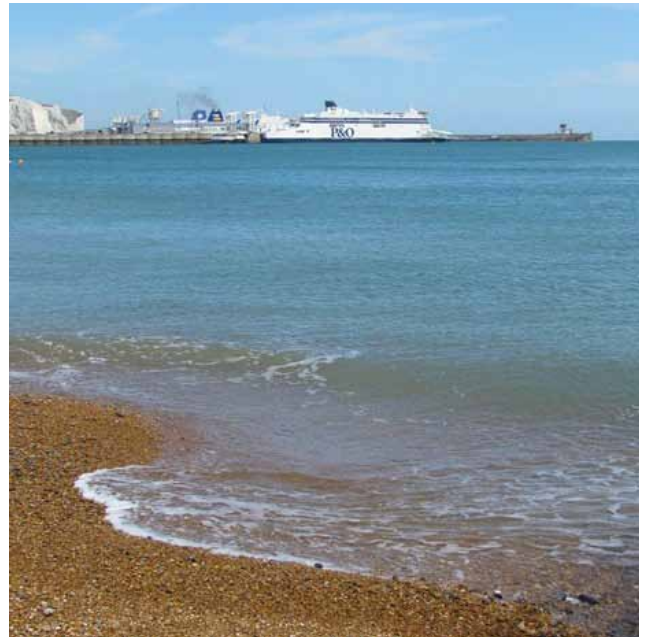
A car ferry at Eastern Docks seen from the beach

The sea is calm to-night. The tide is full, the moon lies fair Upon the straits; —on the French coast the light Gleams and is gone; the cliffs of England stand, Glimmering and vast, out in the tranquil bay.