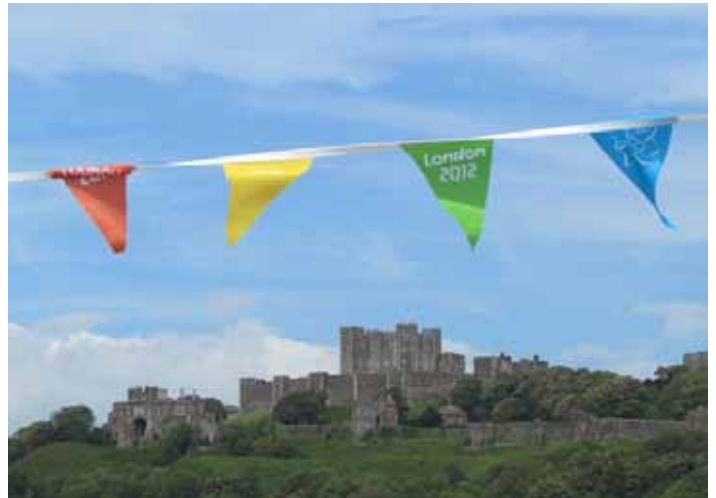
Dover gets ready to celebrate the Games

From here we can also see Dover's history etched into the chalk. We can see the Castle towering over the coast built to protect Britain from invaders. We can see Dover town nestled between two cliffs along the River Dourthe and the seafront buildings that bear the scars of war.