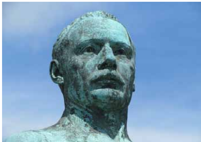
Captain Webb statue detail

People from many Olympic and Paralympic nations have swum the Channel since creating and breaking various records. They include swimmers from France, the United States, Italy, Australia, Argentina, Bangladesh, Egypt, Canada, Spain and Bulgaria.