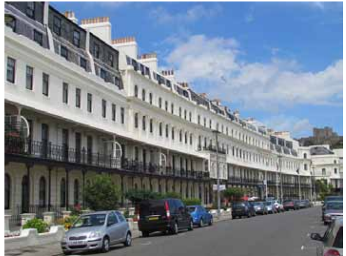
Waterloo Crescent sweeping toward the Castle

The building is part of a terrace built in Georgian style. Georgian architecture is known for well-proportioned symmetrical designs. The style became very fashionable throughout the British Empire, particularly in the United States, Canada and Jamaica. The Georgian period is named after Britain's four kings named George who ruled from 1714 to 1830. They came from Hanover in Germany.