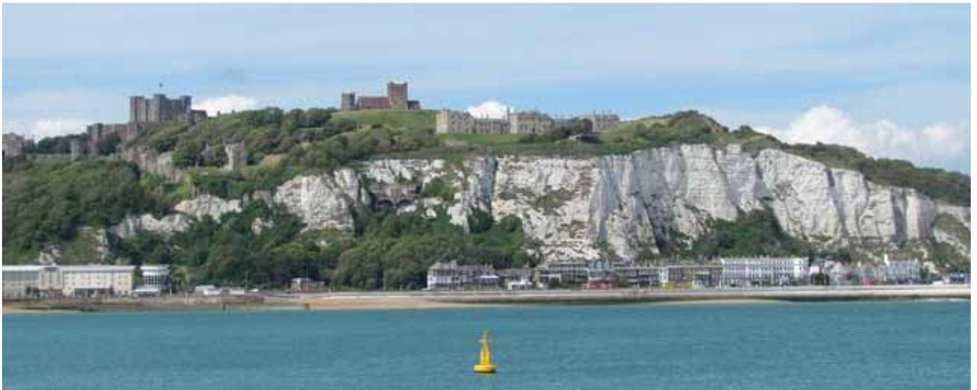
Dover beach, with the Castle on top of the White Cliffs

For centuries the ancient town of Dover on the Kent coast has been the literal and symbolic gateway between Britain and Europe. As a result Dover has been called the 'Lock and Key of England', welcoming travellers and battling invaders throughout British history.