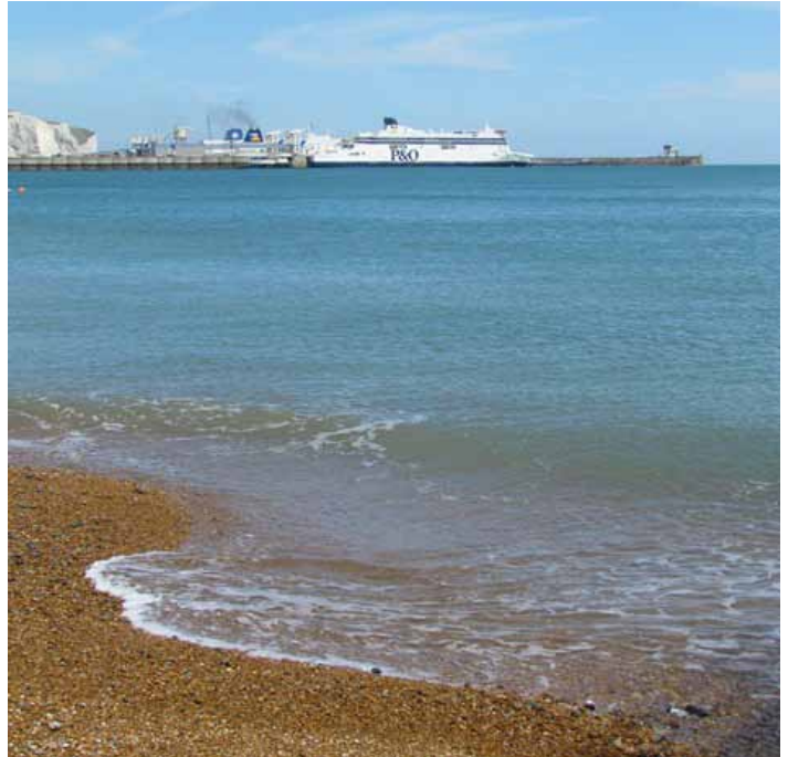
Ferry leaving Eastern Dock

Dover has been called the 'Lock and Key of England'. Located just 21 miles from France, for centuries it has been the literal and symbolic gateway between Britain and Europe.