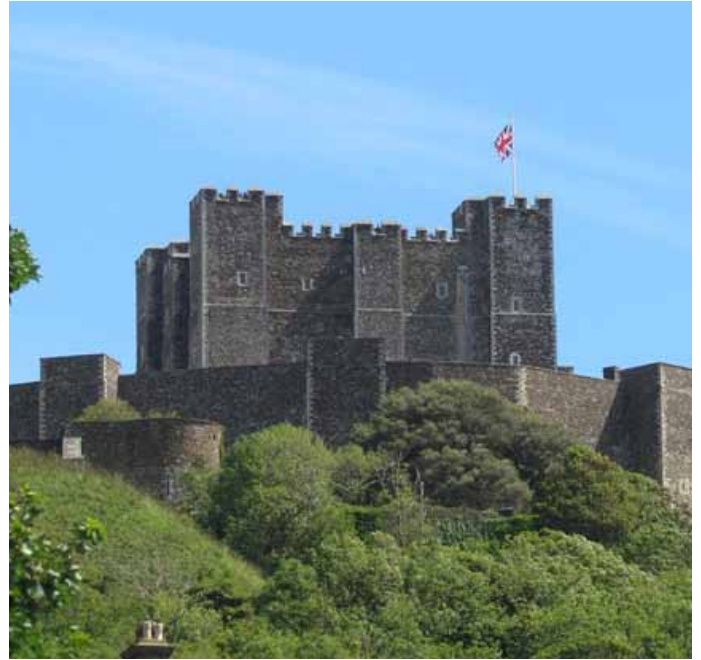
Dover Castle keep

The Saxons and the Romans first took advantage of this natural defence site. A castle was long established by 1066 when William the Conqueror arrived in Britain; he travelled to London via Dover especially to capture the Castle. Much of the Castle we can see was built 200 years later in the twelfth century. Dover became the first concentric fortress in Western Europe with two lines of defence walls.