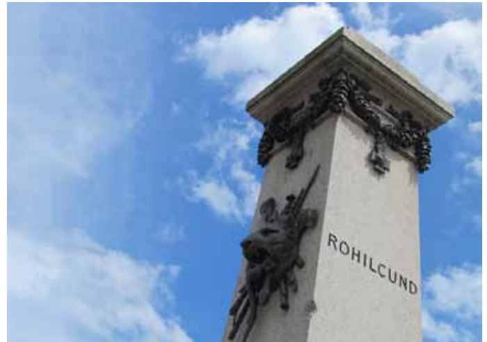
Detail from the Indian War memorial

India was the 'jewel in the crown' of the British Empire and produced many valuable commodities that were exported around the world including dye, silk, cotton, tea and opium. Most of this trade was organised by the British East India Company. The Company was very powerful with military and legal powers.