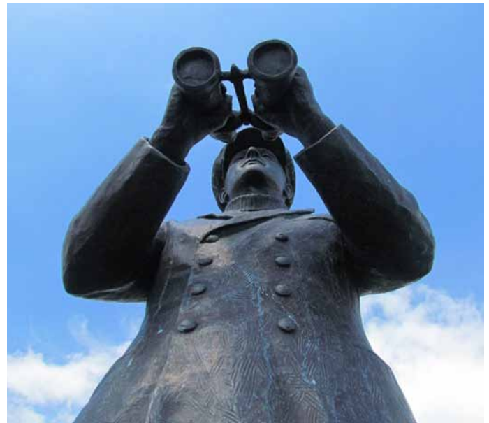
Merchant Navy memorial

This memorial is a tribute to the Merchant Navy forces that helped to protect Britain during the Second World War. As an island Britain relied on supplies shipped from abroad. For Britain to survive the war it was essential to keep sea supply lines open. So Merchant Navy ships continued to import goods into Dover despite constant attacks from enemy submarines and aircraft.