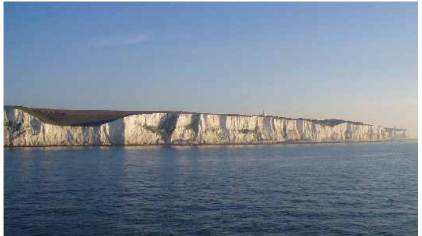
The White Cliffs seen from a car ferry into the Eastern Docks

The cliffs are about 136 million years old and reach up to 350 feet (110 metres) high. They get their distinctive colour as they are made of chalk highlighted by black flint.