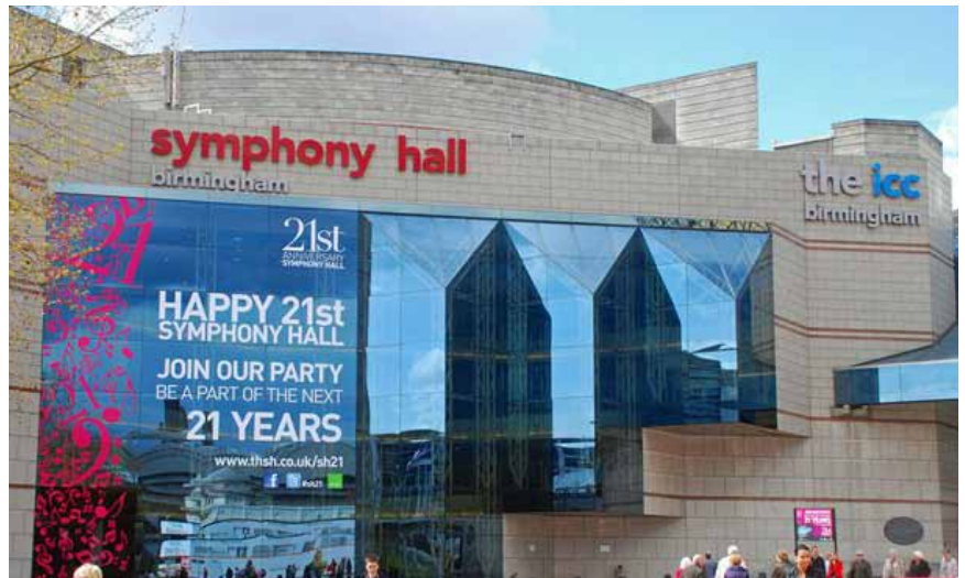
Symphony Hall has the largest mechanical organ in the country

One of its main purposes was to attract new industry to the city at a time when manufacturing was in decline. It was opened in 1991 by Jacques Delors the French President of the European Commission at the time.