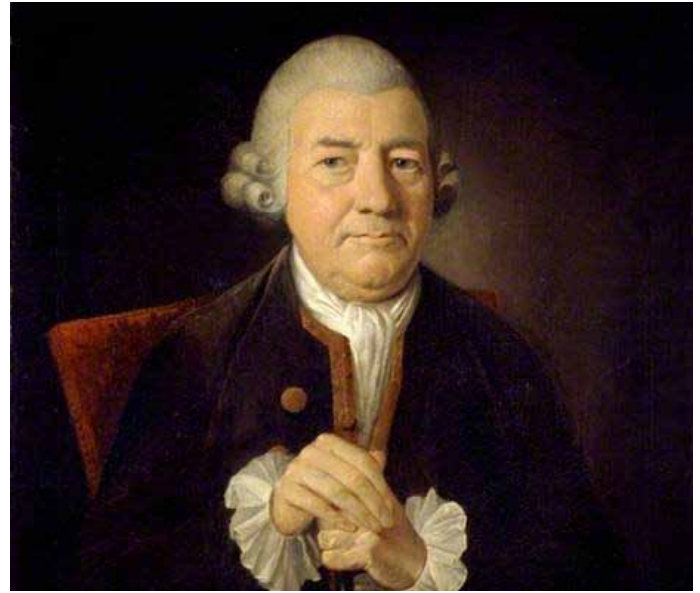
John Baskerville 's typeface is still used around the world

Later he set up a business in the manufacture of Japanned goods. This was an early form of enamelling based on the style of goods from India, China and Japan which had become popular in Europe. John Baskerville's japanning business made him a wealthy man and allowed him to turn his attention to his main passion - typography.