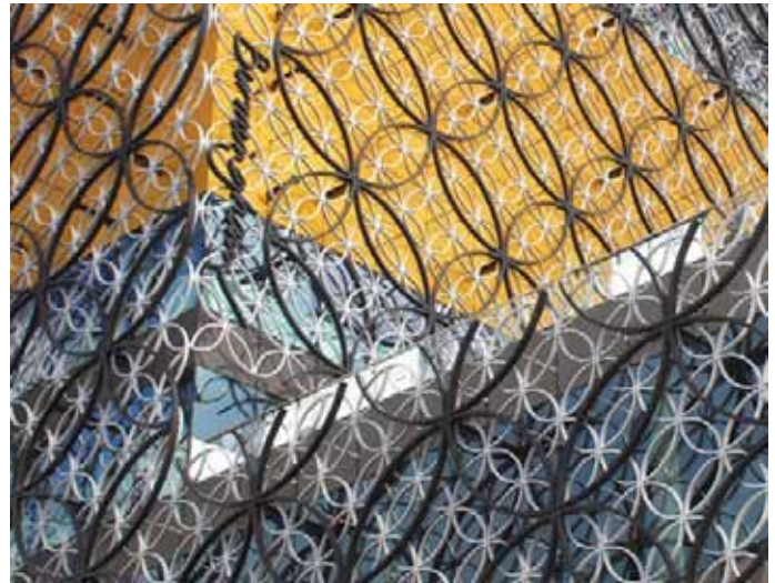
The facade of the new Library is inspired by lacework