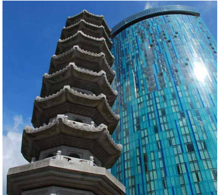
The Chinese pagoda, Holloway Circus

Wing Yip arrived by boat in 1959 from Hong Kong at the age of 19 with just £10 in his pocket. He opened a Chinese restaurant in Clacton-on-Sea and went on to open more restaurants and take-aways in East Anglia. Ten years later he opened a grocery shop here in Birmingham. From these small beginnings he has grown a food empire that now employs 400 people and supplies more than 2,000 Chinese restaurants around the country.