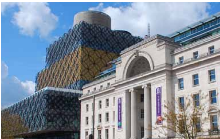
Old and new - the Library of Birmingham beside Baskerville House

We started the walk in the area where Birmingham began as a market town and have seen evidence of Birmingham's trade and manufacturing history. We saw how migrants have been attracted to Birmingham over the centuries and we have walked through some of the areas where they settled. And we have seen the current Big City Plan taking shape in new spectacular buildings.