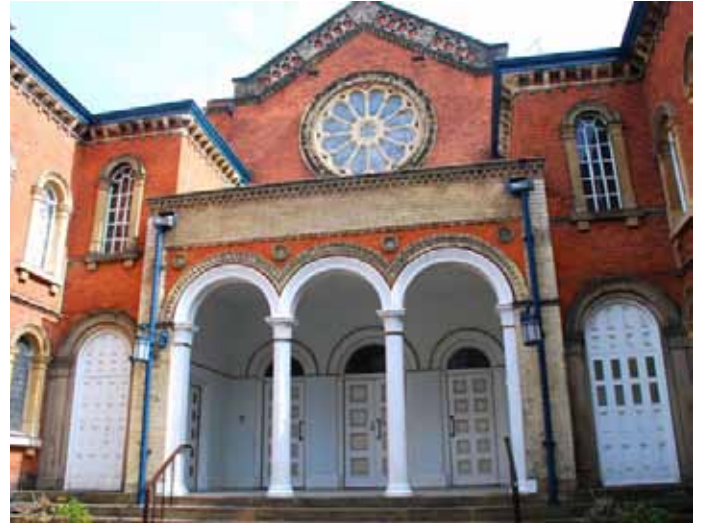
Singer's Hill Synagogue

The building that we are now outside is the 'Singers Hill' synagogue which dates from 1856 and has played an important part in the lives of the Jewish community in Birmingham. Records suggest the presence of a small Jewish community as far back as the thirteenth century and there was certainly a synagogue here in the eighteenth century.