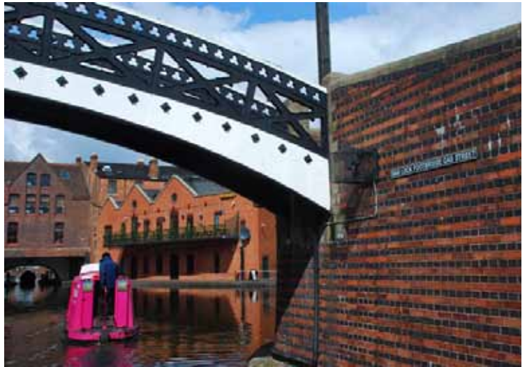
Bar bridge, Gas Street Basin

Birmingham's business people soon recognised that canals could help overcome this weakness. By 1800 Birmingham found itself at the hub of the canal networks.