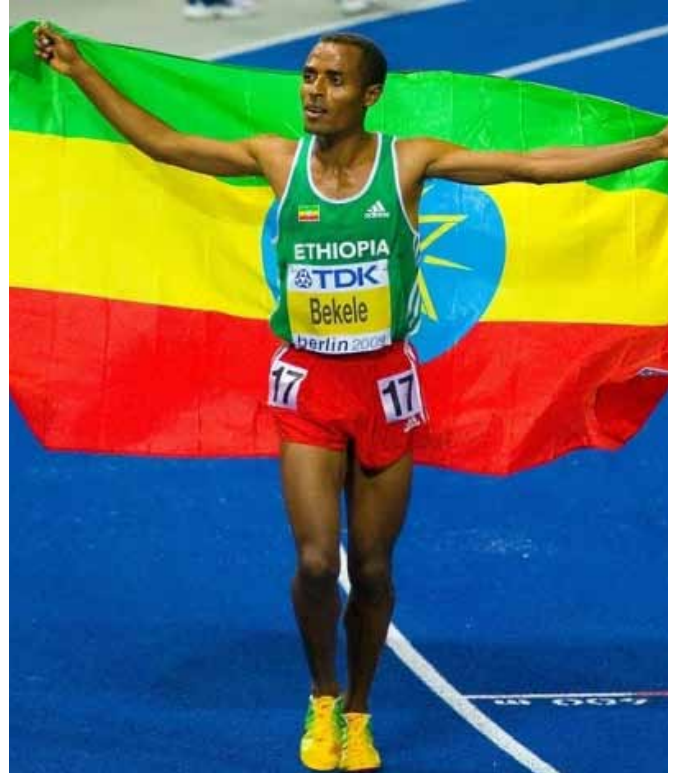
Ethiopian runner Kenenisa Bekele

Bands such as Coldplay and Oasis have played here and in 1998 the Arena hosted the Eurovision song contest. The event was hosted by Irish-born Terry Wogan and Swedish-born Ulrika Jonsson and was won by Dana International of Israel. Sir Cliff Richard has played here over 50 times and it has also hosted many other entertainment events such as the spectacular Disney on Ice shows, The Lord of the Dance, Cirque Du Soleil and La Traviata.