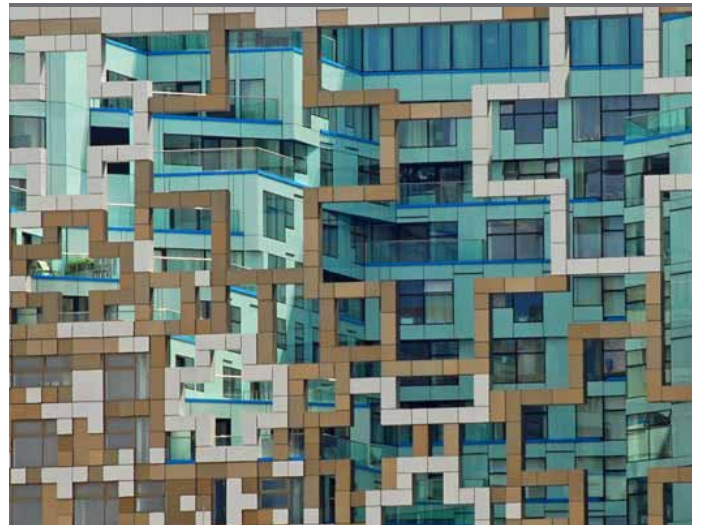
Ornate window frames on The Cube