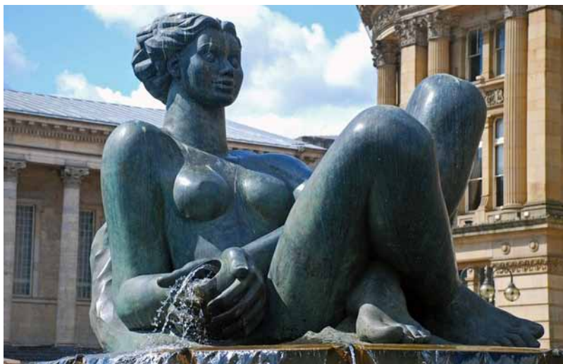
The "Floozie in the Jacuzzi"