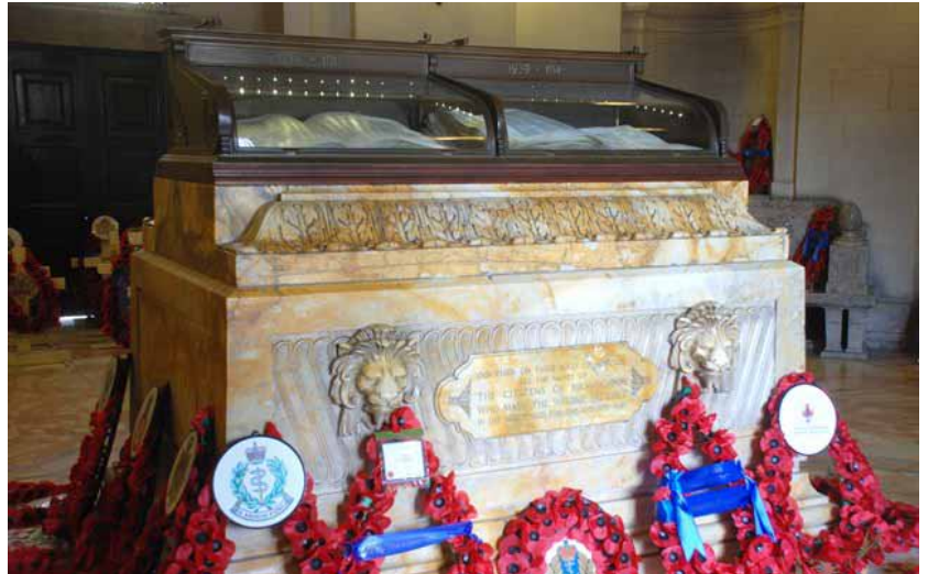
The Italian marble sarcophagus dais

Inside the Memorial is a sarcophagus-shaped dais made of Siena marble. On top of this is a casket containing two books which are the rolls of honour for the First and Second World Wars.