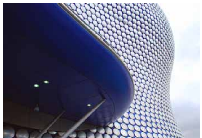
Views of the 'Workshop of the World'