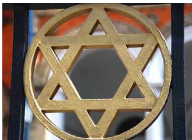
Views of international Birmingham Mike Jackson © RGS-IBG Discovering Britain

Directions 1 - Begin the walk at the Bullring shopping centre. Make your way to the statue of a bull outside the West Mall on Level 3.