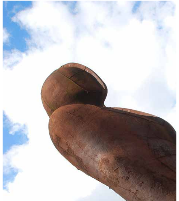
Iron: Man by Anthony Gormley

The Iron: Man statue is said to represent the traditional skills of Birmingham and the Black Country but as a piece of art it divides opinion. It is a fitting place to end our walk however as it shows how Birmingham is a city with a proud heritage of manufacturing and migration plus somewhere that is always changing.