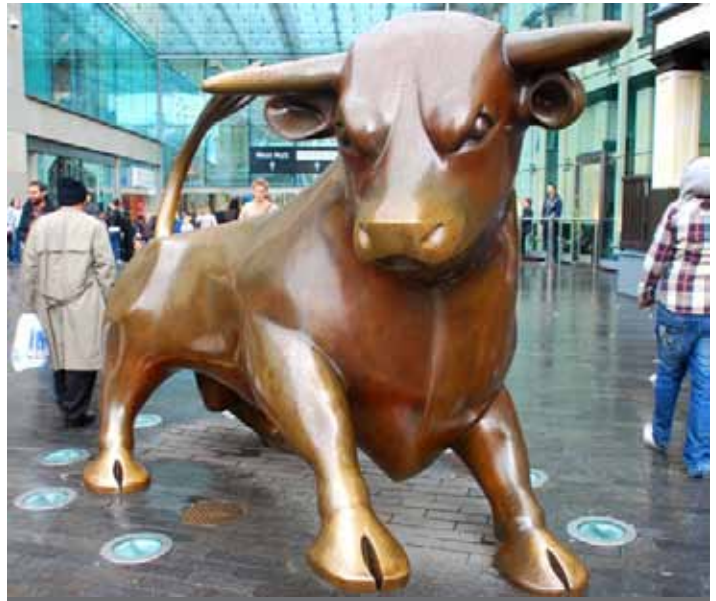
Bull sculpture at The Bullring shopping centre

The use of animals for sport and wagering has been practiced all over the world for centuries. The oldest recorded type of animal fighting is cockfighting, which dates back over 2,500 years.