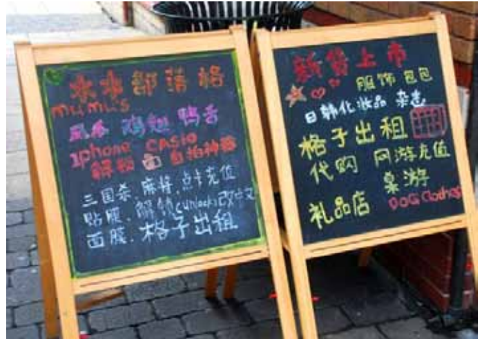
Chinese blackboards in the Arcadian shopping centre

Many of them set up catering businesses and, as the Chinese take-away grew in popularity, so more Chinese came and brought their families with them. A cluster of Chinese businesses developed around Hurst Street and by the 1980s this area was officially recognised as the Chinese Quarter. Now the Chinese population is estimated to be around 12,000. The Arcadian shopping centre here is the focus for the Chinese community's colourful New Year celebrations.