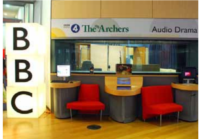
BBC studios at The Mailbox Mike Jackson © RGS-IBG Discovering Britain

The building re-opened in 2000 as an upmarket development of offices, shops and restaurants. Among the residents here is BBC Birmingham, where we are now.