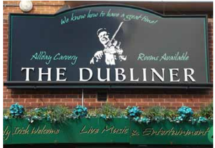
The Dubliner pub sign, Digbeth

This part of Birmingham is regarded as the Irish Quarter. Records show that there has been an Irish community in Birmingham since the 1600s.