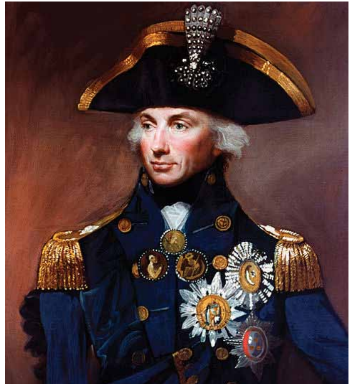
Rear-Admiral Sir Horatio Nelson

Every year Lord Nelson's great victory at Trafalgar in 1805 is celebrated with a ceremony led by the Lord Mayor of Birmingham during which a garland of flowers is placed on the statue.