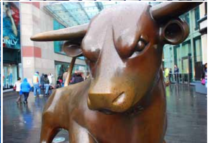
Some of the sights around Birmingham

Country links - Austria, United States of America