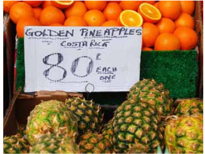
Worldwide fruit for sale at the Bull Ring

Here at the outdoor market you will find fresh fruit and vegetables of all kinds. In the past you would have found local produce that was in season. But with today's global transport systems you can now buy fresh produce from all over the world, many reflecting the cultural backgrounds and tastes of Birmingham's diverse communities.