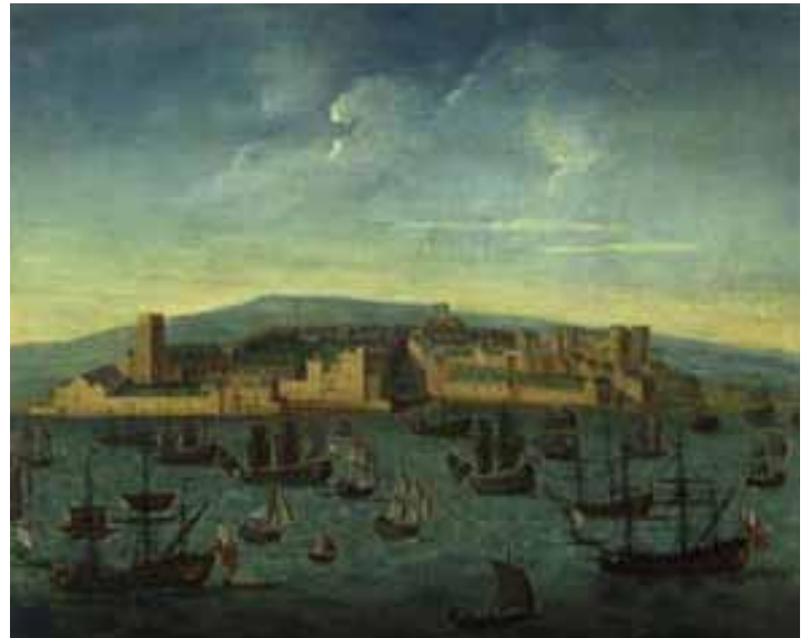
A painting of Liverpool from circa 1680, thought to be the oldest existing depiction of the city

Tea from China, bananas from Jamaica, timber from Sweden, rice from India, cotton from America, hemp from Egypt, sugar from Barbados... These are just some of the goods that arrived at Liverpool's docks. In the nineteenth century, 40 per cent of the world's trade passed through Liverpool.