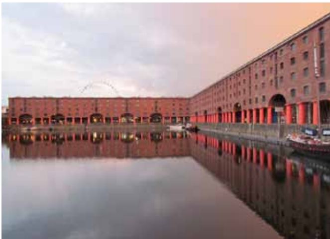
Albert Dock

Though Liverpool's port employs less people today, the city still has a proud maritime industry. On this walk you can find out more about the different products shipped from around the world. Discover warehouses where goods were stored, streets where ropes were made and a pub where sailors drank. Visit memorials to those who died on merchant ships, a hotel where transatlantic passengers stayed, the headquarters of shipping companies, and a church named after the patron saint of seafarers.