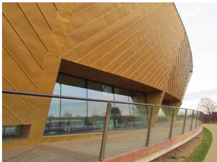
Firstsite Gallery reflects the town's contemporary culture

Discover a legacy of rulers from Belgium, Italy, Germany and Denmark. Find out about other people who left their mark on the town including the Normans, the Flemish and a man who made millions in Mexico.