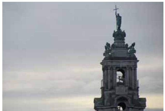
Scenes from around Colchester