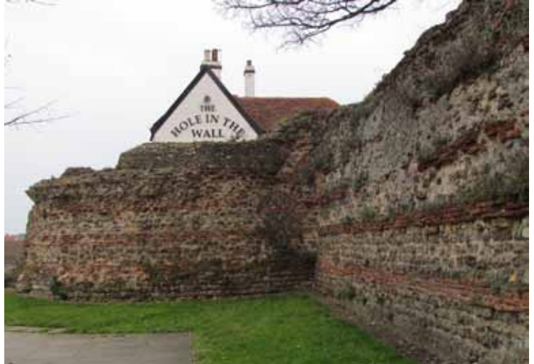
Roman walls are evidence of Colchester's military past

Welcome to Walk the World! This walk in Colchester is one of 20 in different parts of the UK. Each walk explores how the 206 participating nations in the London 2012 Olympic and Paralympic Games have been part of the UK's history for many centuries. Along the routes we will discover evidence of how many countries have shaped our towns and cities.