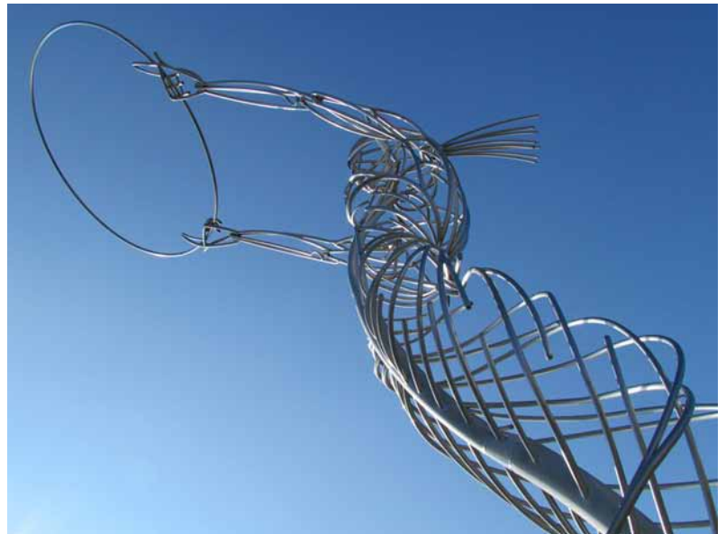
The Spirit of Harmony sculpture

Birthplace of the Titanic and known as 'Linenopolis', in the 1900s Belfast was home to the world's largest linen industry and shipyard. For many years that followed, though, Northern Ireland's capital city was riven by political conflict and violence.