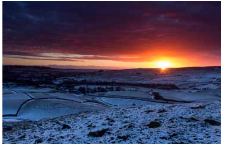
Winter sunrise from Kirkcarrion

As you gain height and the views open out, a patchwork of small fields draw the eye over gently wooded valleys towards a horizon of distant hills. It is down there in the valleys where our Bronze Age ancestors once lived and where later generations would cast their gaze towards the mound in acknowledgement of their forebears.