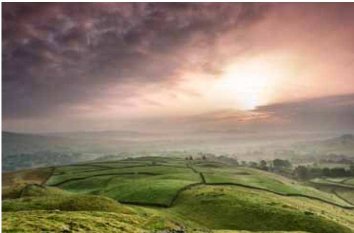
Views across the patchwork fields and drystone walls of Teesdale