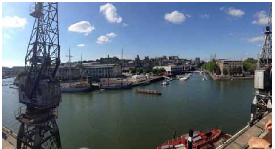
Bristol Harbour from the gallery of the MShed

It may be that this local dialect shifted the city's original name of 'Bristowe' to Bristol!