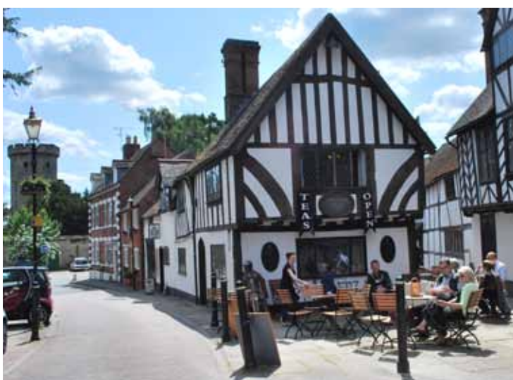
Thomas Oken's House

See changes in housing styles and construction materials through the centuries and learn how a dramatic fire led to new building regulations. Observe how the busy town centre continues to operate within a medieval street layout. Find out how the ownership of land and building use have changed over time. Visit the town's civic treasures as well as lesser-known corners.