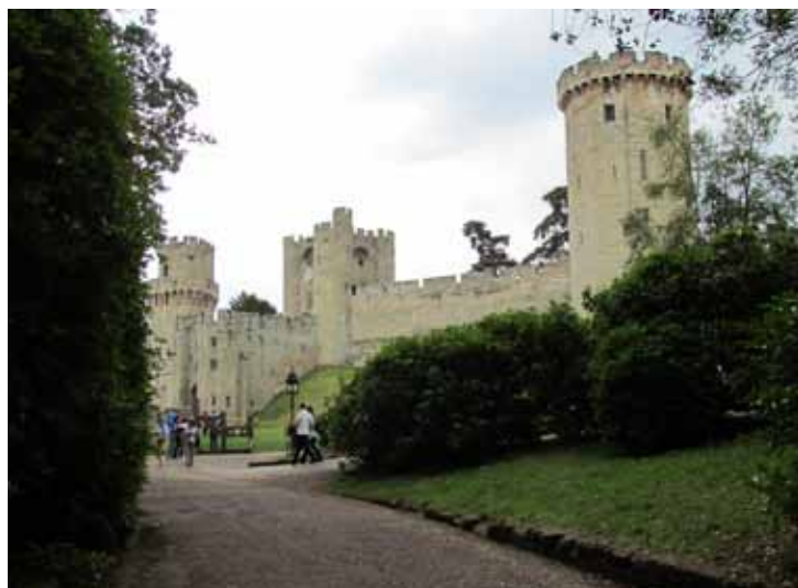
Warwick Castle

It tells a story of how this settlement has developed over the last thousand years from being the chosen site for a castle to a busy county town.