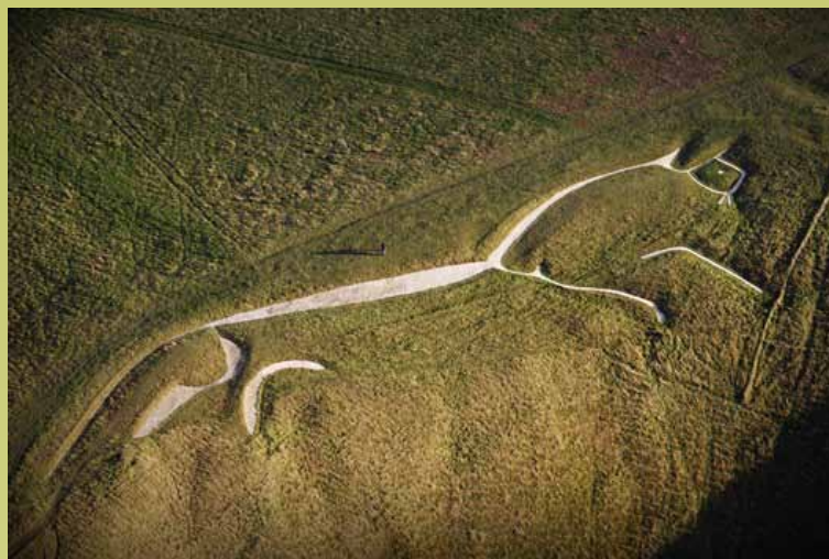
The White Horse, Uffington

A self guided walk around White Horse Hill in Uffington