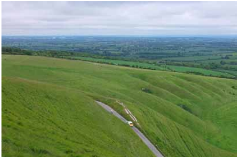
Giant's Stair, The Manger

At Uffington in South Oxfordshire, you can enjoy spectacular panoramic views, discover a unique collection of ancient landmarks and explore a picturesque village. This walk uncovers some of the stories behind and beneath this popular place.