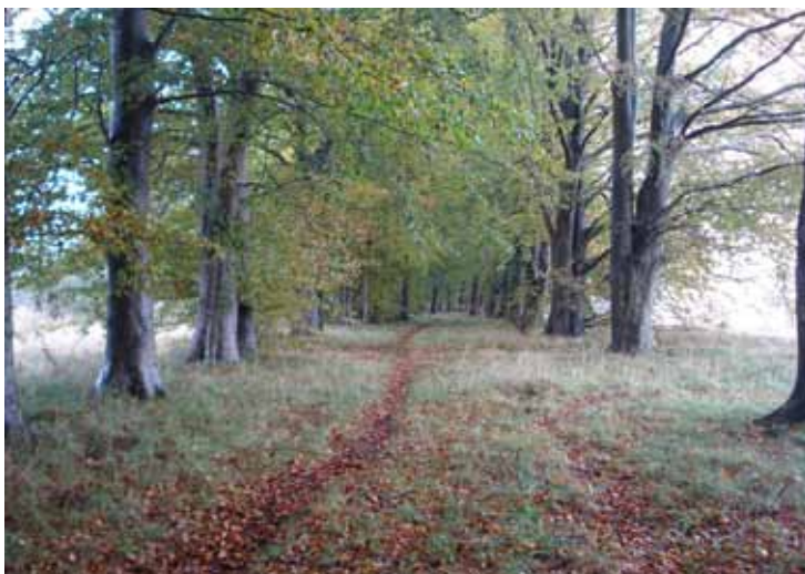
The prehistoric Long Barrow

Walk along the largest prehistoric long barrow in Britain to a 20th century East German village.