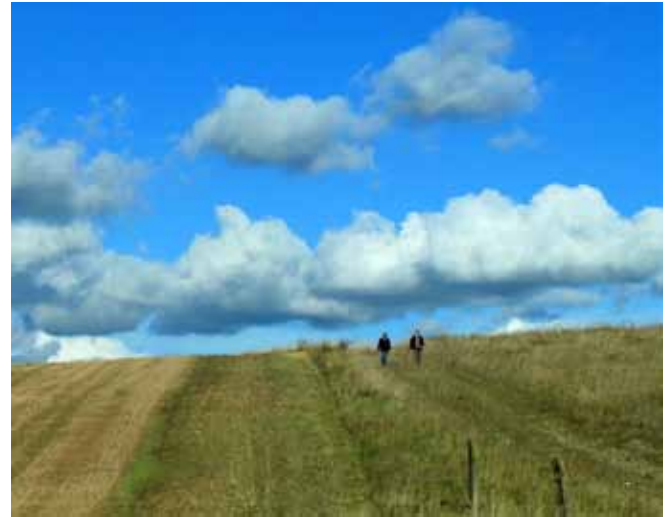
An exhilarating walk in a landscape of big skies

The walk follows public footpaths that penetrate deep into the heart of the military training area taking you out of your comfort zone and to experience a totally new kind of landscape (don't worry, it's safe and legal).