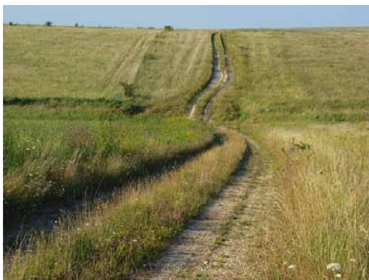
Tank tracks across the grassland