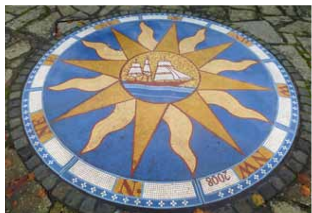
Scenes from around Port Sunlight