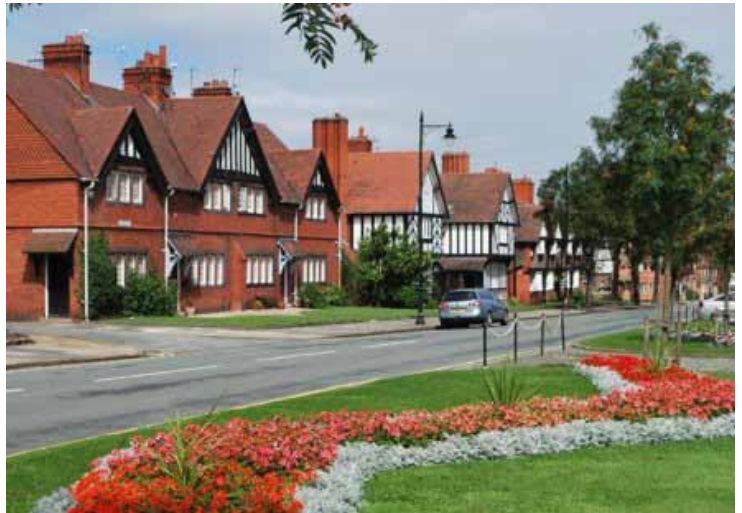
Colourful housing and planting, Port Sunlight

Lever was determined that his workers should have a decent place to live and opportunities to better themselves. To do this he employed leading architects and craftsmen to design and build a beautiful new village.