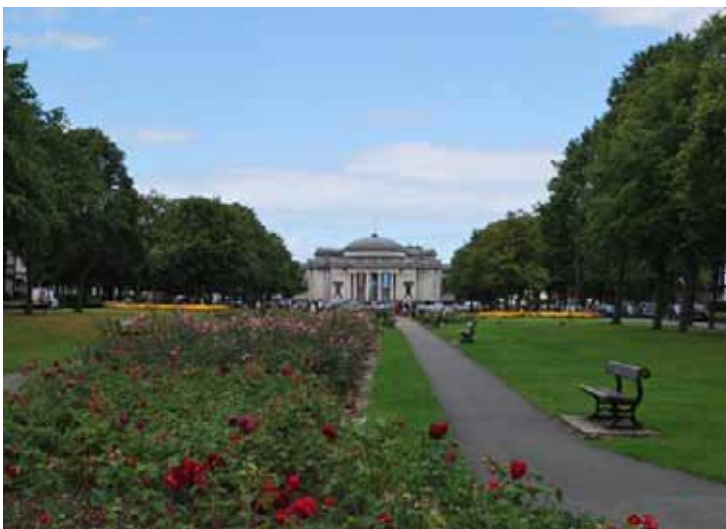
View towards the Lady Lever Art Gallery

The workers paid a fair rent for their homes. They had access to education, healthcare and social facilities. When they retired they received a pension. All this was ground-breaking for its time.