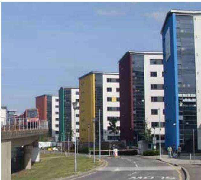
The DLR and University of East London campus

When the docks closed in 1981 North Woolwich was left isolated and in decline. So a series of projects were established to revive the area, complete with new buildings and transport networks.