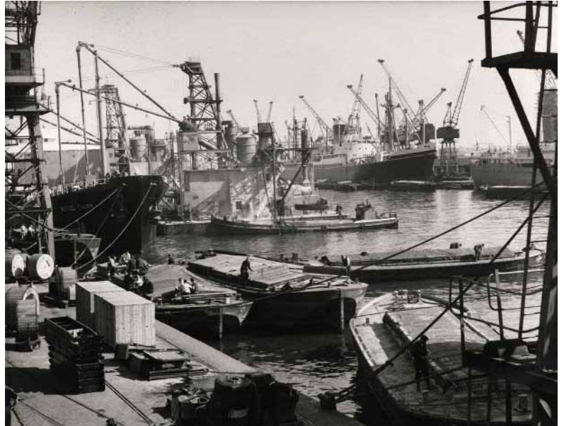
A busy day in King George V Dock (1965)

Three new docks - Royal Victoria, Royal Albert and King George V - and the trades that grew around them transformed this area into the industrial heart of the world's largest port.