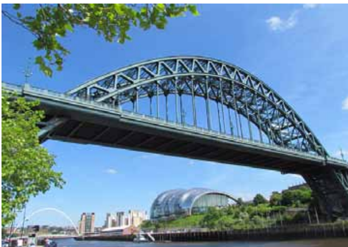
The Tyne Bridge, Newcastle

We will find out about some of the international industries and communities that have shaped Newcastle and visit some of the key sites in the city's history - including a castle, a friary, a Premier League football stadium, "Britain's finest street" and the city's world-famous riverside.