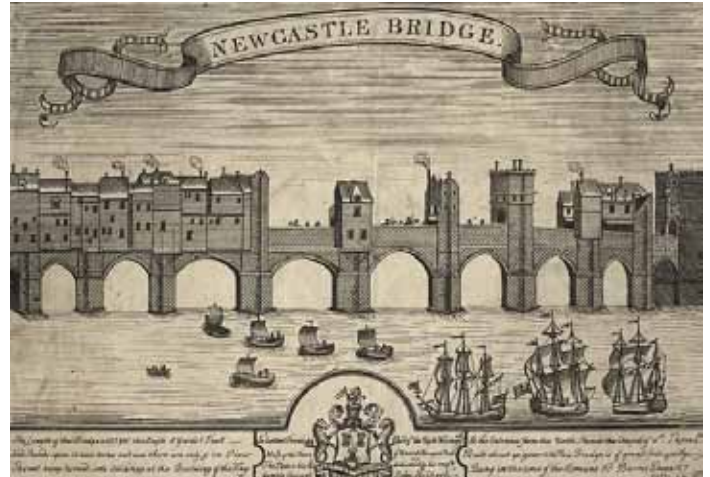
Newcastle's medieval Tyne Bridge

In later years however Newcastle's industries experienced severe decline. The city had to reinvent itself and it has since become a vibrant centre for the arts. This walk explores how Newcastle has constantly adapted since it was founded by the Romans.