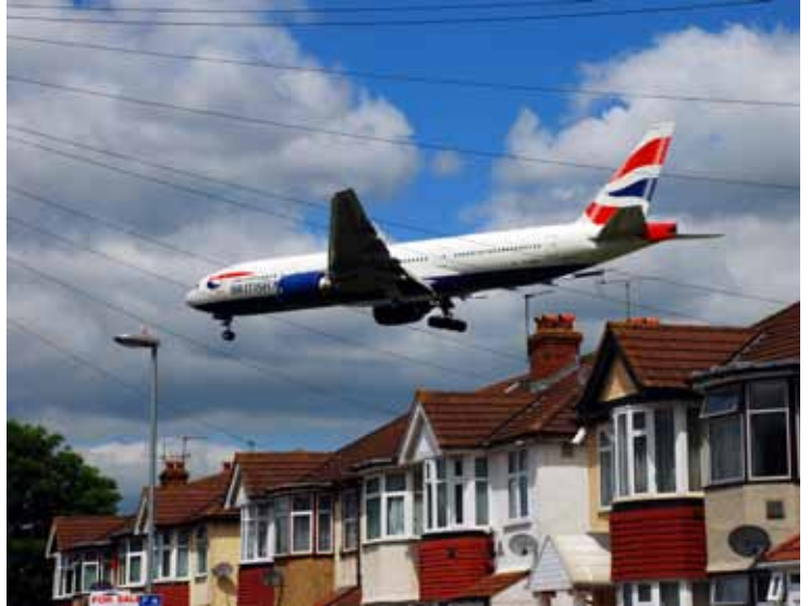
A plane landing at Heathrow runway 27L

Find out why this site was originally chosen for the airport and how politicians have struggled ever since to manage its growth. Stand on the centre line of a proposed new runway and hear arguments for and against airport expansion.