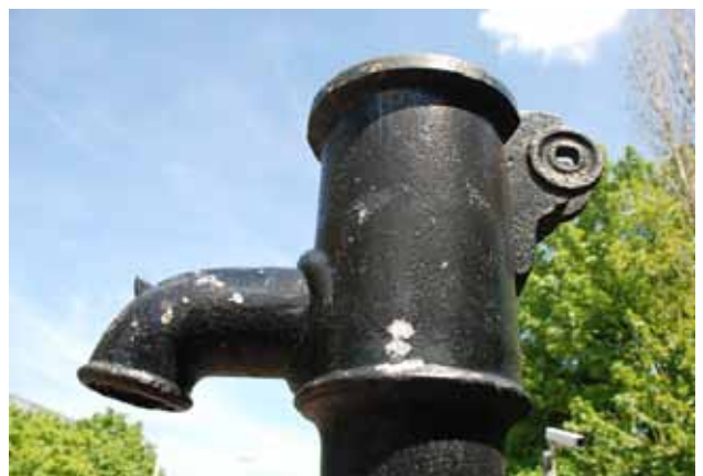
Scenes from around Heathrow