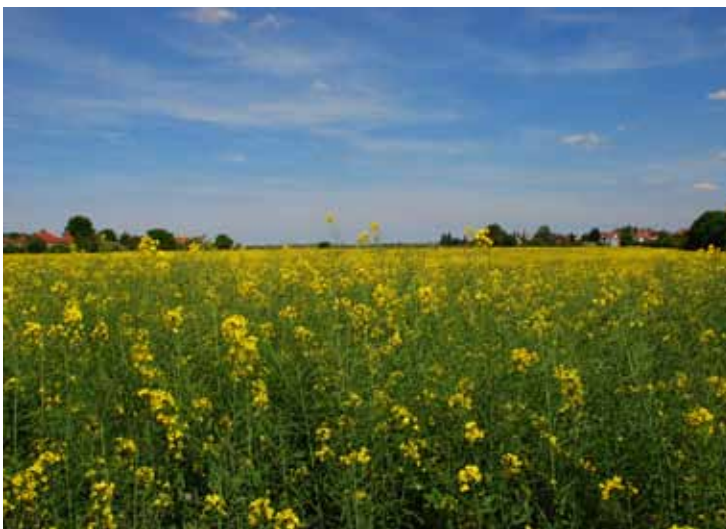
Rape seed field near Colnbrook

Experience for yourself the noise of aircraft and motorways and learn how they affect the air you breathe.