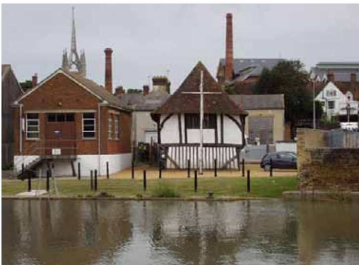
T S Hazard building

This gentle creekside walk takes you on a journey of discovery from the grand Victorian station through the medieval centre of town then out through its post-industrial edgelands to encounter the bleak beauty of the Kent marshes.