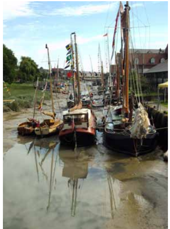
Sailing ships in Faversham Creek

The soil around the creeks and rivers was rich and fertile, pure spring water was readily available from local aquifers, and the climate was dry and temperate.