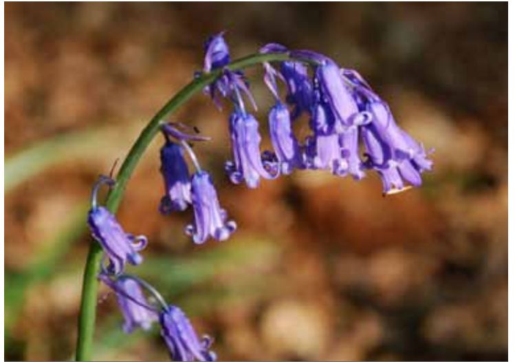
A native bluebell in Cowleaze Wood

Discover a natural world of beech woods and juniper scrub, dry valleys and freshwater springs, wildflowers and butterflies, yellow ants and red kites.