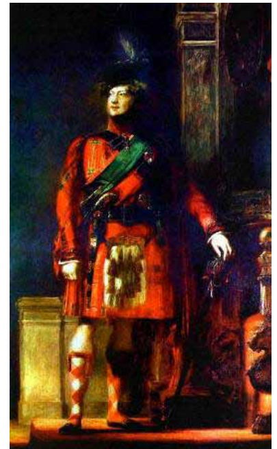
Portrait of George IV in kilt by David Wilkie (1829)

The visit was a slickly-run marketing campaign. The fortnight-long visit was full of Scottish pageantry. At a Holyrood Palace reception the king even wore a kilt – hiding his cold legs with a pair of pink tights! Wearing the kilt not only boosted the king's popularity but also established the tartan kilt as a symbol of Scotland. Events culminated with a grand parade with large crowds cheering the king to Edinburgh Castle.