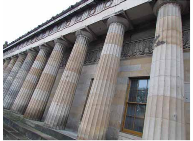
Columns outside the Royal Scottish Academy

In between the two halves of Princes Street Gardens are these two spectacular public buildings – the Royal Scottish Academy and the National Gallery of Scotland. Both are art galleries and have impressive collections by artists from across Europe. These include Botticelli, Cezanne, Degas, van Dyck, Gauguin, van Gogh, Goya, Monet, Poussin, Raphael, Rembrandt, Tintoretto, Titian, Velázquez, Vermeer and Watteau. There is also a significant collection by Scottish artists including Andrew Geddes, Henry Raeburn, Allan Ramsey, David Roberts, William Strang and David Wilkie.