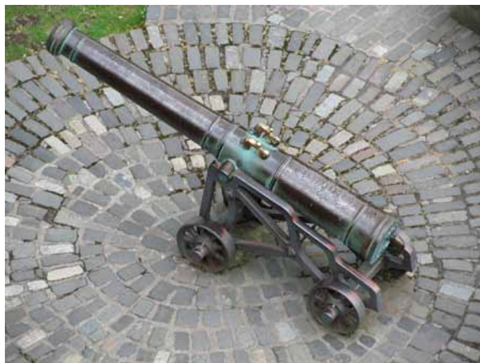
Portuguese cannon, Calton Hill

This ship's cannon, which points towards Edinburgh Castle, arrived on Calton Hill after journeying across the world. Cast in brass in the early seventeenth century the cannon was sent to the Portuguese colonies. Soon after it was built the Portuguese king, Philip III, was succeeded by Philip IV. If you look at the barrel of the cannon you may be able to see a number 4 has been stamped after the king's name along with the date 1624.