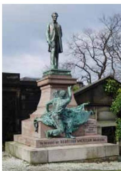
The Emancipation Monument

Near David Hume's monument one of the most famous international landmarks in the cemetery is this American Civil War memorial. Built in 1893 it was made to honour six Scottish men who fought in the American Civil War. It shows the US President Abraham Lincoln whose victory effectively abolished slavery in America. The man below him is a freed slave reaching out in thanks. The man is also holding a book to symbolise his education as a free man. Look closely and you will find other symbolic details, such as thistles and cotton plants which illustrate Scotland and America's collaboration in the war.