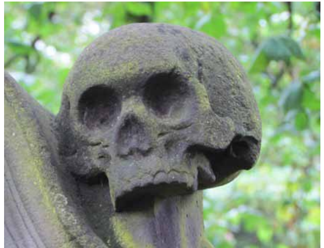
Gravestone detail, St Cuthbert's Church

This church is named after St Cuthbert, a monk and hermit from Northumbria who became bishop of the Farne Islands, south of Lindisfarne. There has been a St Cuthbert's Church on this site since at least 850 AD making the parish one of the oldest in Scotland. The current building is much younger, though, with extensive rebuilding in 1894.