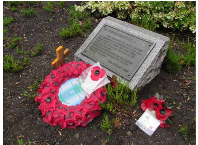
Falklands War memorial stone

Compared with the last few memorials we have seen, this is quite different isn't it? Instead of a large bronze statue here is a simple stone with specially selected trees and plants. This shows how attitudes to commemorating conflicts have changed. Rather than flag-waving patriotism memorials like this encourage reflection and international sympathy.