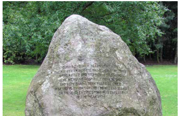
Norwegian Brigade memorial

This massive boulder is yet another interesting war memorial. Like the Scottish American memorial it is a gift from overseas – this time from Norway. It marks co-operation between Scotland and Norway in the Second World War.