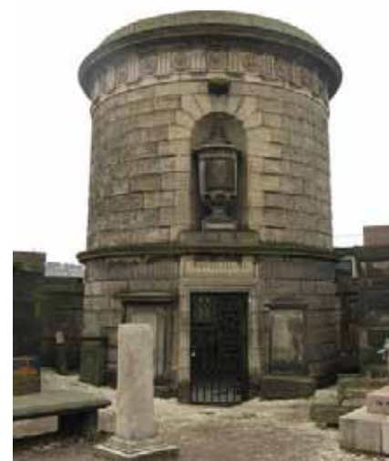
David Hume's tomb