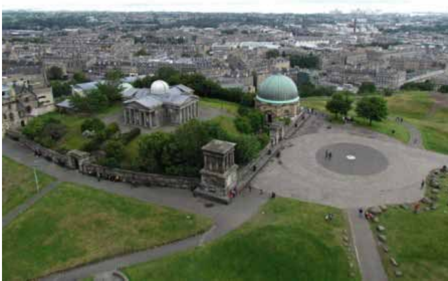
View from the top of the Nelson Monument

The walk is about 2 ½ miles long. We start in Princes Street Gardens and finish at Calton Hill. The first part of the walk is through public gardens and church yards. The second part of the walk uses pavements but crosses busy roads so please do take care. Use pedestrian crossings, look out for traffic and take care of your valuables. The walk up Calton Hill at the end is fairly steep with steps directly to the top or a longer step-free path. I hope you enjoy the walk.