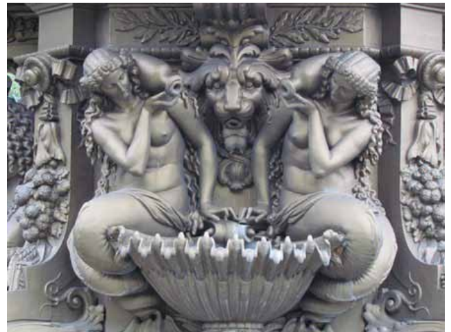
Detail from the Ross Fountain, Rory Walsh © RGS-IBG Discovering Britain

Our last stop in Princes Street Gardens is the Ross Fountain. This giant iron sculpture makes an impressive spectacle at the foot of Edinburgh Castle. Today it is one of the landmarks of the city and a Grade B listed structure of national importance but the Ross Fountain was once an unloved and highly controversial part of Edinburgh's landscape.