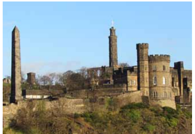
The National Monument, Calton Hill

It centres on the Castle and the Royal Mile. It was increasingly cramped and twice destroyed by fire. By the eighteenth century the Old Town was becoming too small for the expanding population so a New Town was planned.