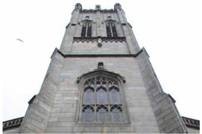
St John's Church tower

Like many churches St John's contains war memorials that commemorate members of the congregation and other locals who served and died in conflicts overseas. Do go inside and have a look along the walls and see how many countries you can spot.