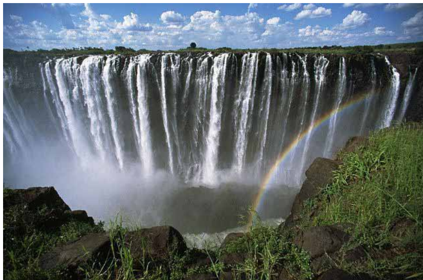
The Victoria Falls, Zambezi River