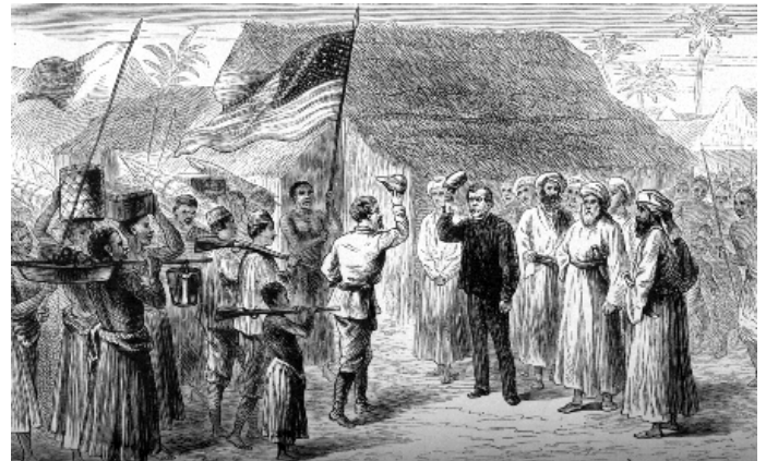
'How I found Livingstone' 1876 engraving of Stanley meeting Livingstone in the Zambezi

From 1840 until his death in 1873 Livingstone explored many parts of Africa. His missions included journeys through much of southern, central and eastern Africa, including present-day South Africa, Mozambique, Botswana, Zimbabwe, Zambia, Angola, DR Congo, Malawi and Tanzania.