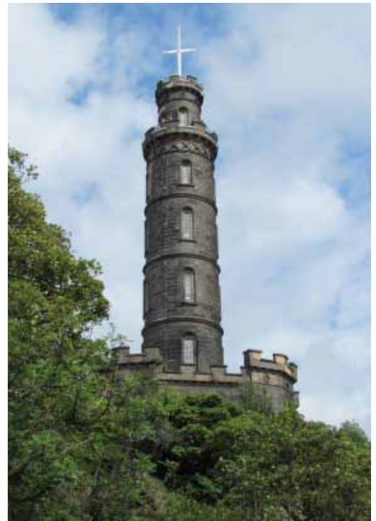
The Nelson Monument

This monument is to Nelson and all of the fallen of the Napoleonic Wars. It was built to resemble a ship's telescope. At the top is a mast similar to a ship's rigging. Look out for the memorial plaque to Nelson on the side of the building with a stone model of a ship.