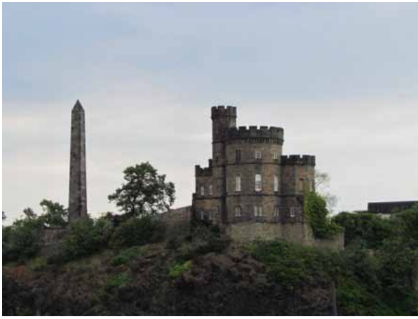
The Political Martyrs Monument (on left)

Before you leave Calton Cemetery take a look at the huge obelisk that dominates the skyline. This is the Political Martyrs Monument. It records the fate of five men who fought for political reform in the 1790s. At this time only the wealthy were allowed to vote in elections. The five men campaigned for a change in the law and instead they were arrested and transported to Australia. Two of the men died within a year of ill health while another, Thomas Muir, escaped to France. The Monument was put up in 1844 to commemorate their campaign.