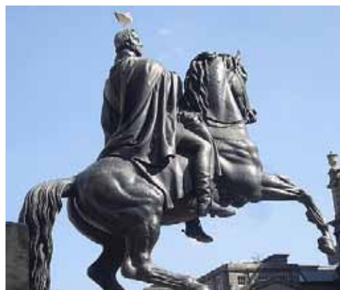
Copenhagen in Edinburgh!

Here is a magnificent statue of Arthur Wellesley, better known as the first Duke of Wellington. The Duke was one of the major military and political figures of the nineteenth century. This statue shows him mounted on one of his favourite horses – a battle steed named Copenhagen, after the capital city of Denmark. The Duke rode Copenhagen throughout the Battle of Waterloo in 1815. Waterloo is in present-day Belgium but at the time was part of the United Kingdom of the Netherlands. In this battle Wellington led the British army to victory over the French Emperor, Napoleon.