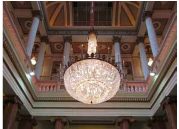
Chandelier in The Dome entrance lobby

We have now arrived at one of the most striking buildings on George Street. Today it is a bar, restaurant and nightclub called The Dome. When this building opened in 1847 it was the headquarters of the Commercial Bank of Scotland. As we heard earlier banking was a growth industry in Edinburgh in the 1840s. Bank buildings in this period were designed to impress and often used a mixture of styles. Here, for example, Ancient Greek and Roman features such as columns and steps, combine with later Italian baroque aspects like the domed roof.