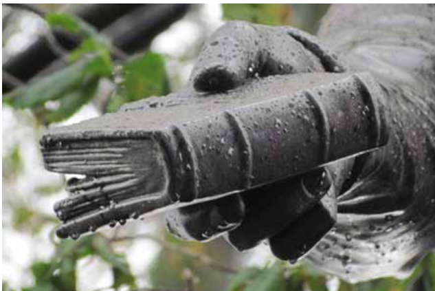
Detail of Livingstone's statue

Livingstone was one of the first Westerners to visit and map these lands. He was the first white man to make the 4,300-mile transcontinental journey across Africa. He was also the first European to see the huge waterfalls on the Zambezi River between Zambia and Zimbabwe. Livingstone dedicated his discovery to Queen Victoria and named them the Victoria Falls in her honour. There are similar statues of Livingstone to this one both on the Zambian and Zimbabwean sides of the falls.