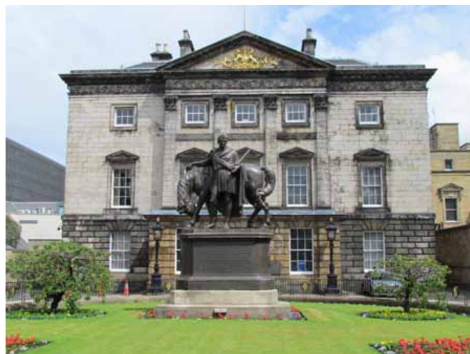
Dundas House

In James Craig's original plan for the New Town this site was intended to be for St Andrew's Church. Instead Dundas House was built. It was the home of Sir Lawrence Dundas, one of Henry Dundas' relatives. The house was built in 1774 by Swedish-born architect William Chambers. It was designed to look like a Roman villa once again illustrating the classical fashions of the time. Since 1825 Dundas House has been the head office for the Royal Bank of Scotland. Features of the house even appear on Scottish bank notes.