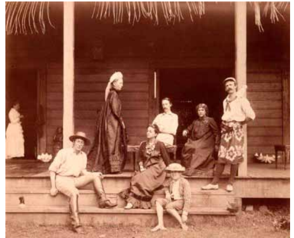
Robert Louis Stevenson (centre) at home with his family in Vailima in Samoa

Stevenson suffered from ill health throughout his life. As a result he often travelled and worked in warmer climes. These not only suited his health but also provided inspiration for his writing. His journeys included periods in southern France, Belgium, the USA – notably Hawaii and San Francisco – as well as New Zealand, Samoa, Tahiti, and other Pacific Islands.