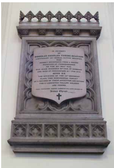
Douglas Beatson memorial

Look out for a memorial to John S S Forbes from the United States Cavalry. Forbes was killed in 1876 at the Battle of Little Bighorn – also known as Custer's Last Stand – when a US Army unit was heavily defeated by Native American tribes.