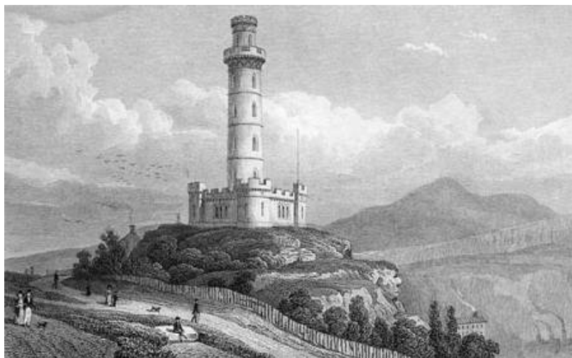
The Nelson Monument, Calton Hill (1829)