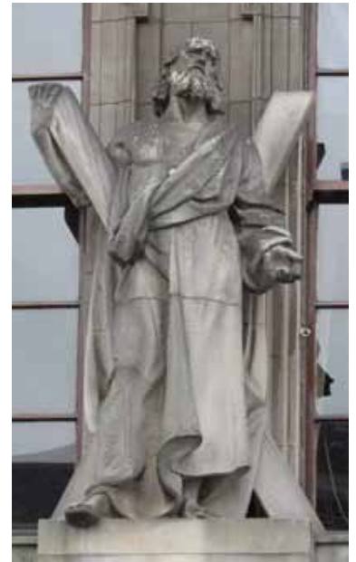
St Andrew statue on the Freemason's Hall

Outside Scotland saltires were symbols of early Christianity in the Roman Empire. Roman coins have been found with saltires on and saltires were also used as Christian symbols in ninth and tenth century Greece. They appear in heraldry and on flags. Apart from Scotland's notable flags with saltires include those of Jamaica, Grenada, Jersey, the Russian Navy, the American Civil War Confederates and various cities including Alabama, Florida and Amsterdam as well as the island of Tenerife.