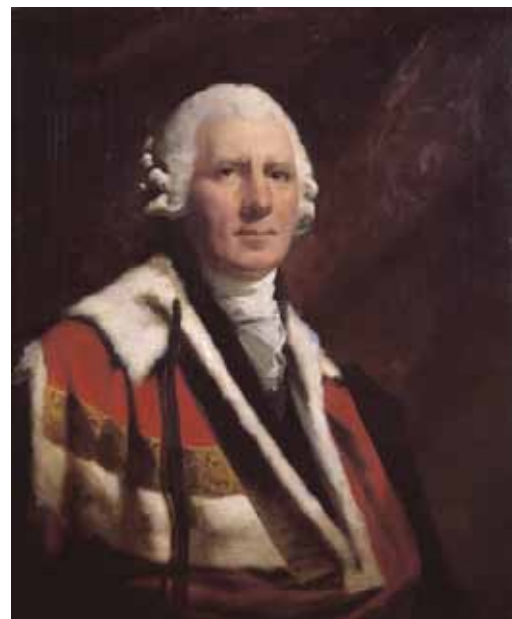
Henry Dundas, 1st Viscount Melville (c.1805) by Henry Raeburn

On top of the column is a statue of Henry Dundas. During his lifetime Dundas was considered the most powerful man in Scotland. Friends even called him King Henry IX. Dundas held several powerful political posts including Solicitor General and Home Secretary. In 1784 he became the first ever War Secretary while Britain took part in the wars of the French Revolution. These wars saw a series of military coalitions try to intervene in Revolutionary France. Over a ten year period the British fought alongside Spain, Portugal, Russia, Poland, Denmark, Norway and the Dutch Republic amongst others.