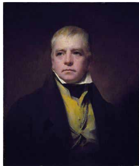
Portrait of Sir Walter Scott (1822) by Henry Raeburn

A monument this grand for a writer seems a bit strange. Shakespeare doesn't have a monument like this. Neither does Dickens. Monuments like this are usually for royalty or military figures. So why was this made for Walter Scott? Scott was an exceptional figure. He was the first writer to achieve lifetime worldwide fame. His books – such as Waverley, Rob Roy and The Heart of Midlothian – helped to give Scotland an exciting international image. They were also very popular in Europe especially in France.