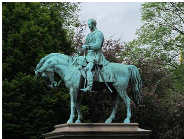
Prince Albert statue, Charlotte Square