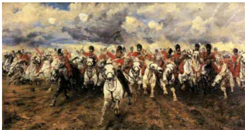
The Royal Scots Greys at the Battle of Waterloo in Scotland Forever! (1881) by Lady Butler

This statue of a cavalryman on horseback is a war memorial to commemorate the soldiers of a particular regiment – the Royal Scots Greys. They were famous for riding grey horses hence their name. War memorials often record where soldiers have served overseas and are very good places to find international connections.