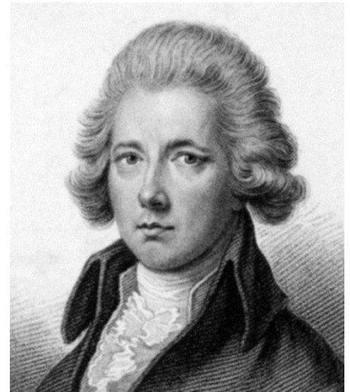
Engraving of William Pitt the Younger

Pitt's time in office was dominated by problems overseas. He oversaw the aftermaths of the American and French Revolutions. There was unrest in the British colonies especially in Canada, India and Ireland. Pitt also led the country through George III's illness and the Napoleonic Wars with France.