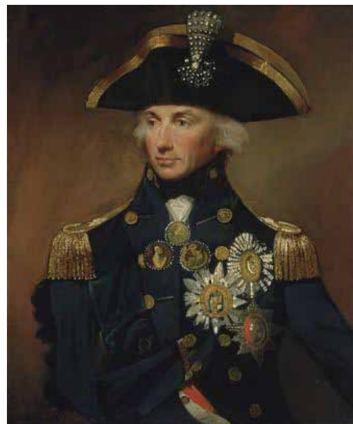
Portrait of Rear-Admiral Horatio Nelson (1800) by Lemuel Francis Abbott

Next he was in charge of accompanying convoys from Russia, Ireland, Canada and America. He then spent more time in the West Indies including Jamaica and the Turks Islands capturing a number of French and Spanish prizes. After a spell in France to learn the language he was back in the West Indies in Antigua and Nevis. He hadn't been home long before he was sent off for service again and spent the best part of the next seven years in the Mediterranean. At the end he travelled home overland including stops in Trieste, Vienna, Prague and Hamburg.