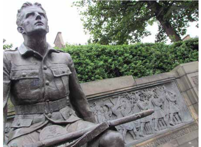
The Scottish-American war memorial