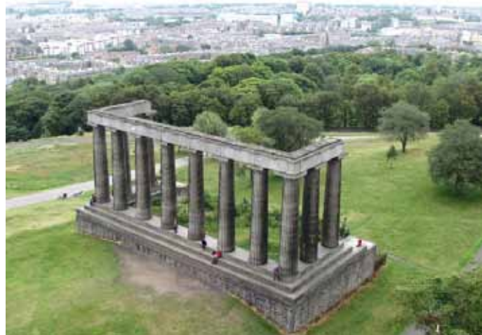
The National Monument, Calton Hill

Dominating Calton Hill are more examples of Edinburgh's neo-classical taste. This group of monuments built in ancient Greek styles can be seen across the city. The largest is the unfinished National Monument. Inspired by the Parthenon in Athens this was designed to be a huge church commemorating Scottish soldiers who died in the Napoleonic Wars in France. Just look at the size of it! Dragging each immense stone up the hill took 70 men and 12 horses. The project had an estimated cost of £40,000 but only £26,000 was raised and in 1829 the money ran out leaving only a dozen finished columns.