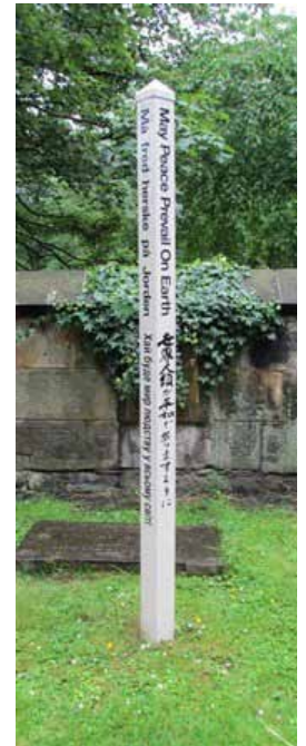
St John's Peace Pole

Look out for memorials and graves like the ones we have seen at St Cuthbert's and St John's in your local church. You may be surprised at what international links you can find!