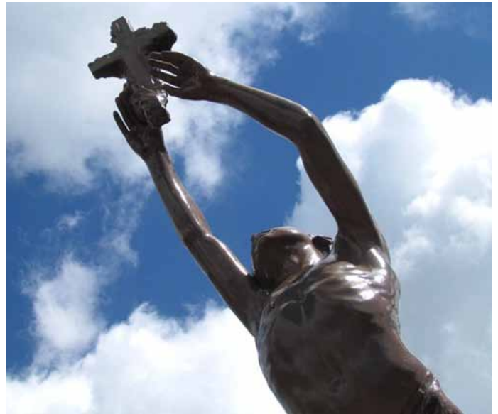
The statue of Youth, Dover War Memorial

Behind the memorial is Maison Dieu House which dates from 1665. Today it is the home of Dover Council. As the civic authority of Dover, the council are responsible for maintaining the memorial.