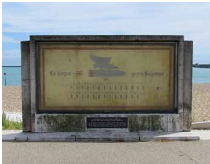
"It flew against England" - the Nazi gun armour plate

This is a piece of armour plating from a Nazi long-distance gun. It shows an eagle riding a bullet with the words 'Es flogen gegen England' or 'It flew against England'. Underneath is a tally of shells that the gun fired.