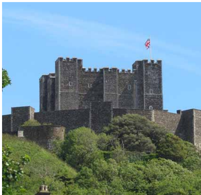
Dover Castle keep

The Saxons and the Romans first took advantage of this natural defence site. A castle was long established by 1066 when William the Conqueror arrived in Britain; he travelled to London via Dover especially to capture the Castle. Much of the Castle we can see was built 200 years later in the twelfth century. Dover became the first concentric fortress in Western Europe with two lines of defence walls.