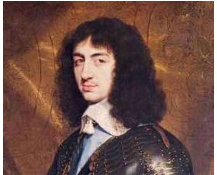
Charles II in 1653 during his exile in the Netherlands

Events culminated in 1649 when Charles I was executed. For over a decade England was ruled by a commonwealth rather than a monarchy. The dead king's son, Charles II, fled to France and then the Netherlands.