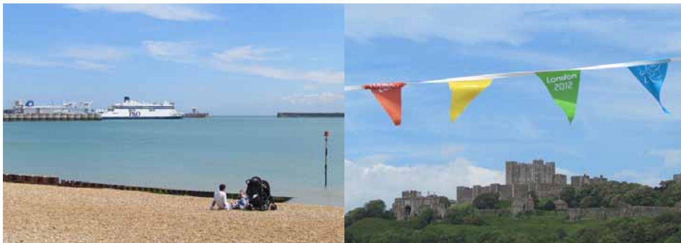
Enjoying a day at the beach