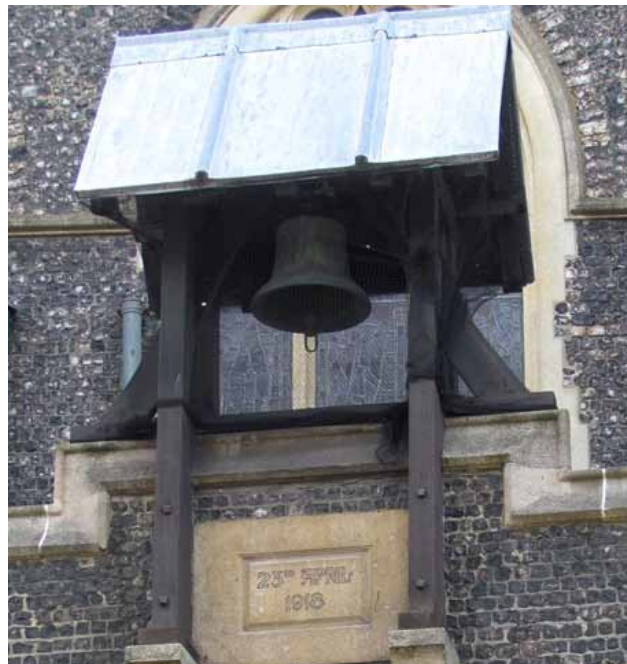
The Zeebrugge Bell, Dover Town Hall

The building was added to over the centuries including a chapel in 1227. King Henry III is thought to have attended a service here. When Henry VIII founded the Church of England in the 1530s the Maison Dieu was given to him and it became a military hospital and supply base.