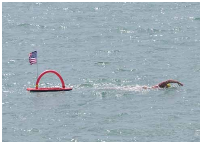
An American swimmer training to cross the Channel

People from many Olympic and Paralympic nations have swum the Channel since creating and breaking various records. They include swimmers from France, the United States, Italy, Australia, Argentina, Bangladesh, Egypt, Canada, Spain and Bulgaria.