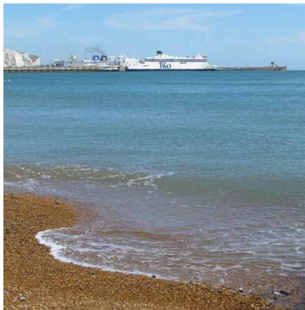
A car ferry at Eastern Docks seen from the beach

The sea is calm to-night. The tide is full, the moon lies fair Upon the straits; —on the French coast the light Gleams and is gone; the cliffs of England stand, Glimmering and vast, out in the tranquil bay.