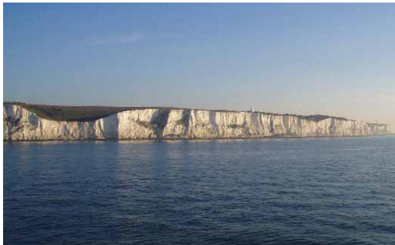
The White Cliffs seen from a car ferry into the Eastern Docks

The cliffs are about 136 million years old and reach up to 350 feet (110 metres) high. They get their distinctive colour as they are made of chalk highlighted by black flint.