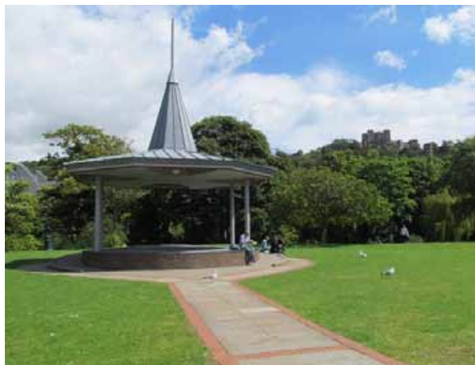
The Timeline Pathway at the bandstand

To follow the trail start with the first stone on the left and continue clockwise around the bandstand. The first event listed is the building of two Roman lighthouses in 120 AD. One of them still survives: the Pharos in the grounds of Dover Castle.