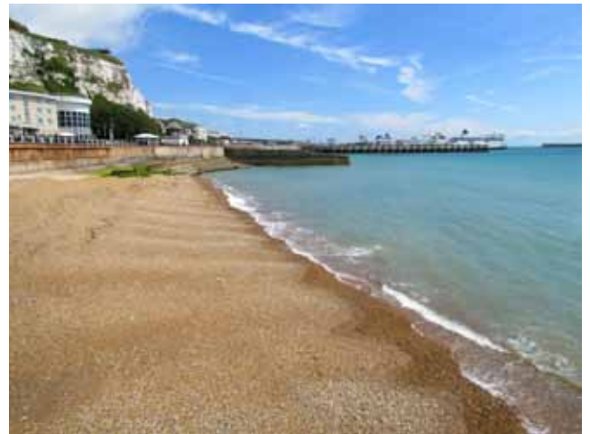
Dover beach, the White Cliffs and Eastern Docks

For centuries the ancient town of Dover on the Kent coast has been the literal and symbolic gateway between Britain and Europe. As a result Dover has been called the 'Lock and Key of England', welcoming travellers and battling invaders throughout British history.