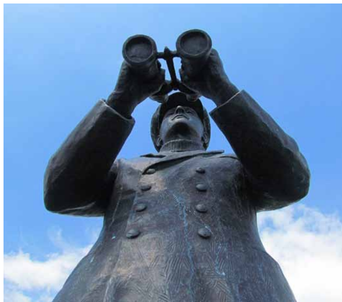
Merchant Navy memorial

This memorial is a tribute to the Merchant Navy forces that helped to protect Britain during the Second World War. As an island Britain relied on supplies shipped from abroad. For Britain to survive the war it was essential to keep sea supply lines open. So Merchant Navy ships continued to import goods into Dover despite constant attacks from enemy submarines and aircraft.