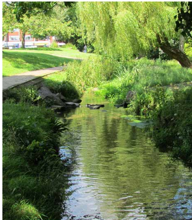
The tranquil River Dour

The river really flourished under the Romans. After the Roman invasion of Britain in 43 AD the Dour estuary was developed into Dover's cross Channel port. The Roman name for Dover was Dubris or 'the Waters'. In around 85 AD Dover became the home port of the Classis Britannica or 'the British fleet'. The Classis Britannica protected Roman trade routes between Britain and France and provided supplies for the Roman forces based in Britain. The River Dour would have been lined with their ships.