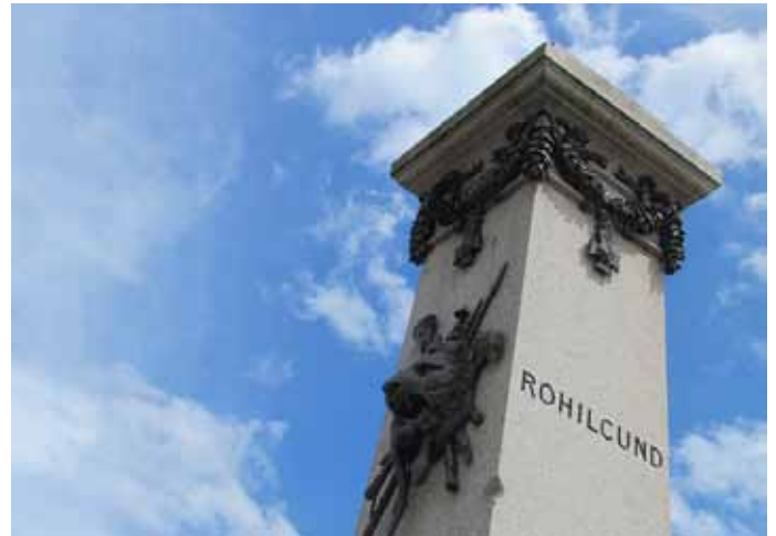
Detail from the Indian War memorial

India was the 'jewel in the crown' of the British Empire and produced many valuable commodities that were exported around the world including dye, silk, cotton, tea and opium. Most of this trade was organised by the British East India Company. The Company was very powerful with military and legal powers.