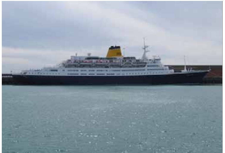
The Saga Ruby at Dover, July 2012. It's home port is in Malta and the ship has travelled to the United States, Norway and the Bahamas

Catamarans are vessels with two hulls that originated in India as small fishing boats. The first hovercraft were developed in Austria, Russia and Finland. The first commercial hovercraft was tested between Dover and Calais from 25th July 1959, the 50th anniversary of Bleriot's flight.