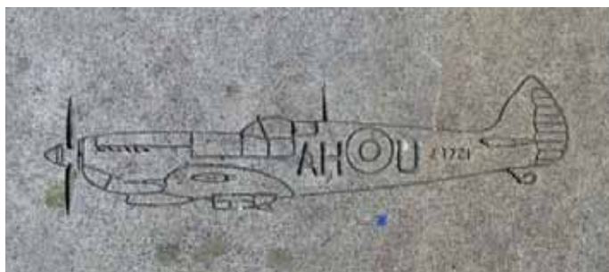
Spitfire fighter plane on the Timeline Pathway

Many of the other flagstones have connections to Olympic and Paralympic nations. The Black Death (or the plague) arrived in Dover in 1348. The Black Death originated in China and was spread through Europe on trade routes. The disease probably came into Dover on a ship with infected rats. As you continue there are plenty more international links to find such as French Huguenot settlers or state visits from Belgium and Japan. See what else you can spot!