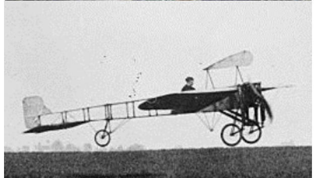
Channel pioneers: Charles Rolls driving the first Rolls-Royce, Blanchard's balloon crossing, Bleriot in flight

Country links - Belgium, France, Switzerland, Trinidad & Tobago, United States of America