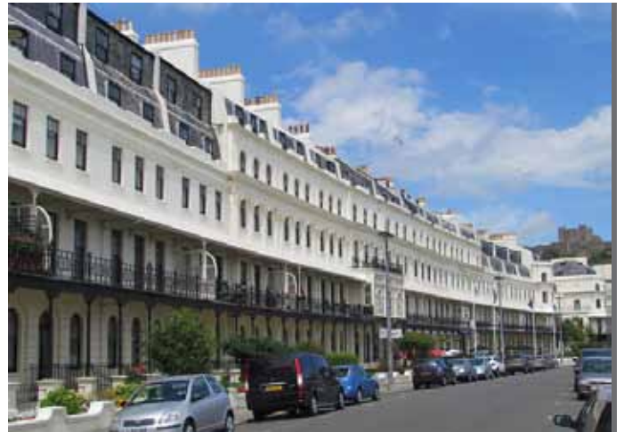
Waterloo Crescent sweeping toward the Castle

The building is part of a terrace built in Georgian style. The Georgian period is named after Britain's four kings all named George who ruled from 1714 to 1830. They came from the noble family of Hanover in Germany. Georgian architecture is known for well-proportioned symmetrical designs. The style became very fashionable throughout the British Empire, particularly in the United States, Canada and Jamaica.