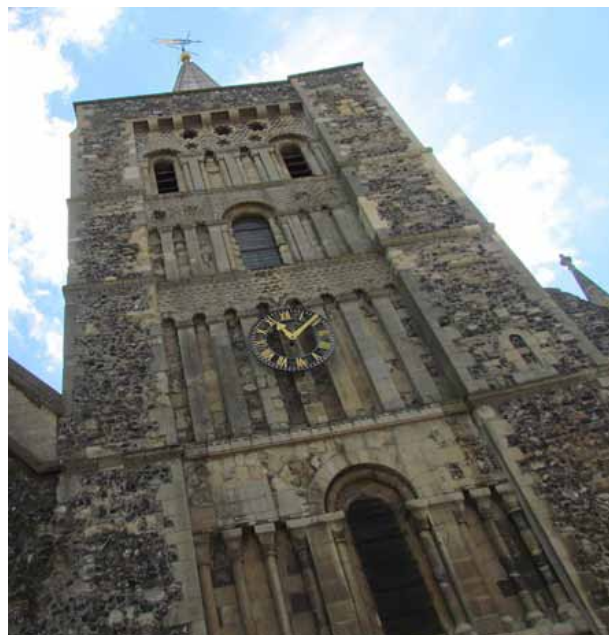
St Mary the Virgin Church's Norman tower

Do go inside if the church is open to explore fascinating links with many Olympic and Paralympic nations. Look out for an impressive Dutch wall painting of the Nativity and a stone plaque from the Protestant Churches of the Netherlands. There are also many war memorials, including to those who fell in Belgium, France, India and South Africa.