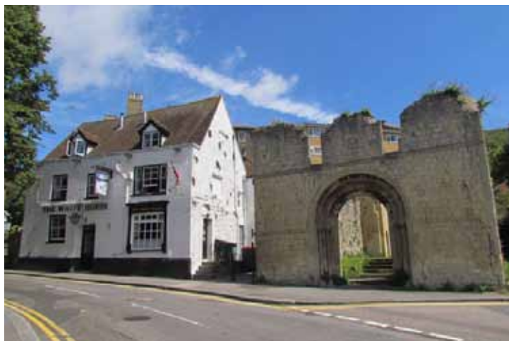
The ruins of Old St James Church beside The White Horse pub

The Cinque Ports were five ports on Britain's south coast – Hastings, Romney, Hythe, Sandwich and Dover. These ports had special royal privileges, such as tax exemptions and their own law courts. In return the ports were expected to provide men and ships for the Navy during wartime. You can still see the Cinque Ports emblem – three ships on a red and blue shield – throughout Dover.