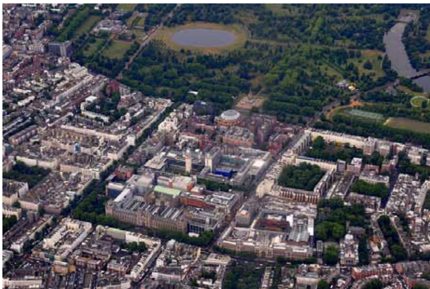
Aerial view of Albertopolis

Explore this cultural quarter with its magnificent buildings and great institutions. And hear some remarkable stories about diplomats and spies, musicians and artists, explorers and inventors, immigrants and refugees.