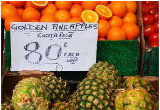
Some of the sights around Birmingham, the "Workshop of the World"