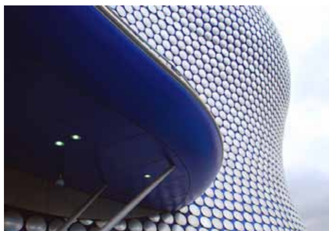
Views of the 'Workshop of the World' Mike Jackson © RGS-IBG Discovering Britain