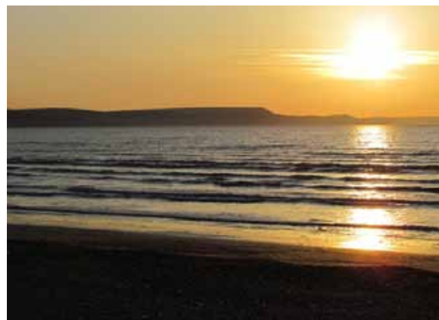
Scenes from Weymouth