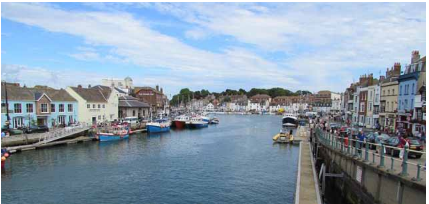
Weymouth Old Harbour from the Town Bridge