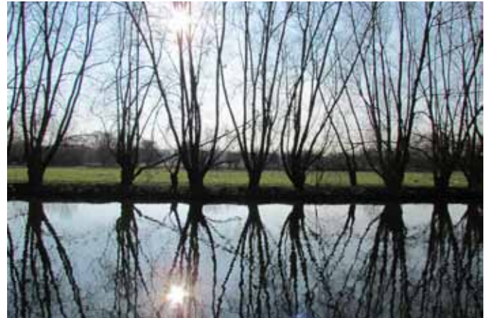
Pollarded trees at Rewley

Discover gushing mill streams and picturesque flood meadows, walk along an industrial canal and a working river, watch leisure boating and competitive rowing. Look for evidence in the names of neighbourhoods, streets, bridges and pubs giving clues to the watery history of this city.