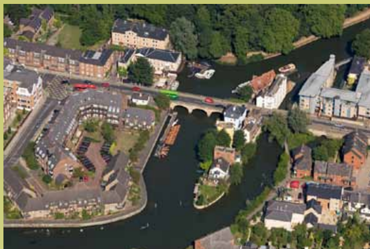
Folly Bridge and island

A self guided walk along Oxford's waterways