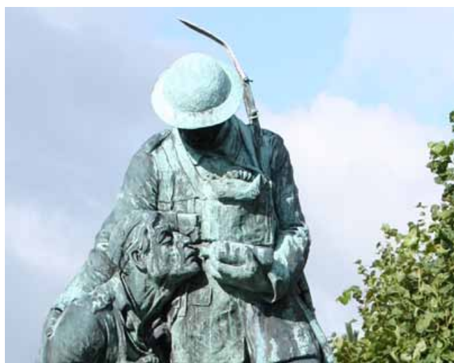
Westfield village war memorial

This walk tells the story of how Lancaster's economy developed and the wealth that resulted. Imports of mahogany, sugar and flax made the fortunes of traders; loads of coal and limestone were the cargoes of canal barges; while the mills and factories produced furniture, stained glass windows and linoleum which were exported nationally and internationally.