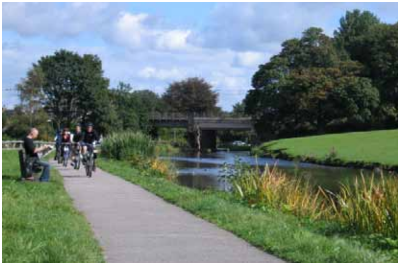
Cyclists on the Lancaster Canal towpath

Below lies the River Lune which winds its way eight miles further to the Irish Sea while through the centre of the city runs the Lancaster Canal. These two waterways have played a very significant role in Lancaster's history.