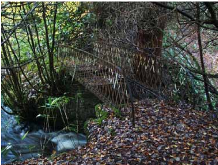
Discover remains of iron footbridges and scenic walkways

Amidst a landscape of woods and rhododendrons are stone, brick, iron and concrete features that offer a tantalising glimpse of the buildings and structures that once stood here.