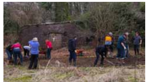
Kilmahew: a site with layers of history