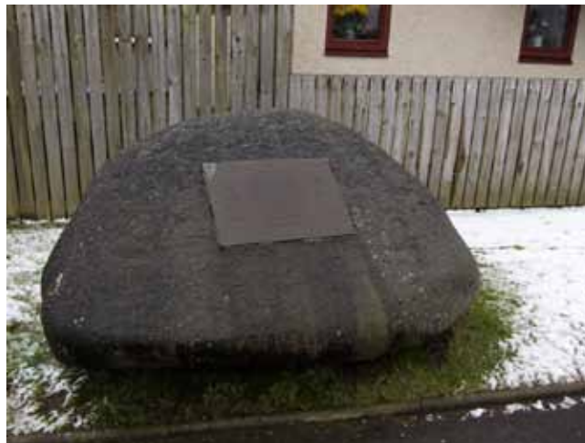
Plaque to the Napier family in Cardross village

Shortly before the red telephone box and second pedestrian crossing find a boulder with a plaque to the left of the pavement. Stop here and listen to Track 2.