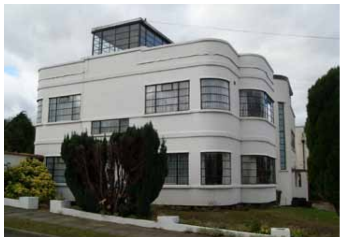
River Cray signpost / 1930s housing at Coldblow