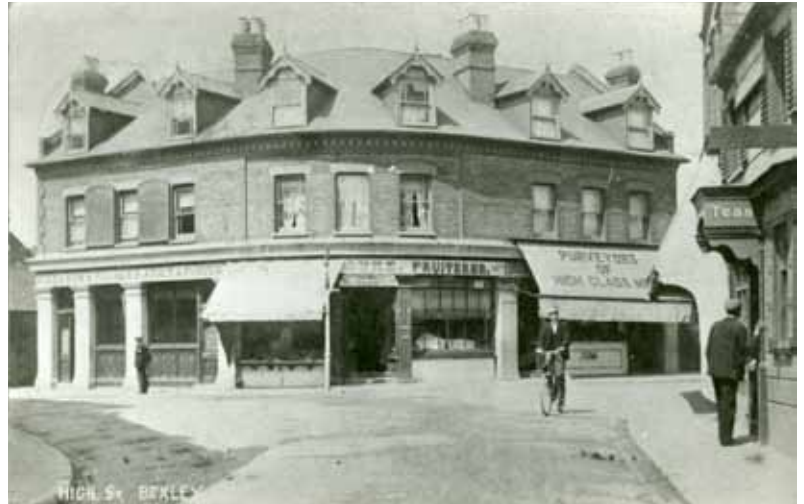
Bexley High Street (1910)

Today, Bexley is virtually the last village on the edge of London and maintains a distinct feel and character. This walk explores how Bexley village has developed over more than a thousand years.