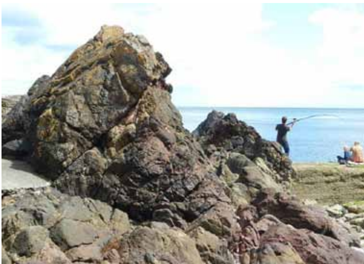
Rocky outcrop at Babbacombe harbour

See where rocks were taken away by day and drugs were brought in by dead of night. Learn of genteel Victorians with their bathing machines and the modern adventure sport of coasteering.