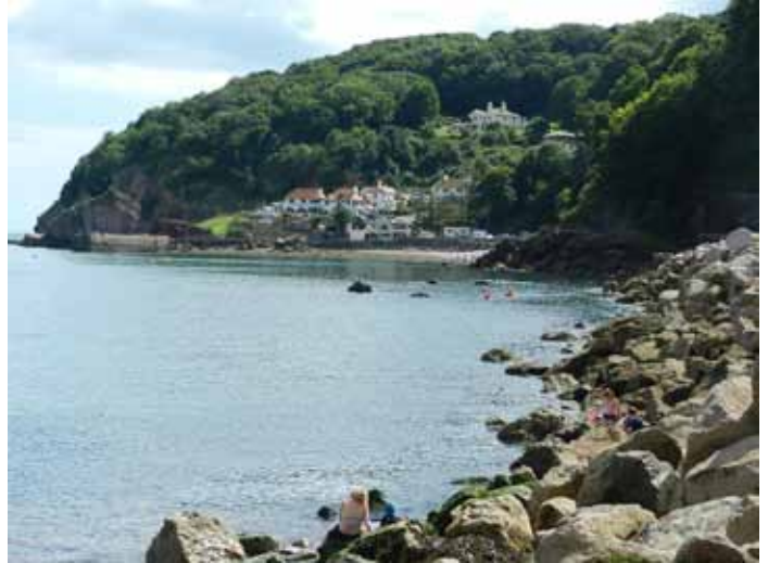
View across to Babbacombe harbour

Find out why a red cliff collapsed into the sea while white cliffs were blasted apart with dynamite. Compare flaky black rocks with pink 'Devon marble'.